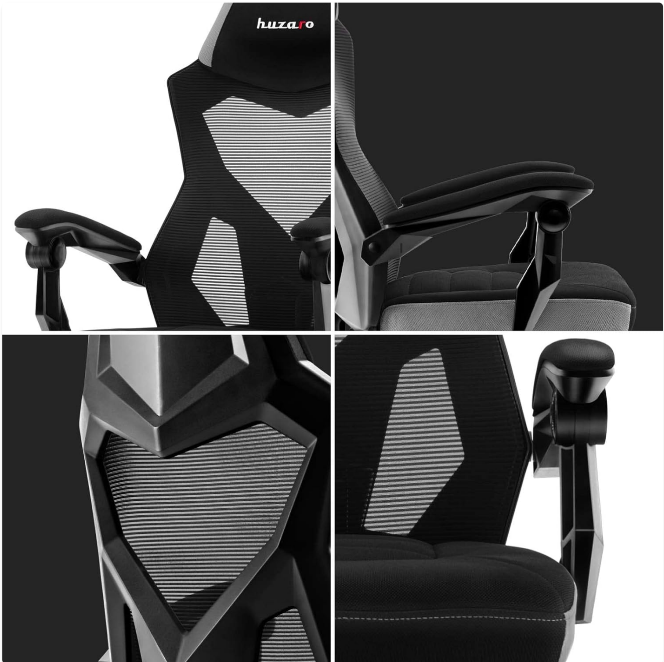
Image: Diagram highlighting the ventilated Air Mesh fabric and foam padding, emphasizing air circulation and comfort.