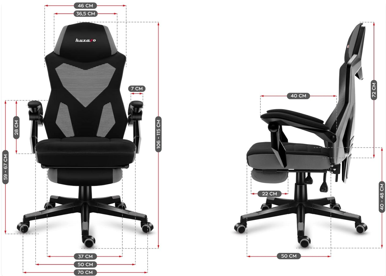
Image: Detailed diagram showing the dimensions of the HUZARO Combat 3.0 Grey Gaming Chair in centimeters.