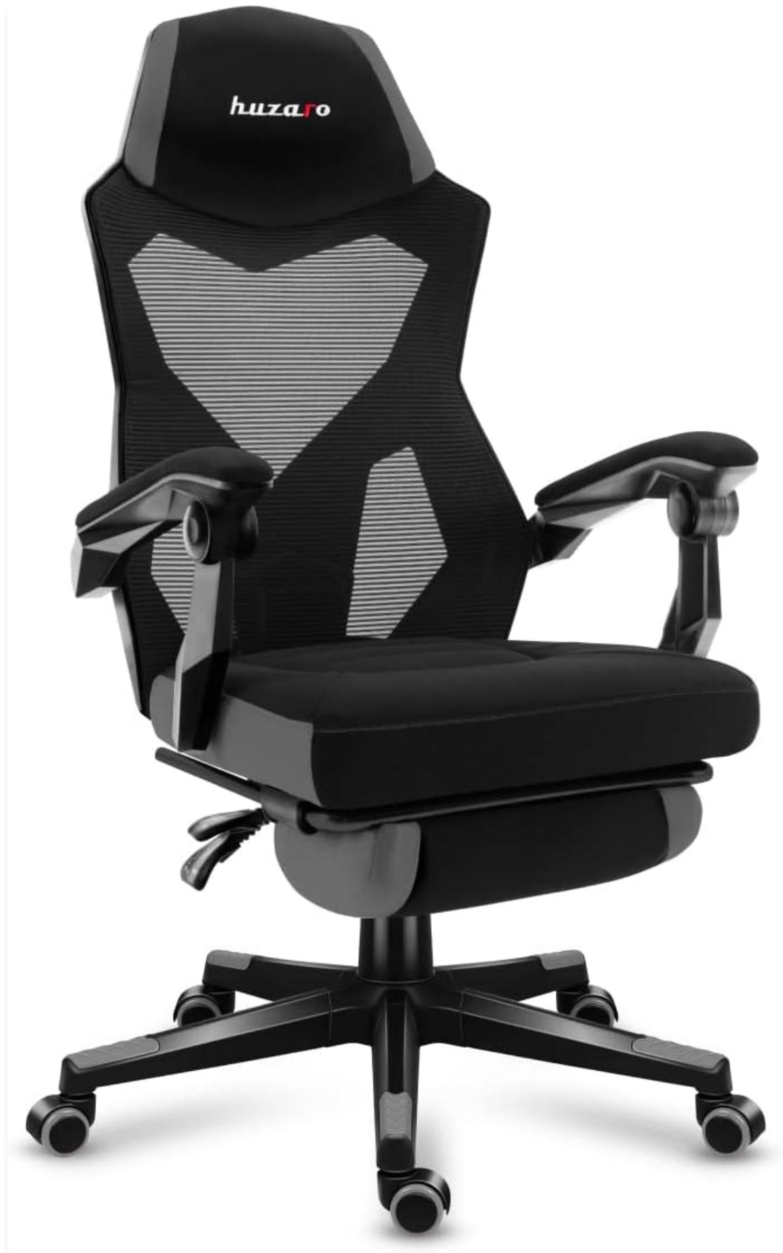
Image: Front view of the HUZARO Combat 3.0 Grey Gaming Chair, showcasing its ergonomic design and grey fabric.