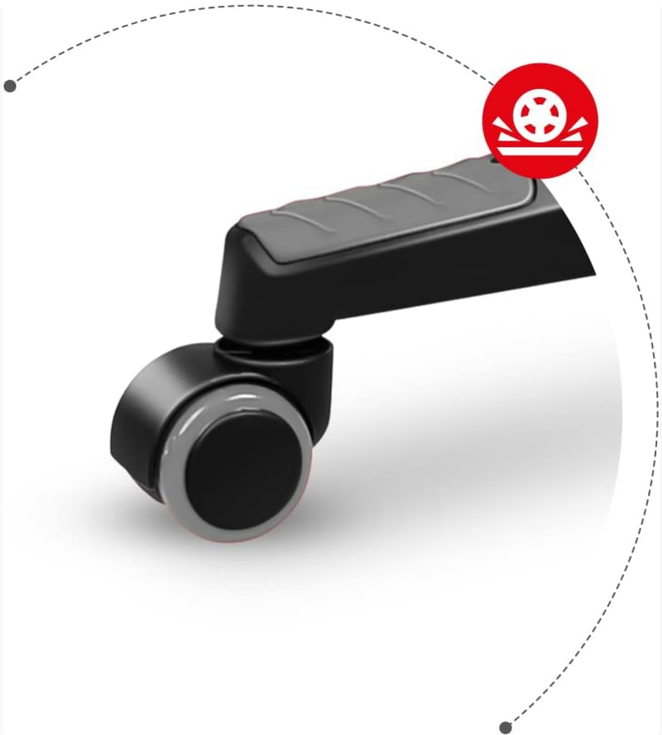
Image: Close-up of a polyurethane rubber caster wheel, designed to protect floors.