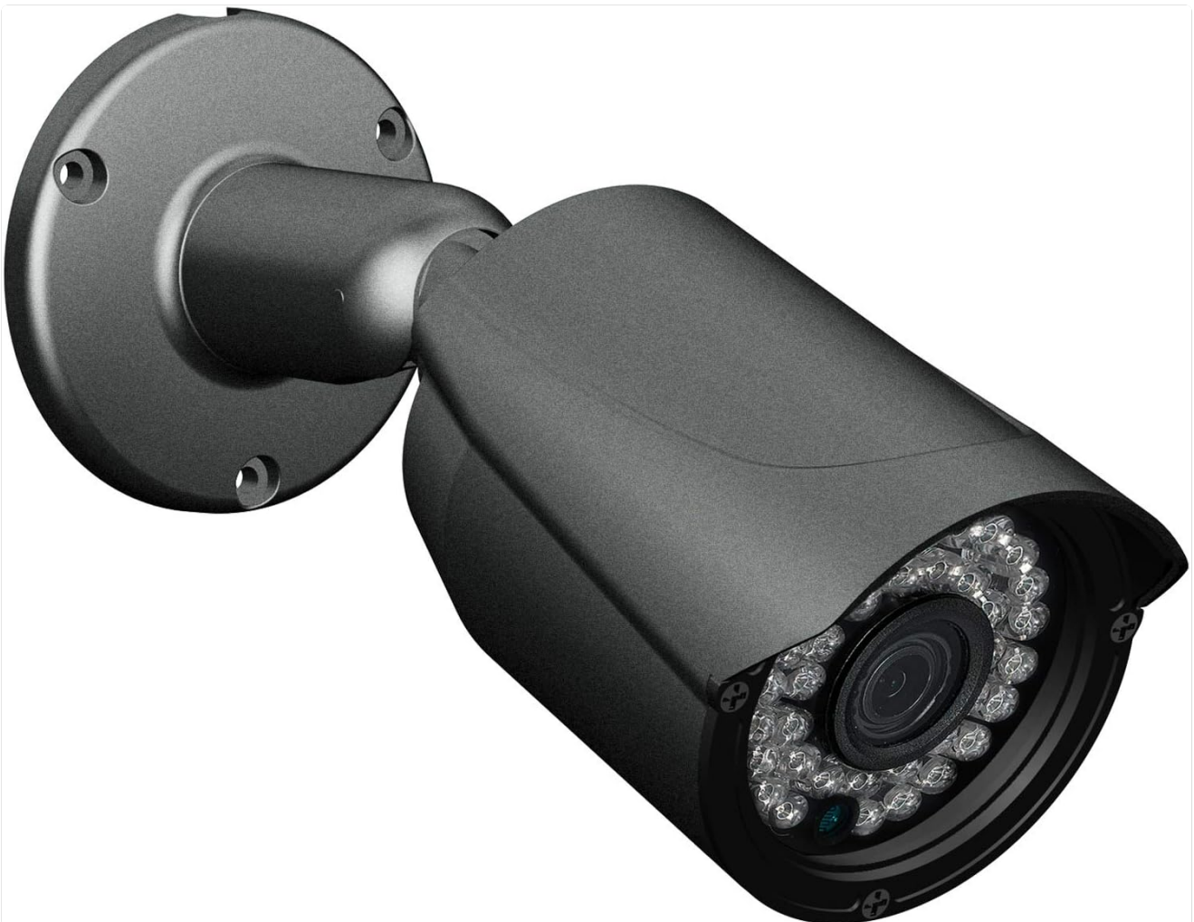
Figure 1: Lifoarey 1080P Security Camera. This image displays the black bullet-style camera with its mounting base and lens,

The Lifoarey 1080P Security Camera is a wired CCTV camera designed for both indoor and outdoor surveillance. It features 1080P HD resolution, a 4-in-1 video output system (AHD/TVI/CVI/CVBS), and robust IP67 weatherproof construction. Equipped with infrared LEDs, it provides clear black and white night vision up to 100 feet.