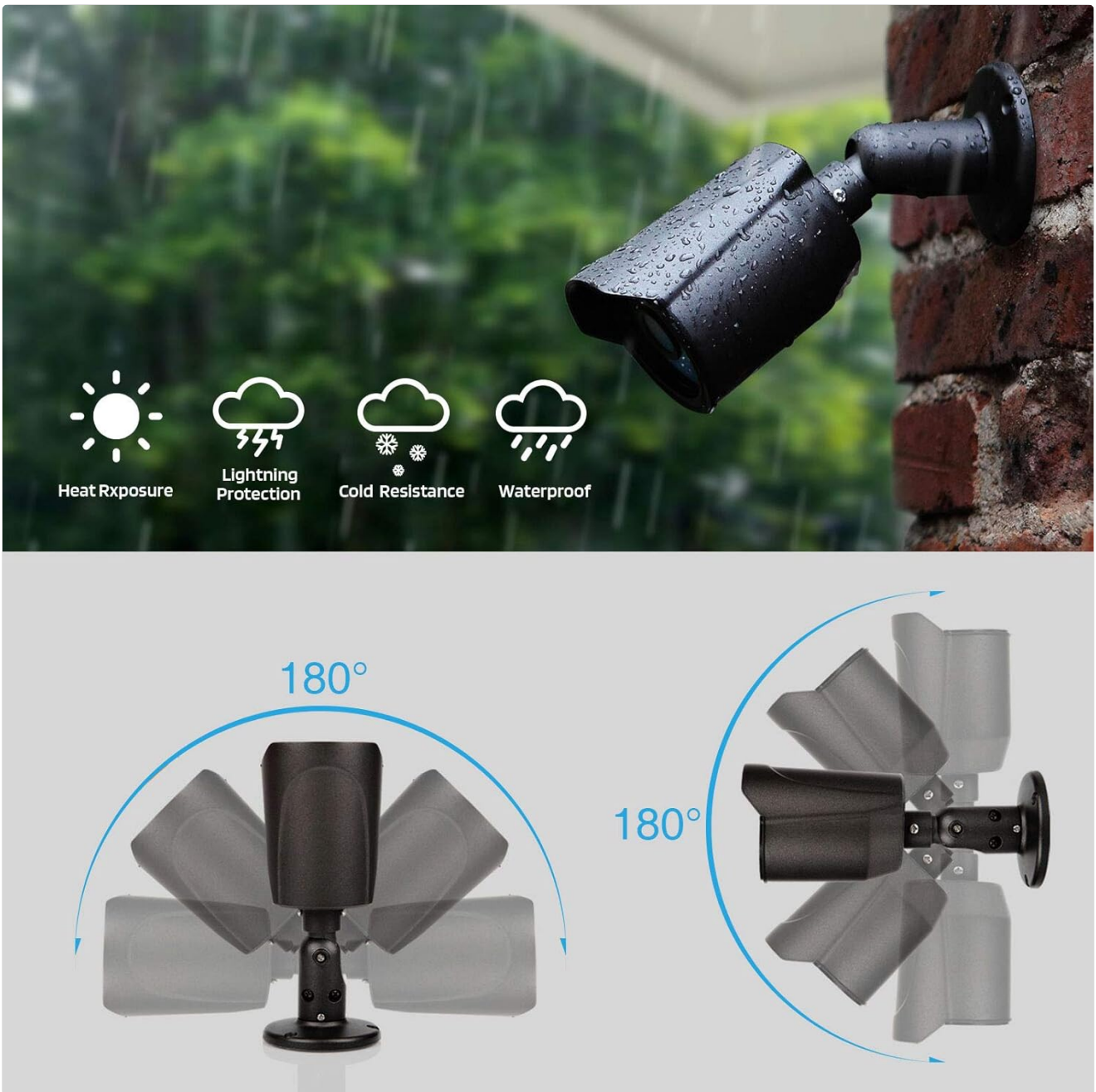
Figure 6: IP67 Weatherproof Features. This image highlights the camera's resilience against various weather conditions such as heat exposure, lightning, cold, and water, ensuring reliable outdoor performance.