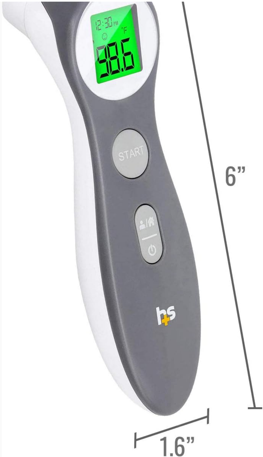
Figure 6: Physical dimensions of the thermometer.