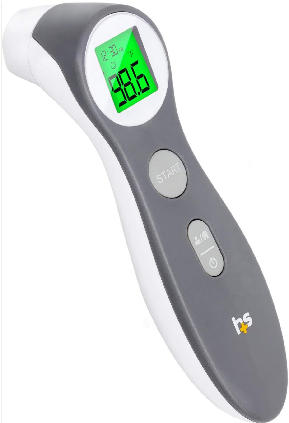
Figure 1: HealthSmart Digital Touchless Infrared Thermometer, front view.