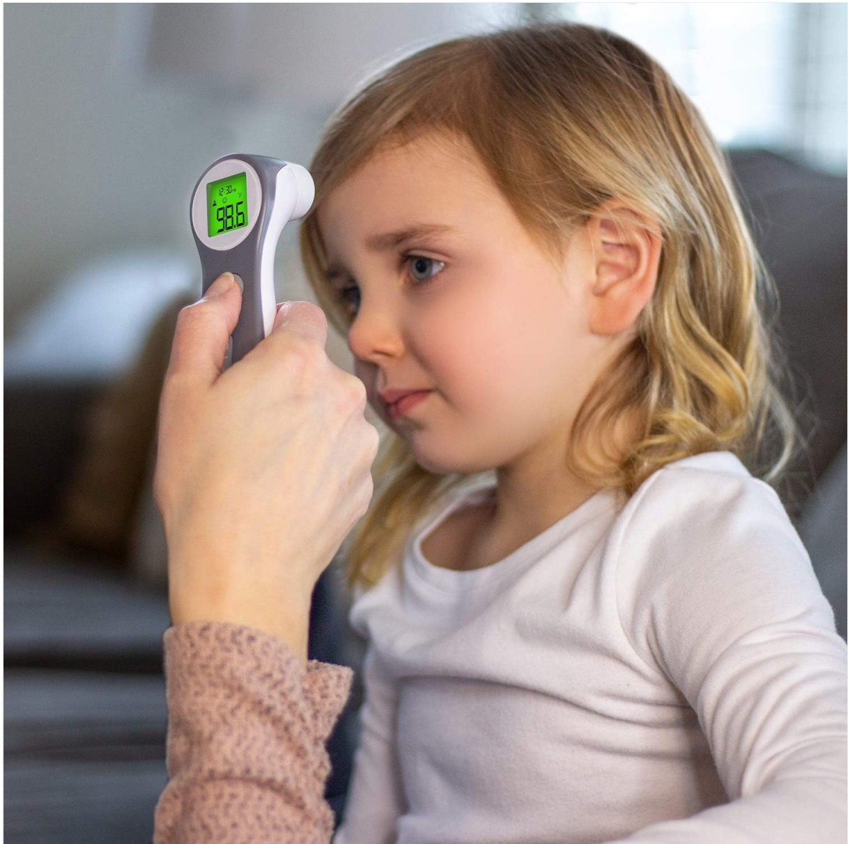
Figure 4: Proper technique for measuring forehead temperature on a child.