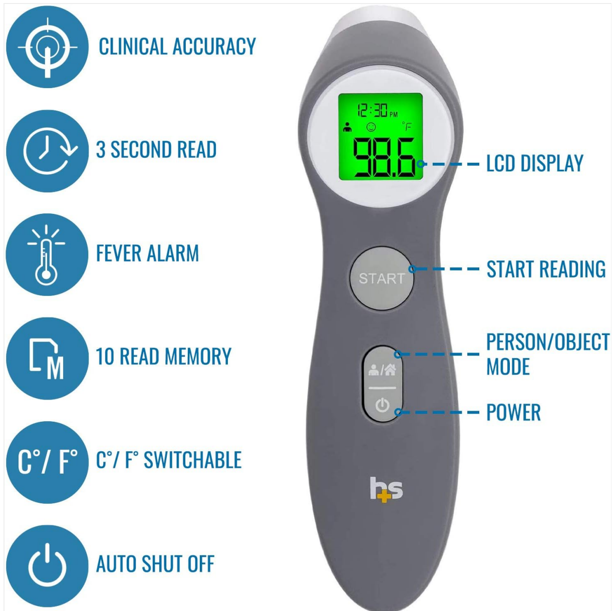
Figure 2: Key features of the thermometer, including LCD display, start button, person/object mode button, and power button.

Familiarize yourself with the components and display indicators of your thermometer.