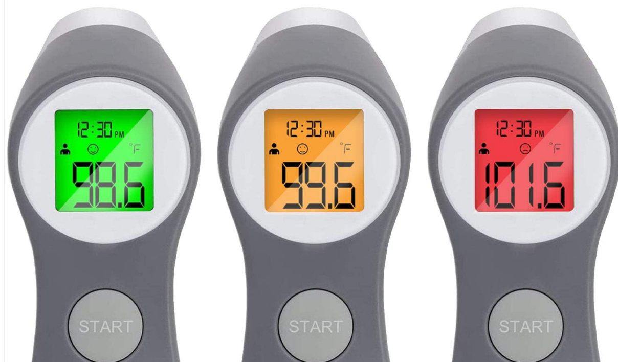
Figure 5: Visual representation of the three-color indicator for temperature readings: Green (Normal), Orange (Low Fever), and Red (High Fever).