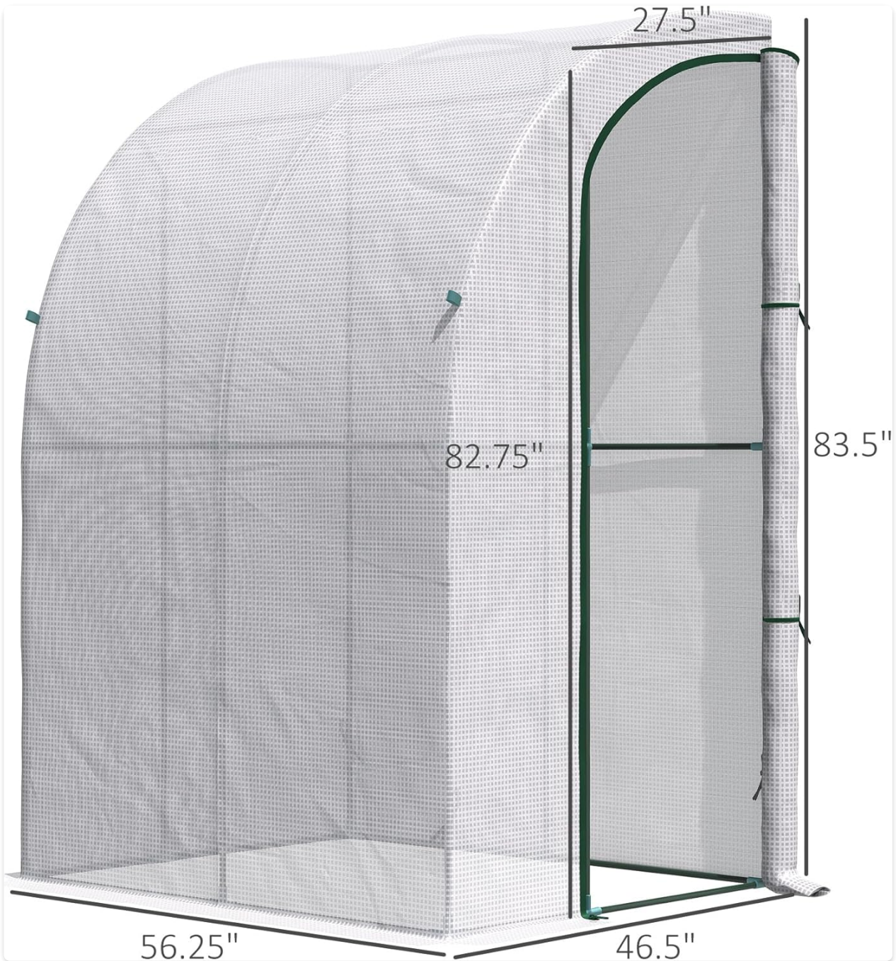
Detailed dimensions of the greenhouse for planning placement.