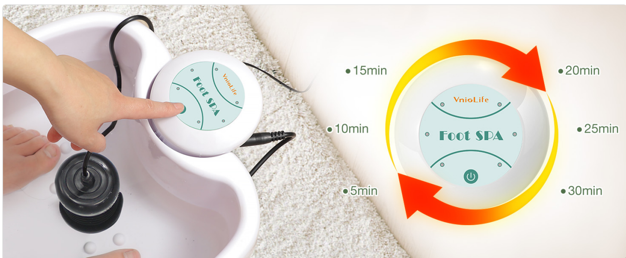
Image 6.2: Diagram illustrating the fixed 30-minute session duration of the VnioLife Foot SPA, with indicators for 5, 10, 15, 20, 25, and 30 minutes.