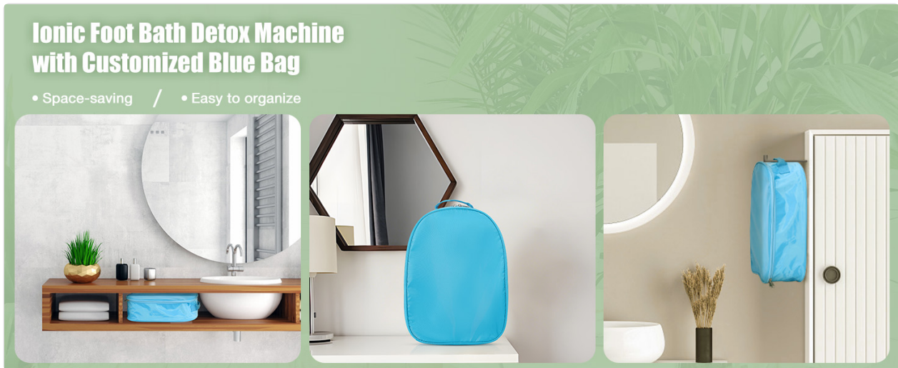
Image 7.1: The VnioLife Ionic Foot Bath Detox Machine with its customized blue carrying bag, demonstrating its portability and ease of storage.