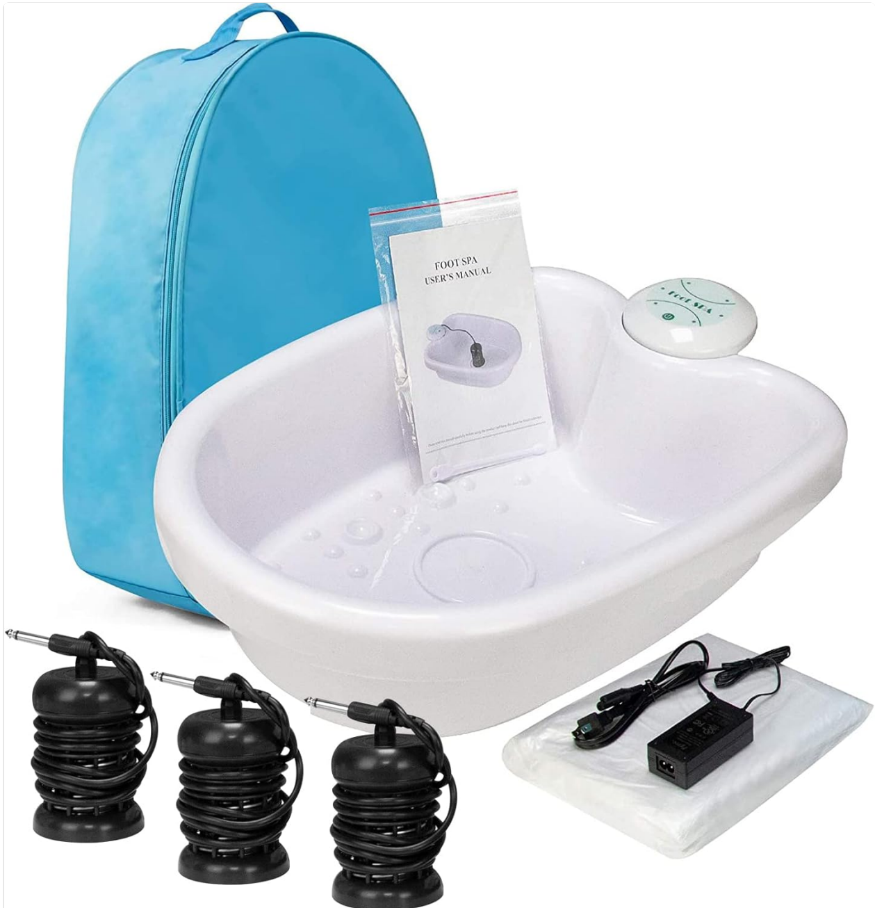
Image 3.1: All components included in the VnioLife Ionic Foot Bath Detox Machine package, including the foot bath basin, control unit, detox arrays, power adapter, disposable liners, and carrying bag.