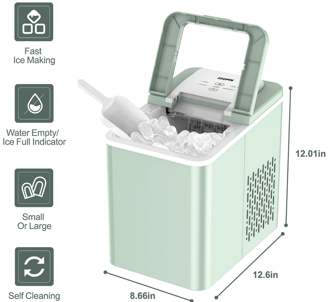
Figure 9: Dimensions and key features of the ice maker.