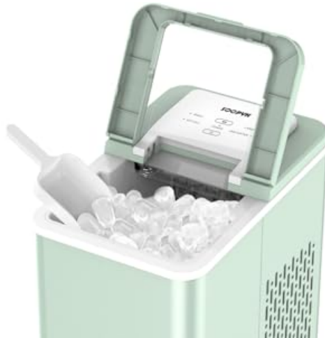
Figure 7: Visual representation of the self-cleaning function.