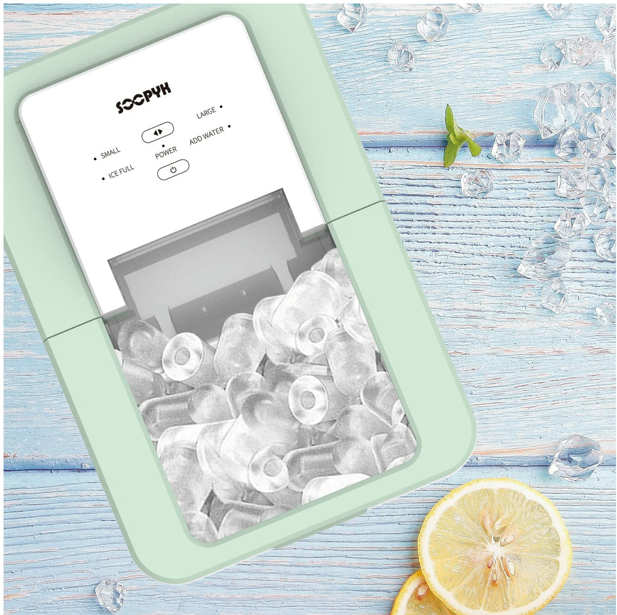
Figure 1: SOOPYK Portable Countertop Ice Maker with ice and lemon slices.