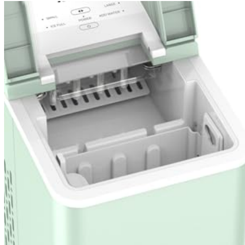
Figure 2: Ice maker showing the ice basket and scoop.