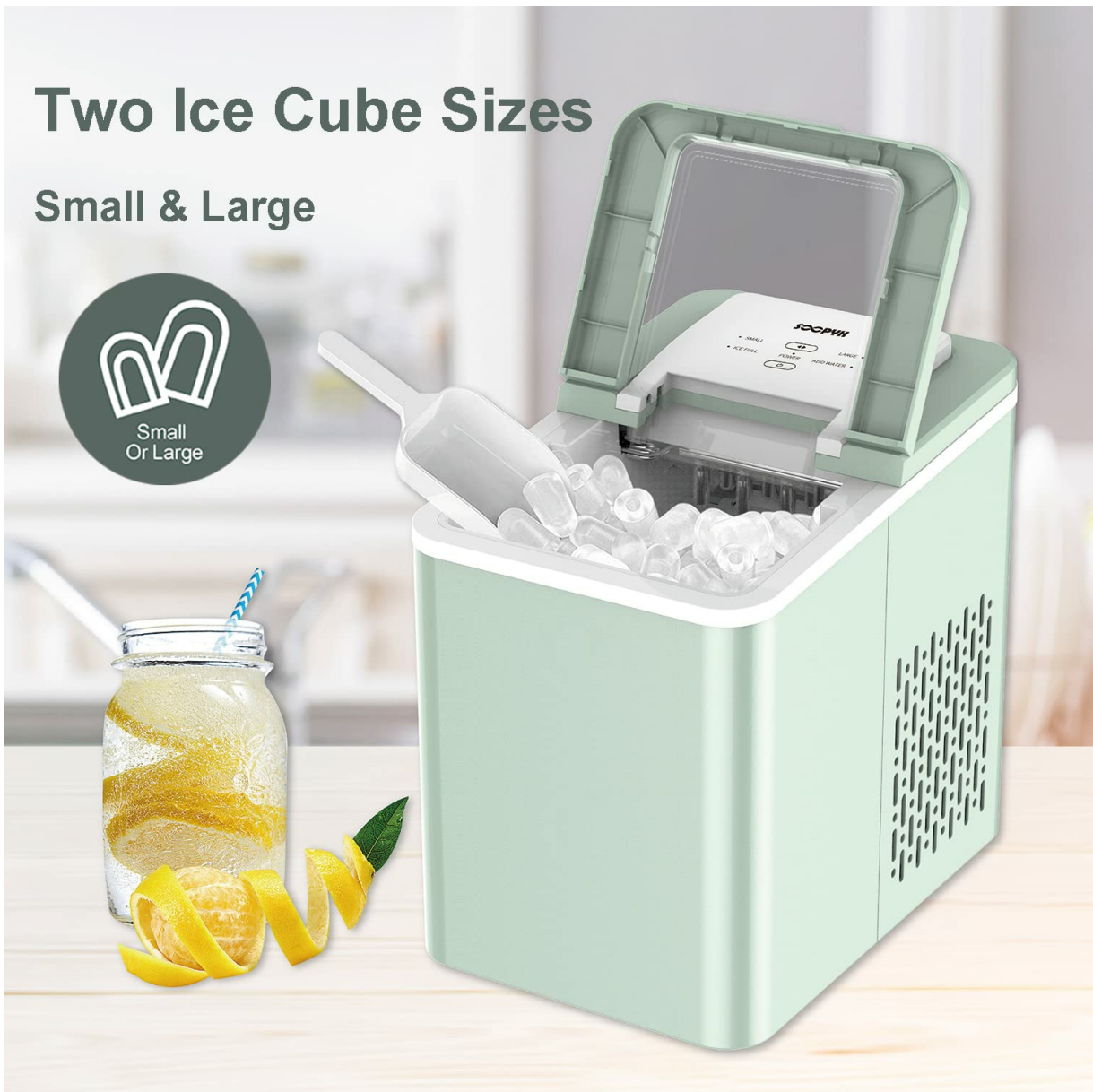
Figure 5: The ice maker offers two ice cube sizes: small and large.