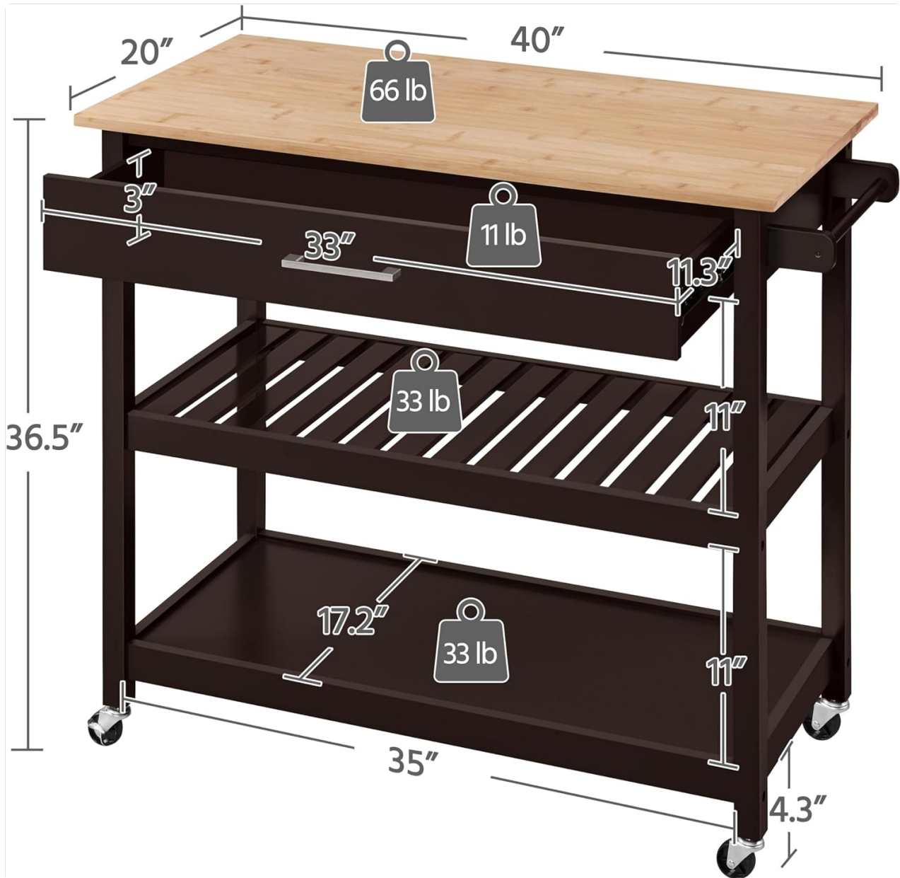
Detailed dimensions and weight capacities for the Yaheetech Kitchen Island. The tabletop supports up to 66 lbs, while each shelf can hold 33 lbs.