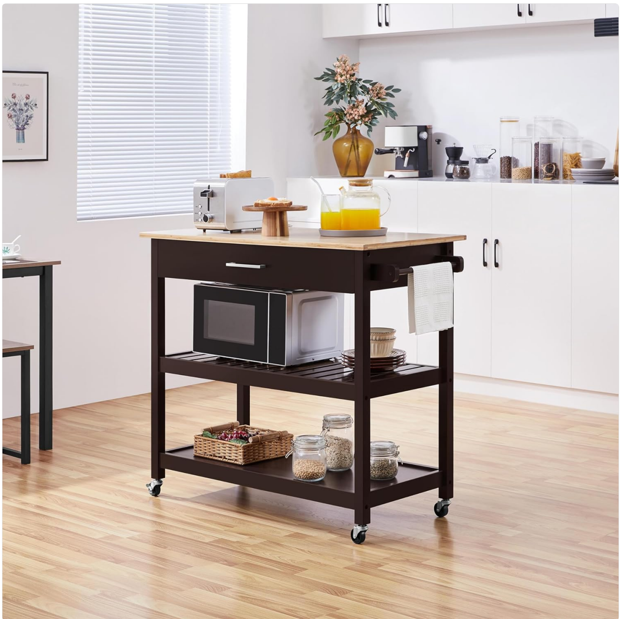
The kitchen island provides ample space for a microwave and other kitchen items, demonstrating its practical use.