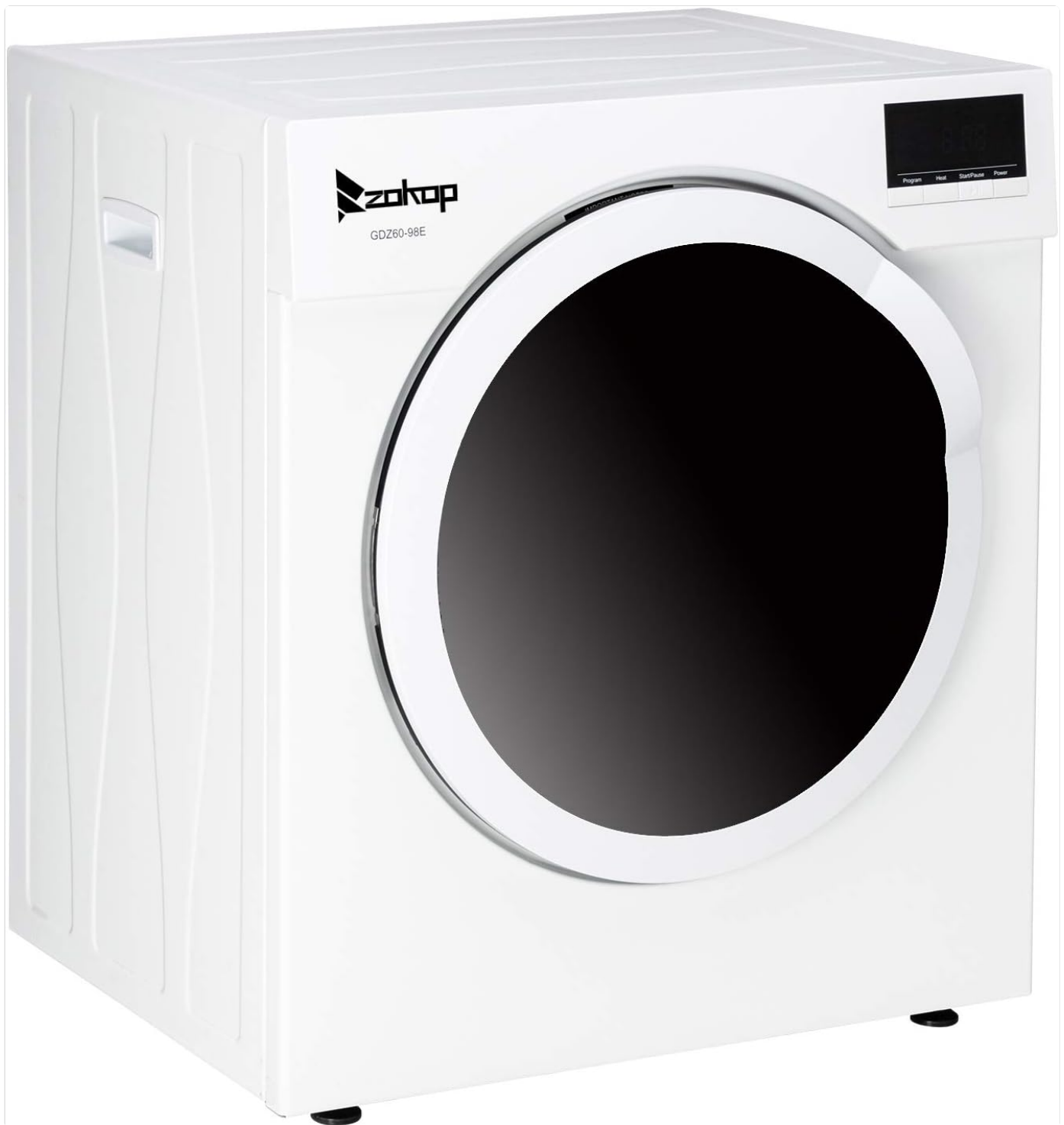
Figure 1: Front view of the ZOKOP GDZ60-98E Household Dryer.