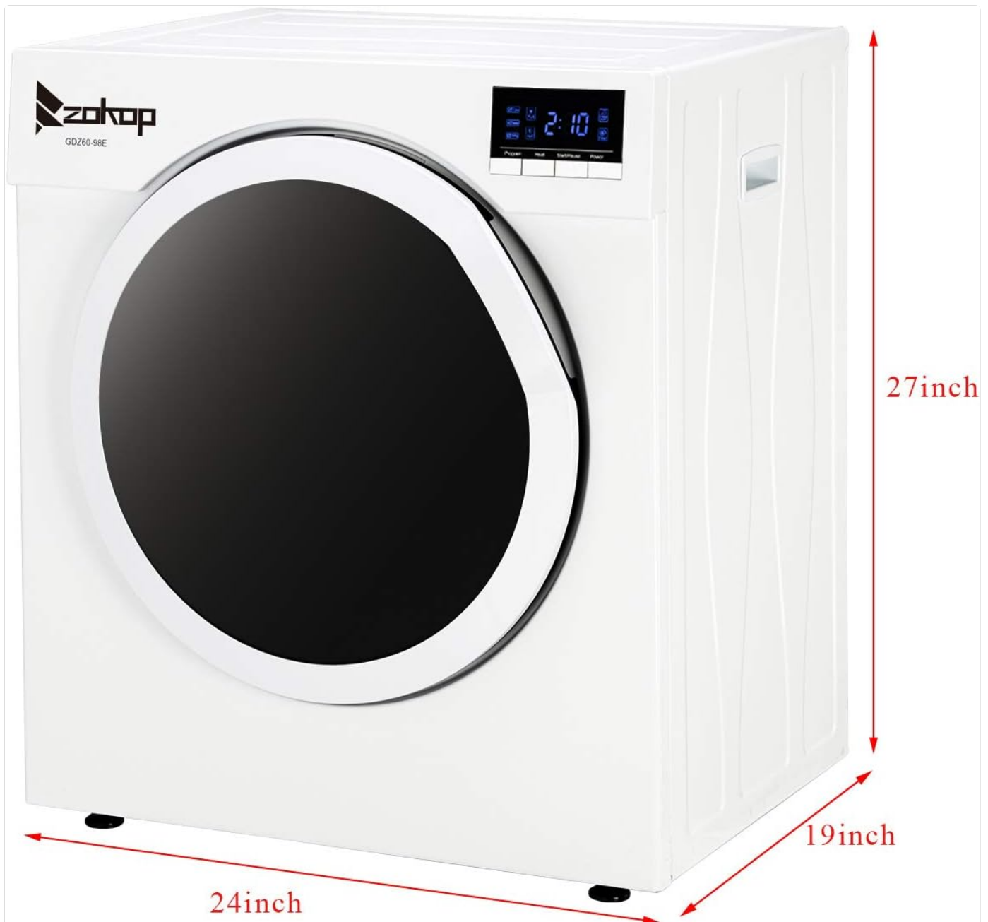
Figure 2: Dryer dimensions for placement planning. Dimensions are approximately 23.62 inches (L) x 18.90 inches (W) x 26.77 inches (H).