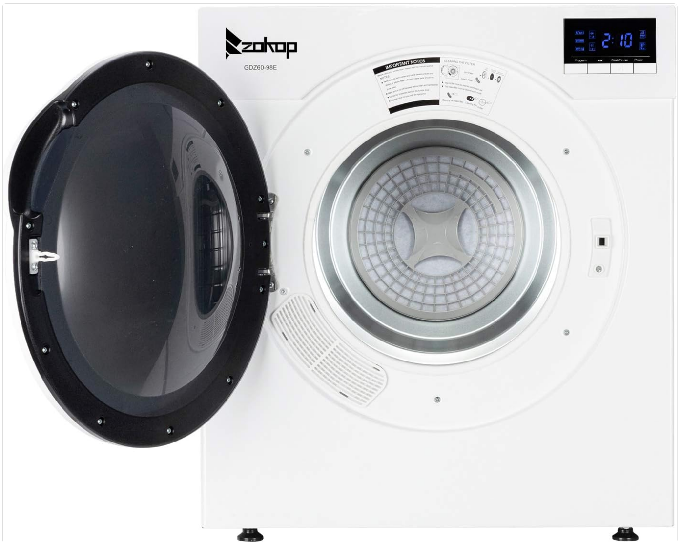
Figure 3: Dryer drum with door open, showing the lint filter location.