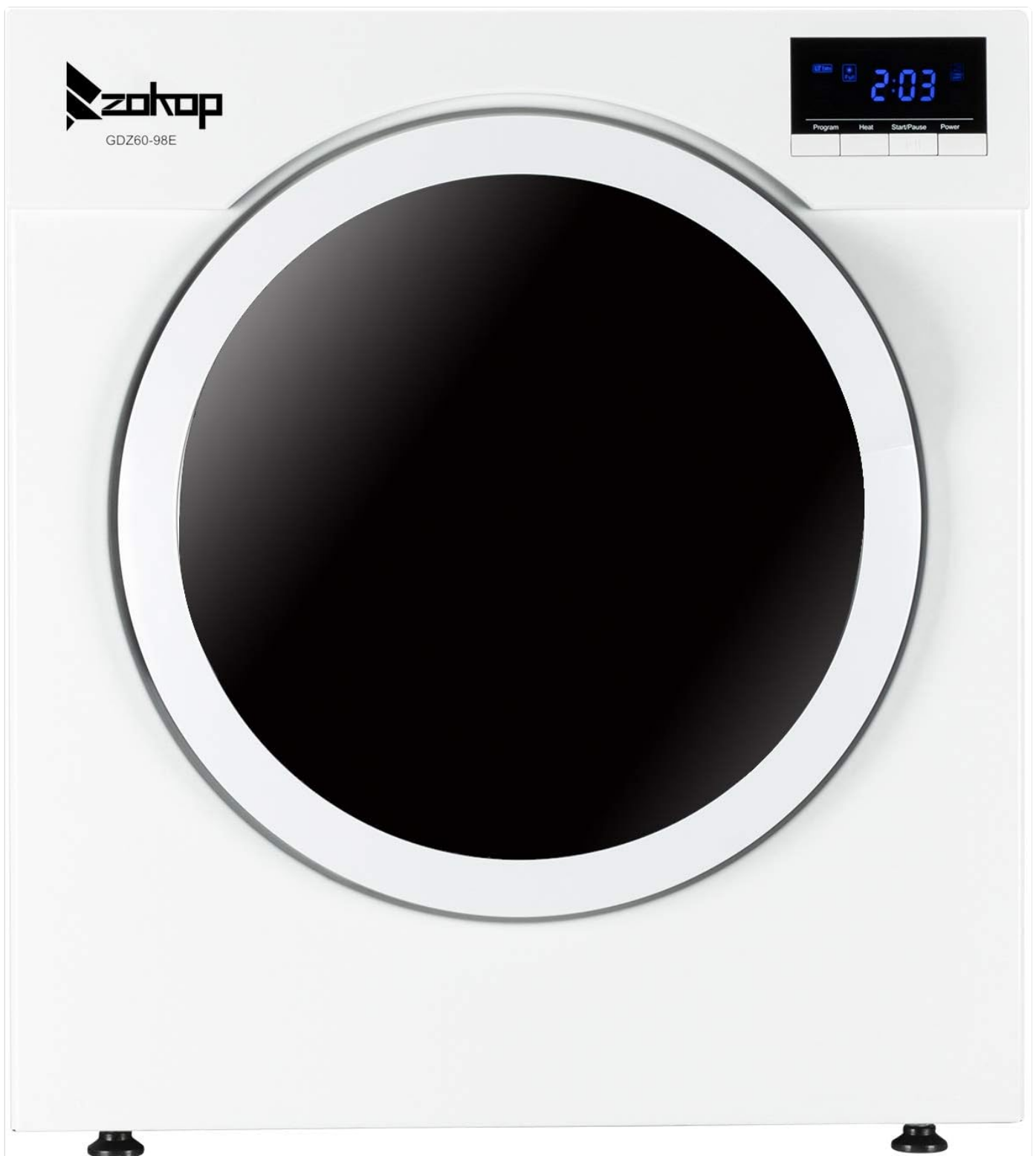
Figure 4: Close-up of the LED control panel, displaying time and program options.