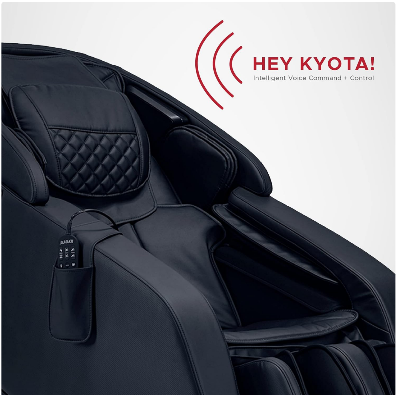
Figure 4: Voice command feature for convenient control.