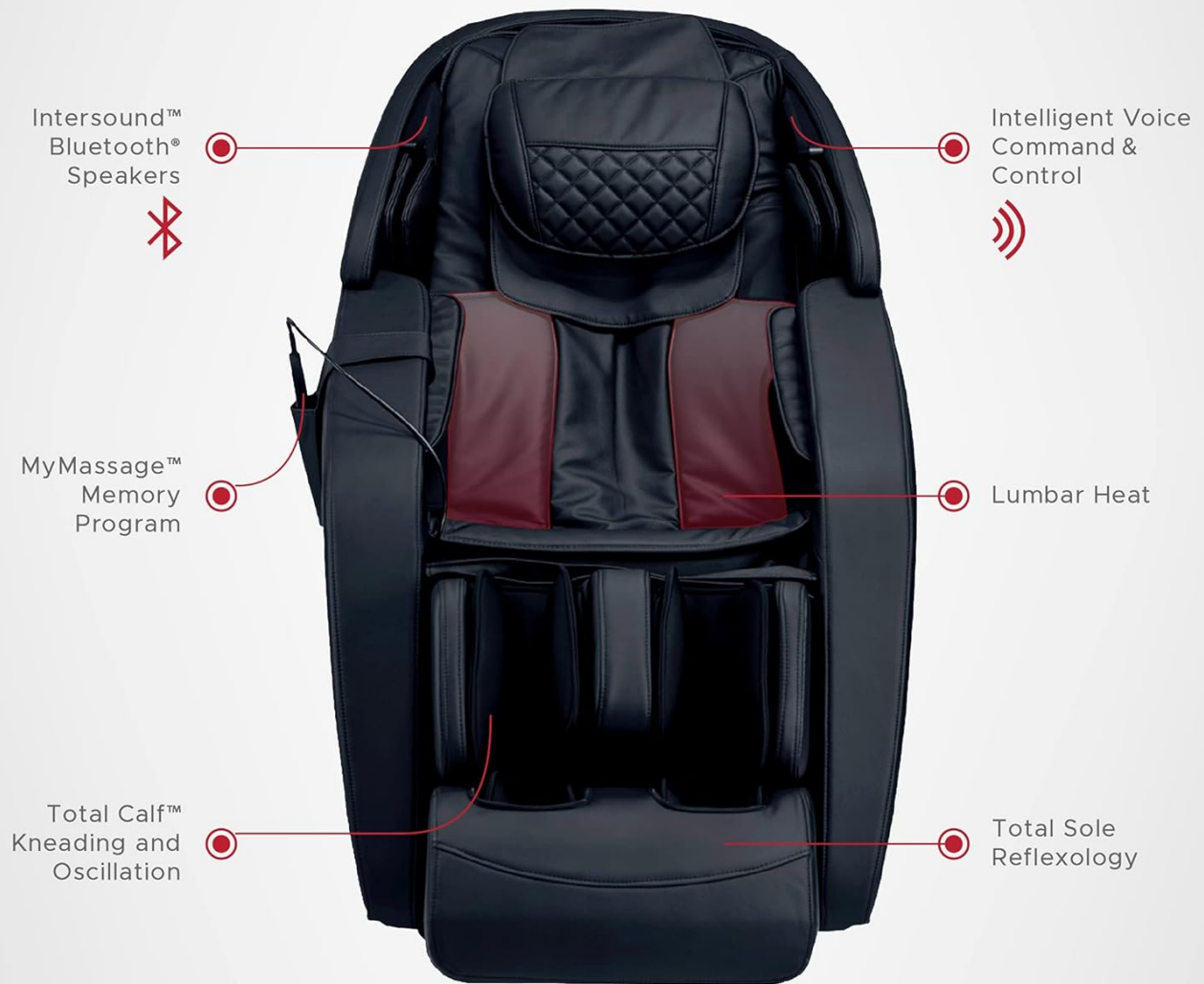
Figure 5: The chair reclined into the zero-gravity position, which helps to improve circulation and reduce spinal pressure.