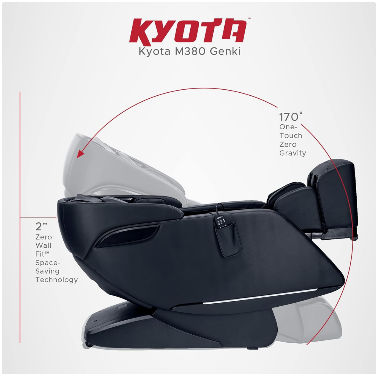
Figure 2: The space-saving design allows the chair to be placed close to a wall.