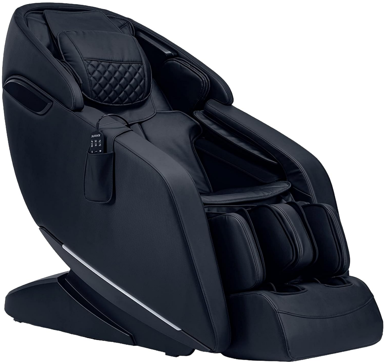
Figure 1: The Kyota M380 Genki Massage Chair in its upright position.