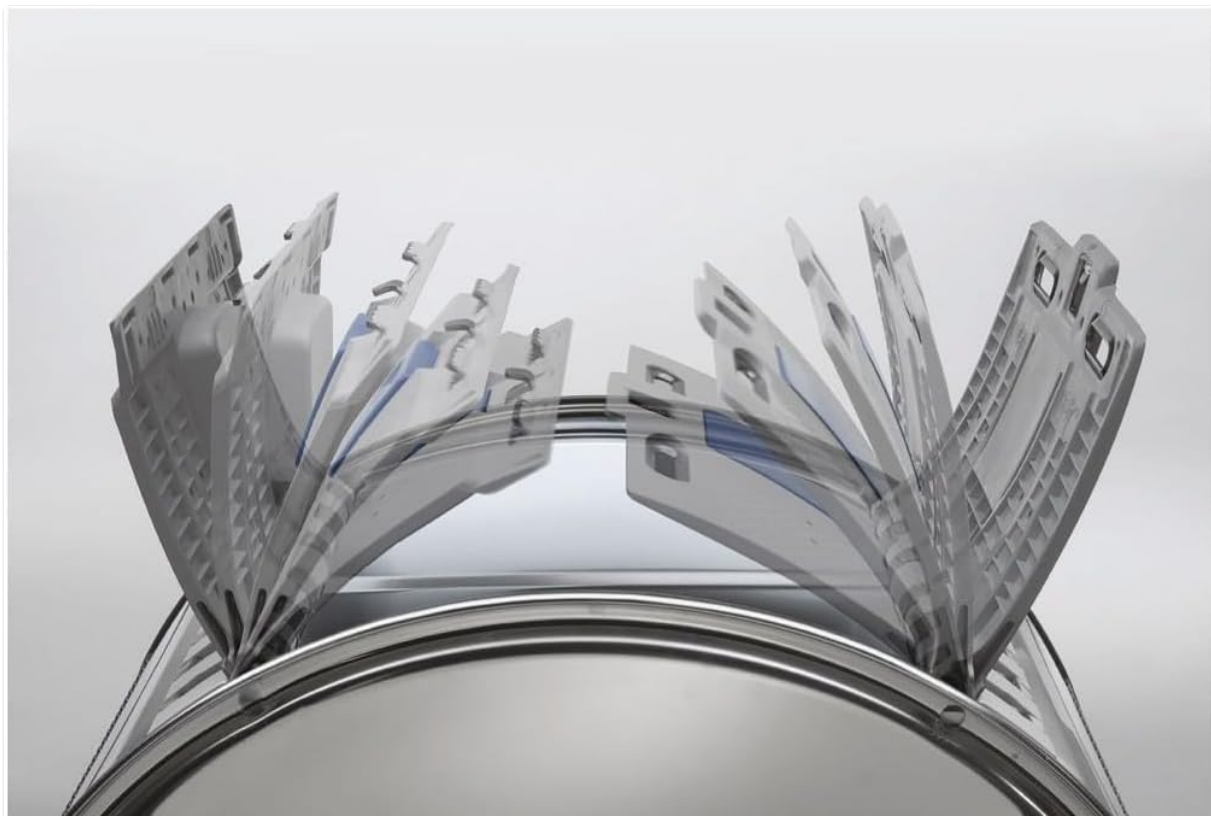
Figure 3.2: View of the top-load drum opening. This image shows the wide opening for easy loading and unloading of laundry, with