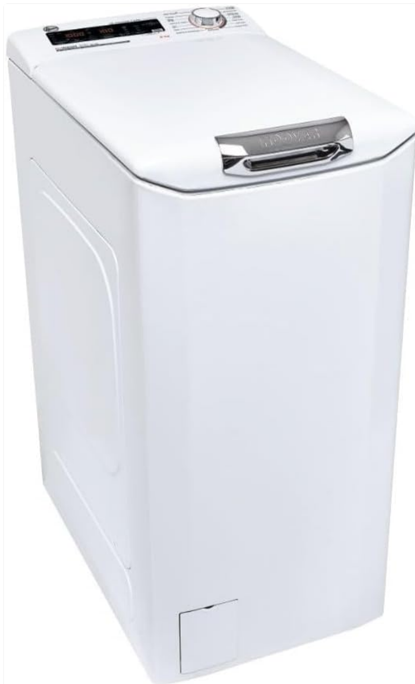
Figure 1.1: Front view of the Hoover H3TSM48TAMCE-11 Top-Load Washing Machine. This image shows the appliance's compact design, top-loading access, and control panel located at the top rear.