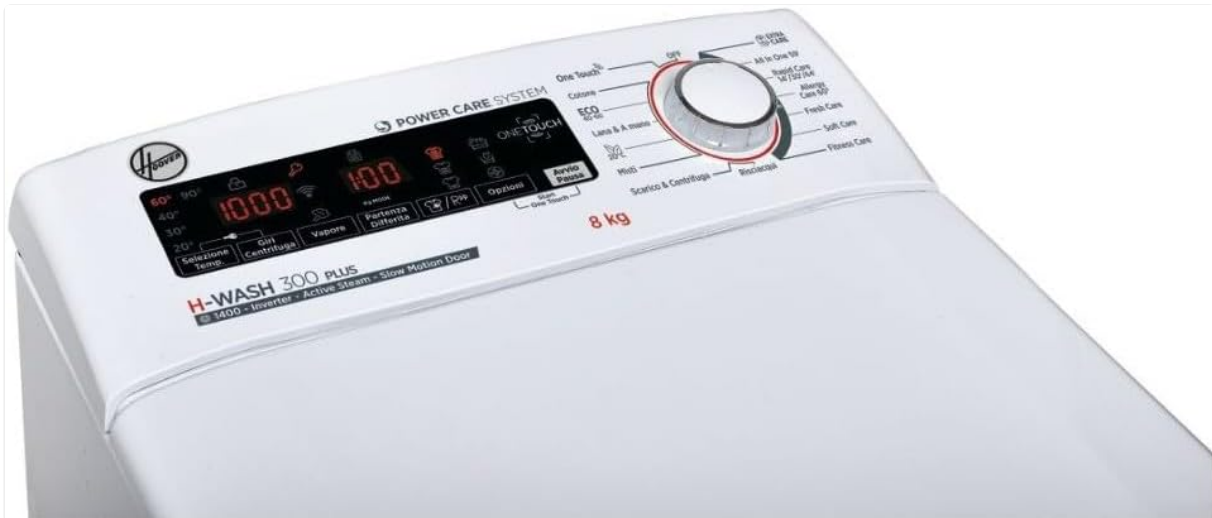
Figure 3.1: Close-up of the control panel. This image highlights the program selector dial, digital display, and touch-sensitive buttons for various functions like temperature, spin speed, and delay start.