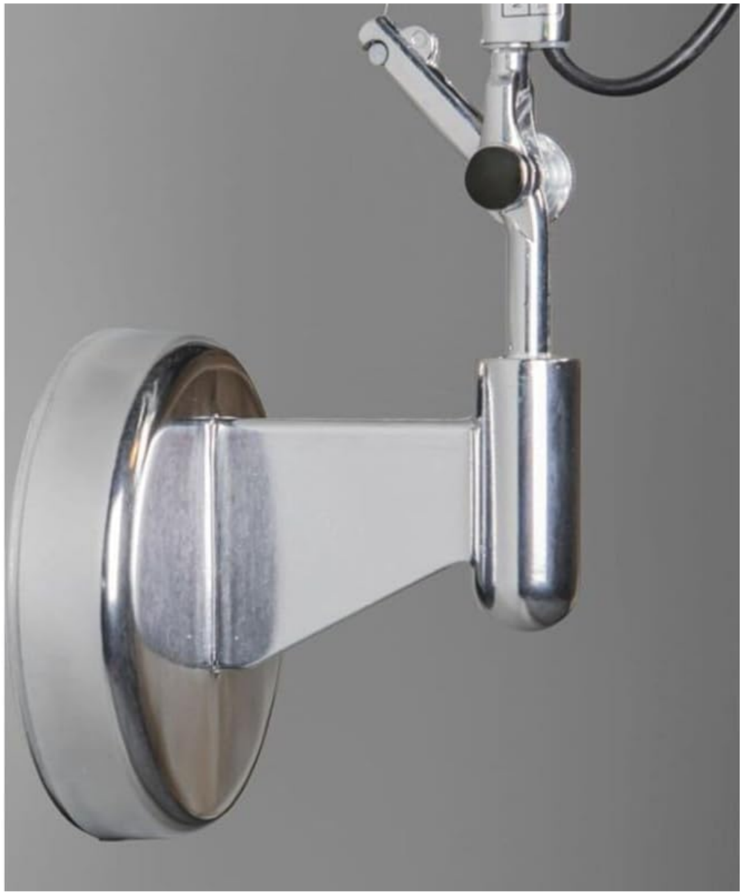
Image 2: The Artemide Tolomeo Wall Surface Bracket shown with a compatible Tolomeo lamp arm attached, demonstrating its functional use.