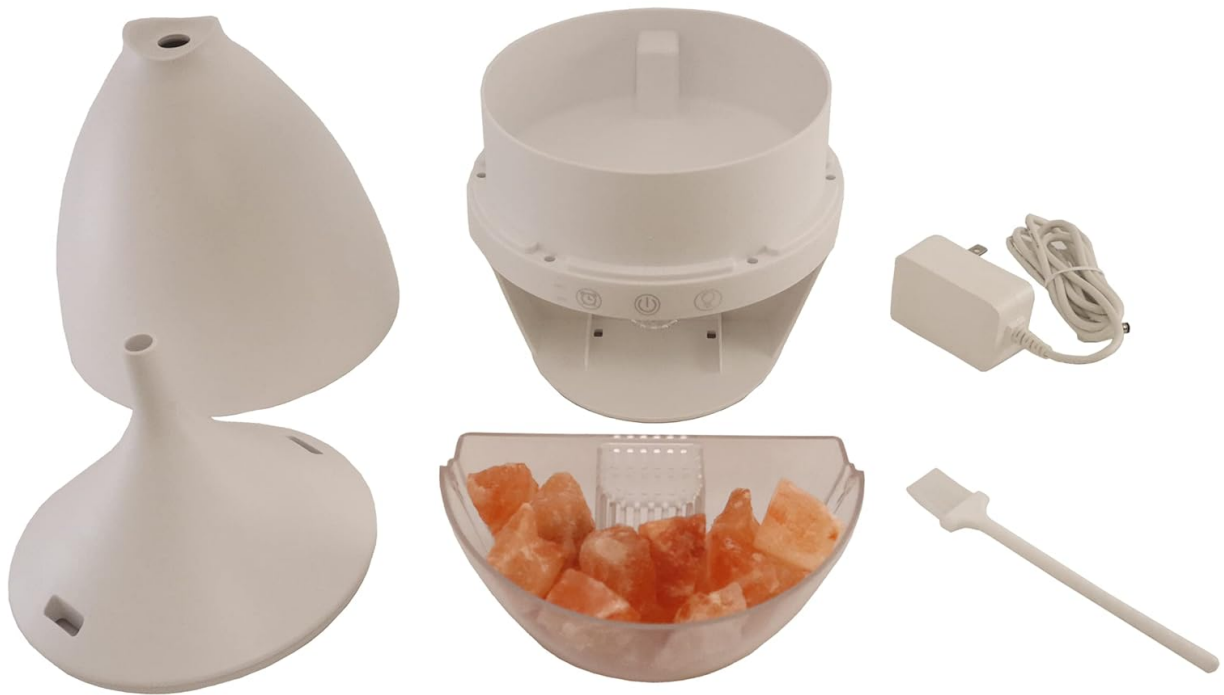
Image: All components included with the emagine A Himalayan Salt Lamp Diffuser.