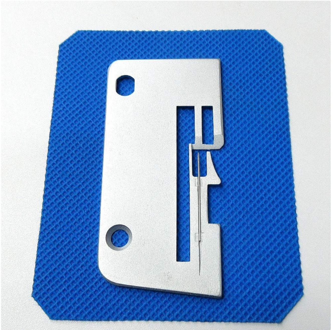
Image 1: Top view of the EverNice Needle Plate #785609009. This image highlights the main surface of the needle plate, including the needle hole and the slots for the feed dogs, which are crucial for fabric movement during sewing. The plate is silver-colored and rests on a blue background.