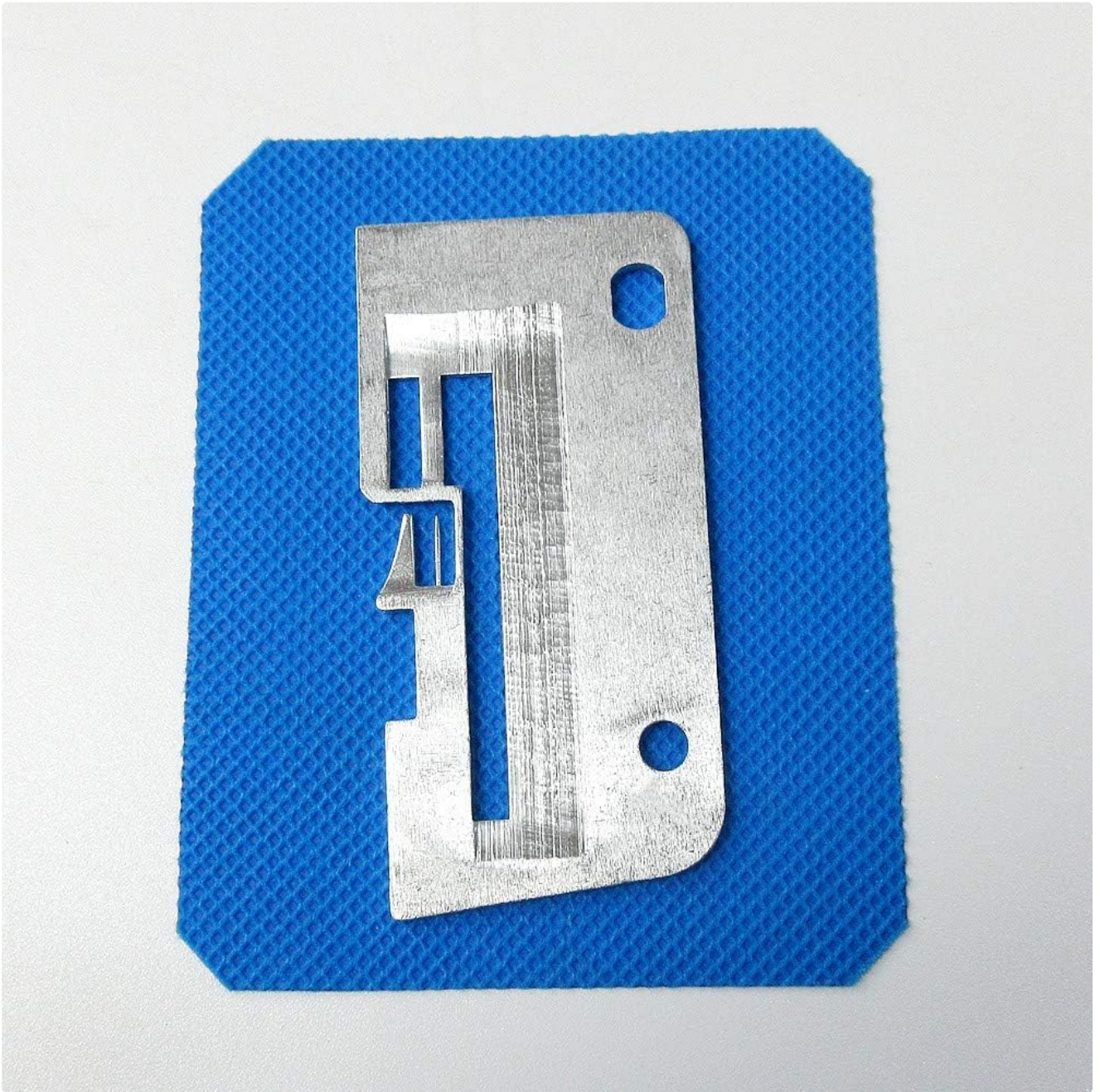
Image 3: Alternative angled view of the EverNice Needle Plate #785609009. This image offers another angle to inspect the plate's design and ensure it matches the required replacement part. The precision of the cutouts is visible, which is essential for proper machine function.