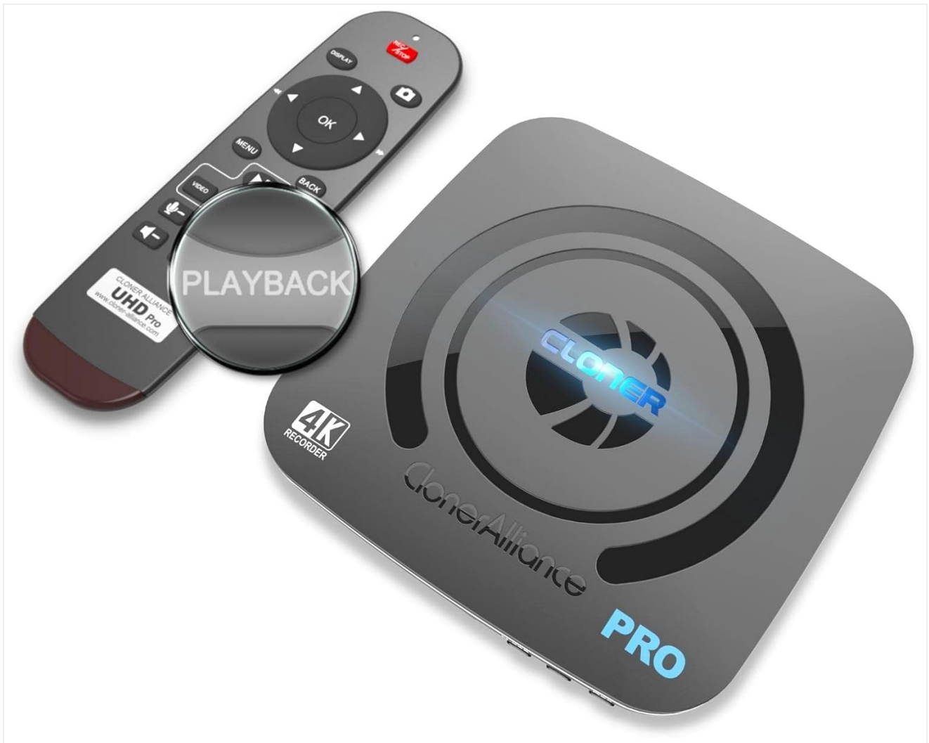
Figure 1: ClonerAlliance UHD Pro device and remote control. The device is a compact, dark gray square unit with a central circular design and blue LED accents. A remote control with various buttons is positioned next to it.