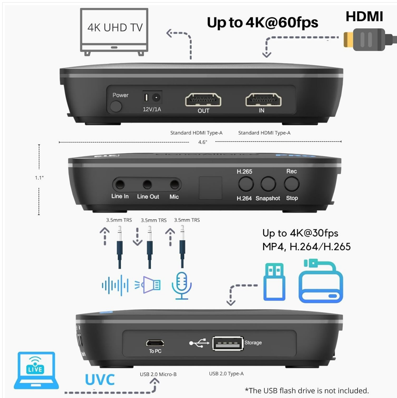
Figure 3: A detailed view of the ClonerAlliance UHD Pro's ports, including Power, HDMI OUT, HDMI IN, Line In, Line Out, Mic, H.265/H.264 buttons, Snapshot, Rec, Stop, USB Storage, and To PC (Micro-B) ports. Dimensions are also shown.