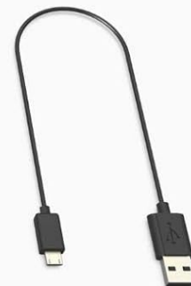
To PC Cable (Micro-B to USB-A)