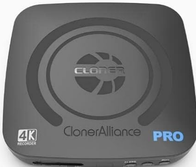
ClonerAlliance UHD Pro