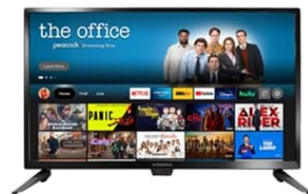
Smart Fire TV