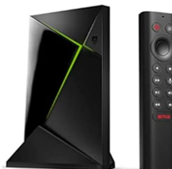
SHIELD TV Pro