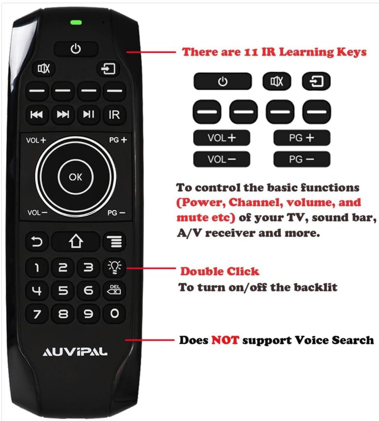
Figure 4.1: The remote control side of the AuvIPal G9F, indicating the location of the 11 IR learning keys and the backlight toggle button.