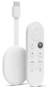
Chromecast with Google TV