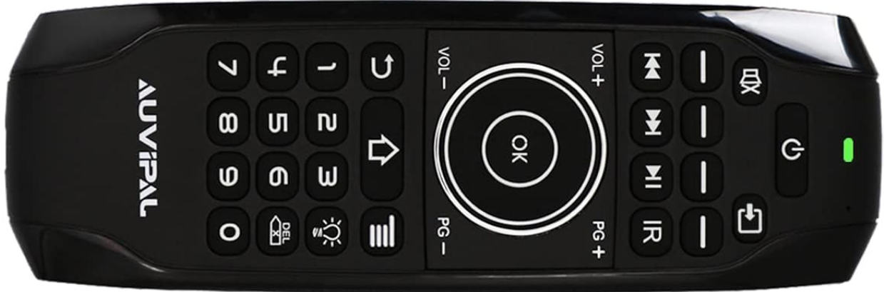
Figure 2.2: Visual representation of key features: Bluetooth connectivity, built-in rechargeable battery, mini keyboard, backlit functionality, and 11 programmable keys.