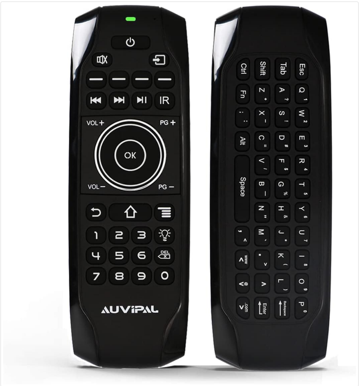
Figure 2.1: Front and back view of the AUVIPAL G9F remote, showcasing the traditional remote buttons on one side and the QWERTY keyboard on the reverse.