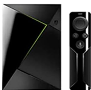
NVIDIA SHIELD 2017