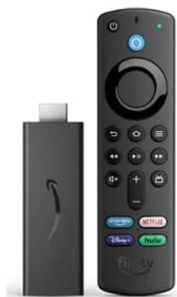
Fire TV Stick/Cube/Box

PLEASE NOTE: Original remote will be needed for setting Bluetooth connection