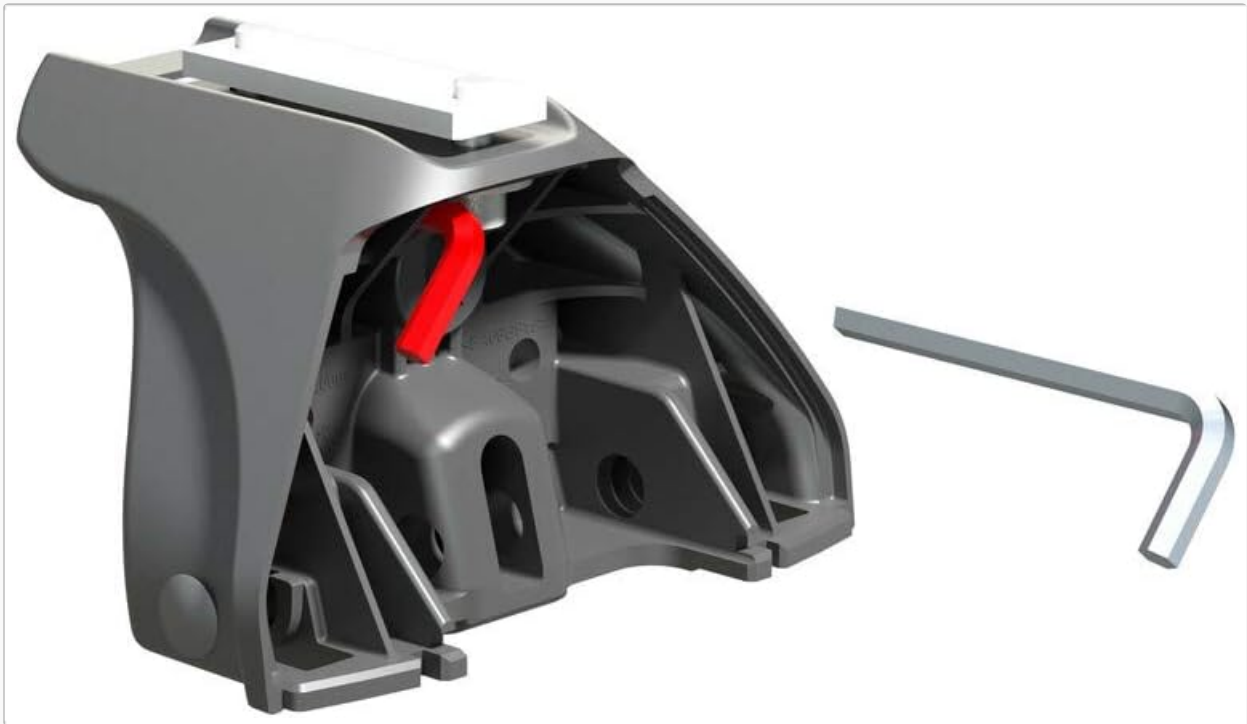
Image showing a single NORDRIVE Evos LP foot with an internal red locking mechanism and a hex key for adjustment. This illustrates the primary component and the tool used for installation.