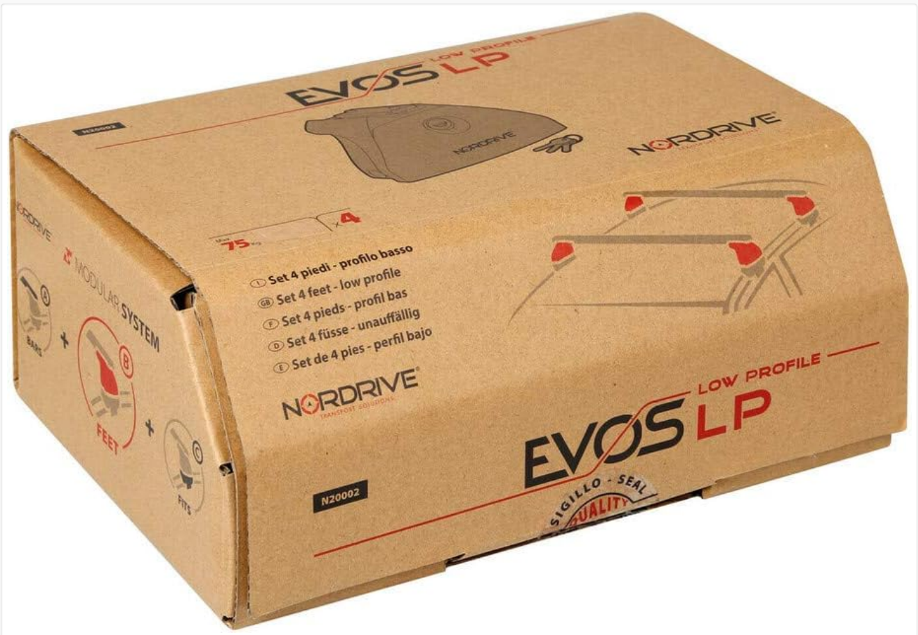
Image of the NORDRIVE Evos LP product packaging, displaying the 'Low Profile' branding and indicating a set of 4 feet with a maximum load capacity of 75 kg.

Note: Roof bars and specific fitting kits for your vehicle are sold separately and are required for a complete roof rack system.