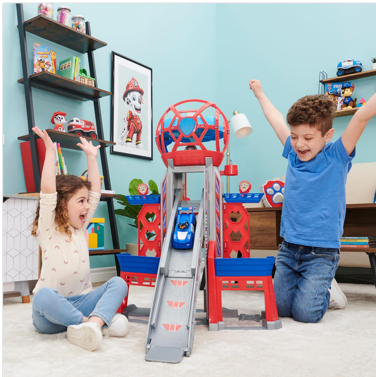
Figure 2: Children engaging with the extended transforming rescue ramp.