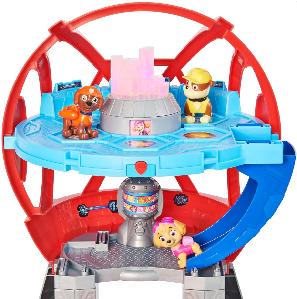
Figure 3: The interactive command center with lights and pup figures.