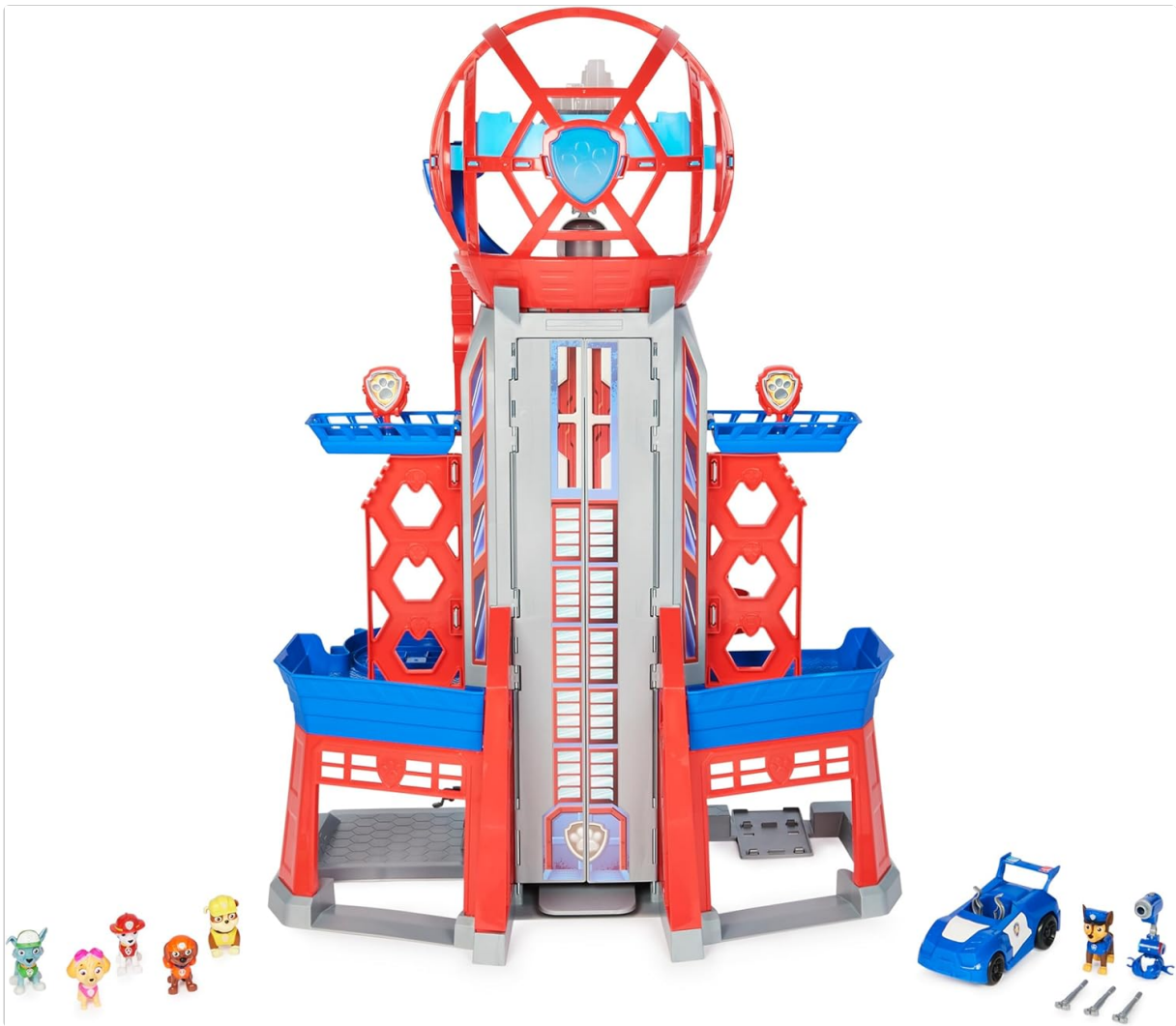
Figure 1: The Paw Patrol Ultimate City Transforming Tower with included figures and vehicle.