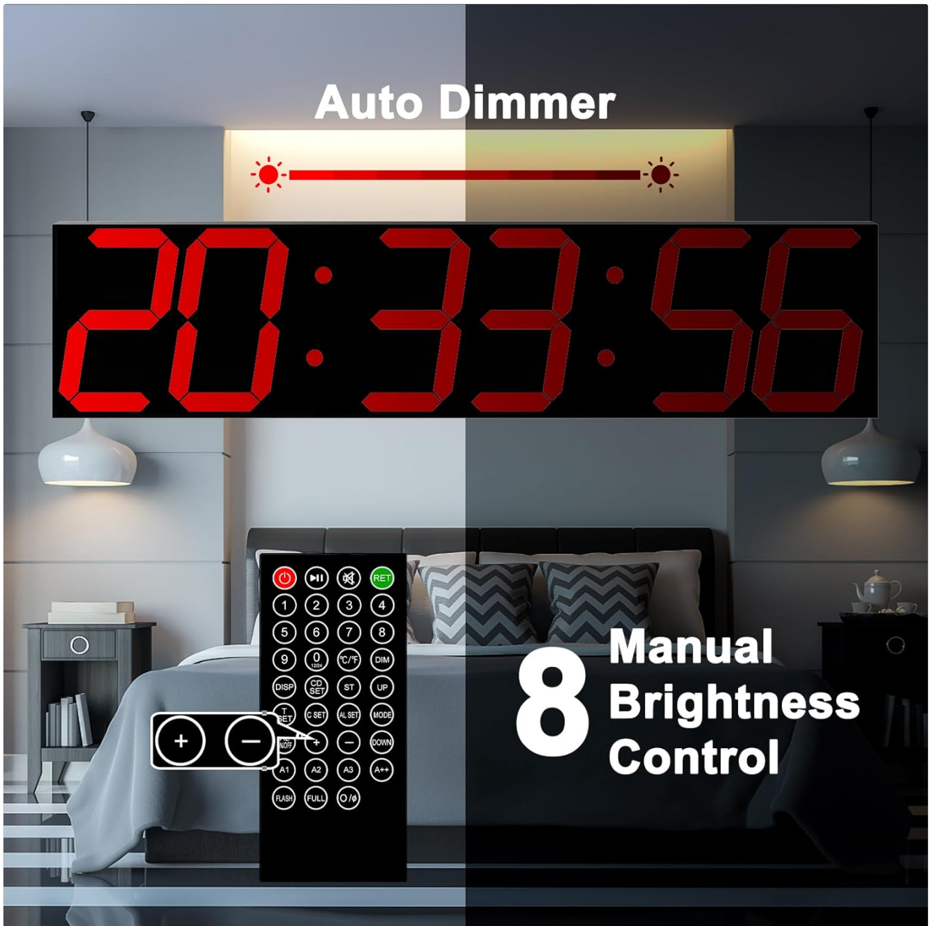
Image: The clock's auto-dimming feature and manual brightness control via remote.