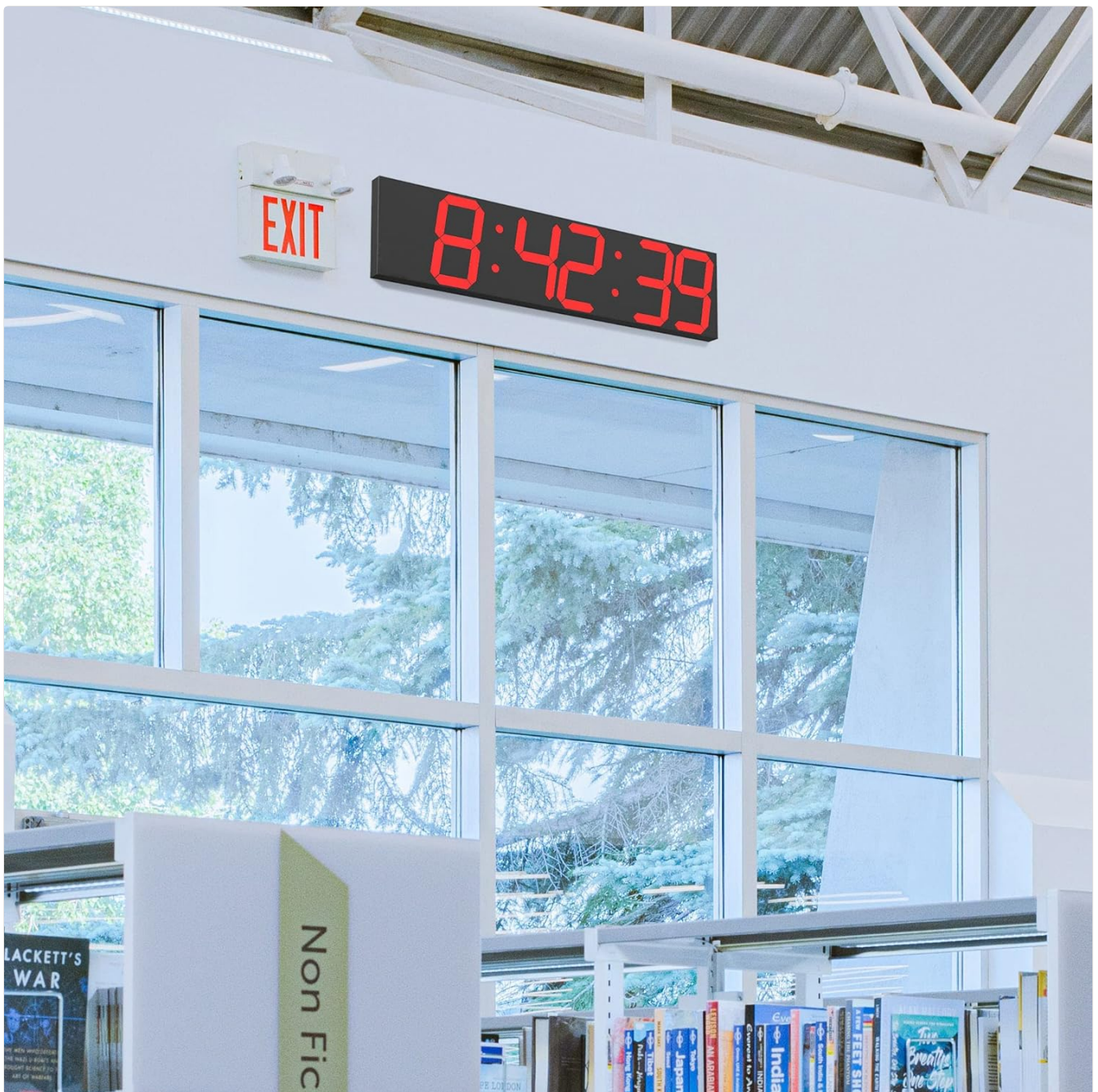
Image: The digital wall clock installed in a spacious indoor environment.