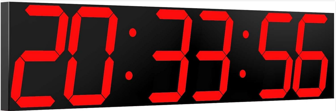
Image: The CHKOSDA Digital Wall Clock with its large, red LED display.

Thank you for choosing the CHKOSDA Digital Wall Clock. This oversized LED clock is designed for clear visibility and versatile functionality, making it ideal for various indoor settings. Please read this manual carefully to ensure proper setup and operation of your new clock.