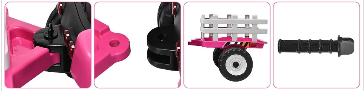
Image: Close-up view illustrating the simple bolt mechanism for attaching and detaching the trailer from the tractor.