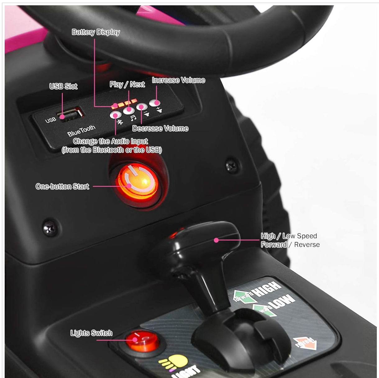
Image: Detailed view of the tractor's control panel, highlighting the USB slot, Bluetooth controls, one-button start, gear shift, and lights switch.