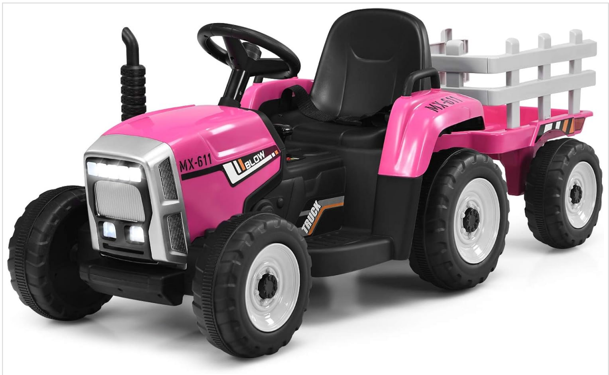
Image: The Costzon Ride on Tractor in pink, featuring a front engine design, large wheels, and a detachable rear trailer.

This manual provides essential information for the safe operation, assembly, maintenance, and troubleshooting of your new Costzon 12V Kids' Electric Ride on Tractor with Detachable Trailer. Please read this manual thoroughly before initial use and retain it for future reference. This product is designed to provide an engaging and interactive experience for children aged 3 years and up.