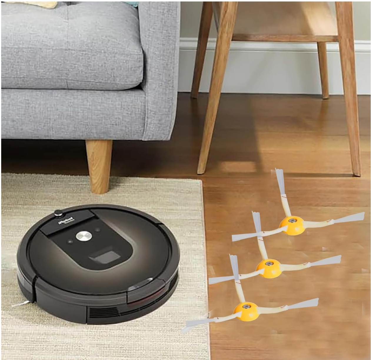
Image: An iRobot Roomba vacuum cleaner actively cleaning a wooden floor, with new replacement side brushes positioned nearby, ready for installation.