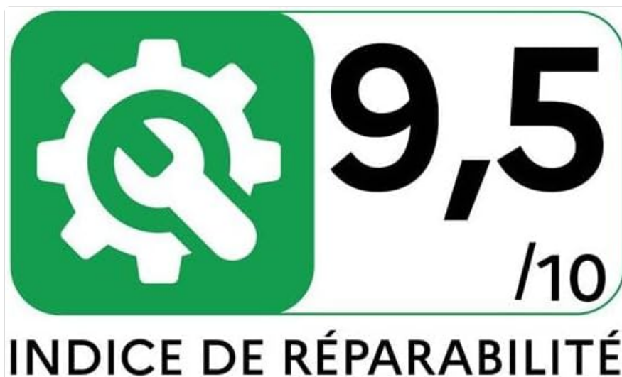
Figure 2: Repairability Index of 9.5/10. This indicates the product is designed to be easily repairable, contributing to its longevity and sustainability.