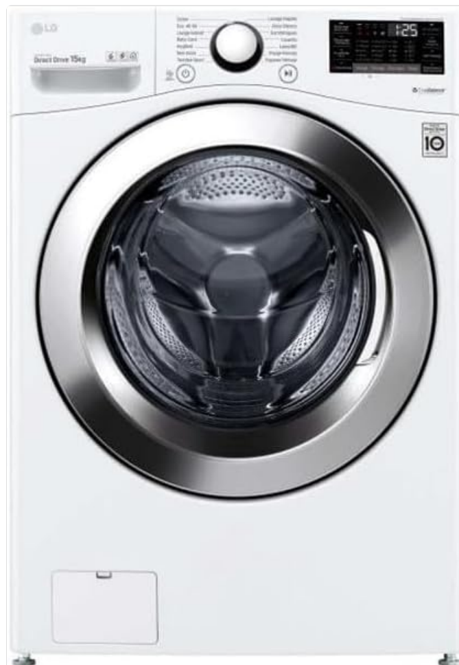
Figure 1: Front view of the LG F51P12WH washing machine, showing the control panel, detergent dispenser, and large drum door. This image illustrates the overall design and key external components of the appliance.