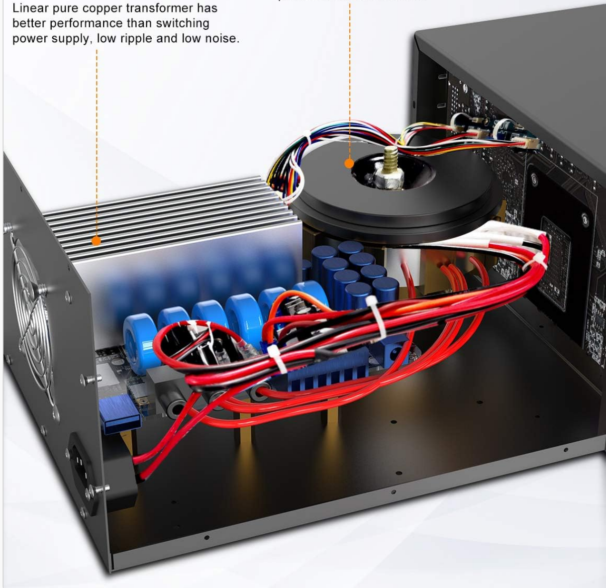
Image Description: This image provides an internal view of the RockSeed RS305D, showcasing its linear pure copper transformer and temperature control cooling system. The linear transformer is noted for better performance, lower ripple, and less noise compared to switching power supplies. The temperature control cooling system is highlighted as crucial for maintaining stable power supply performance.

The temperature control cooling system makes the power supply performance more stable.