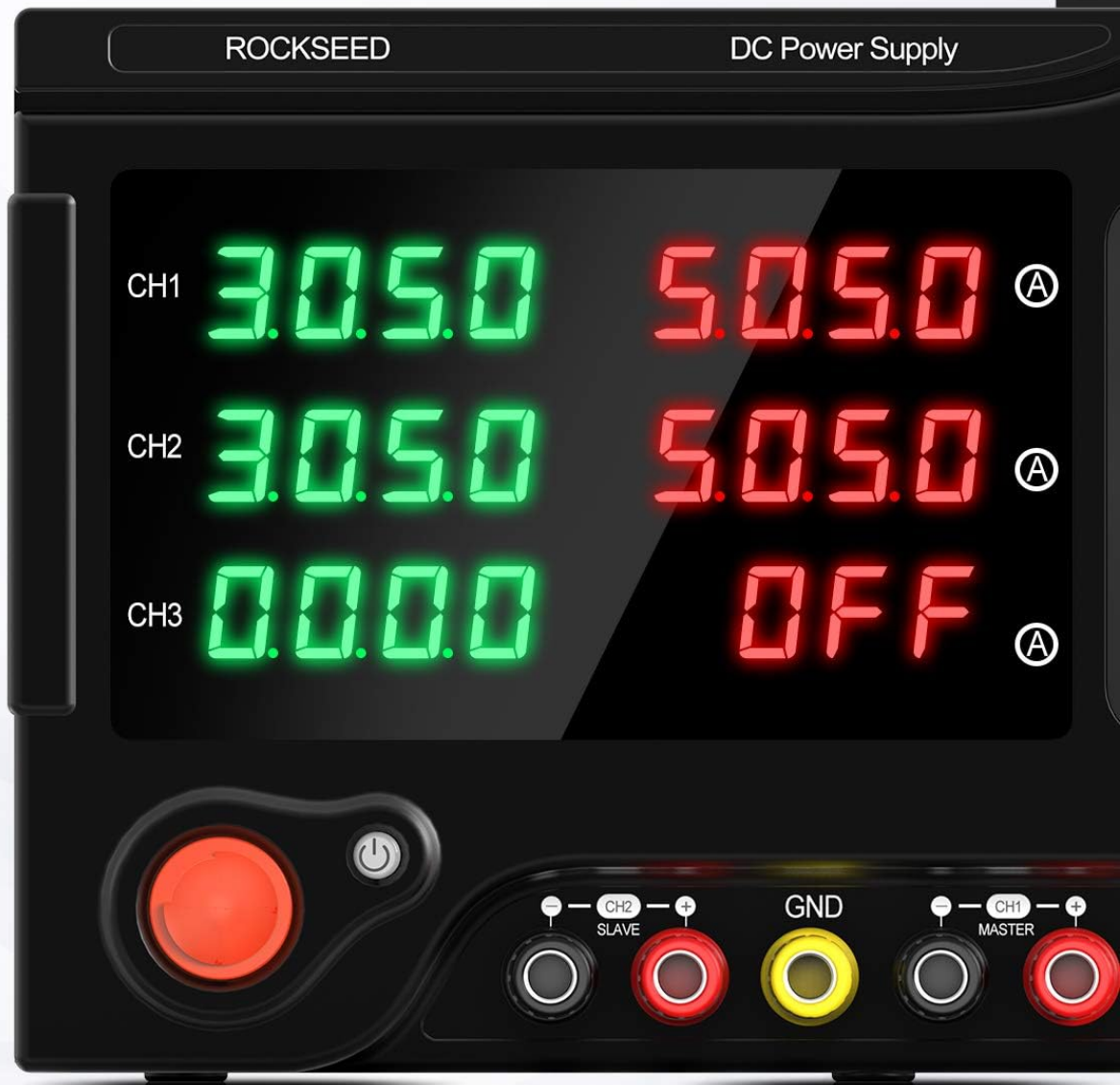
Image Description: This image focuses on the digit color LED display of the RockSeed RS305D. It clearly shows the independent displays for voltage and current for each of the three channels (CH1, CH2, CH3). The bright, multi-colored digits ensure excellent readability of the output parameters.