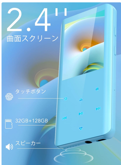
Figure 2.3: The player features a 2.4-inch curved screen, touch-sensitive buttons, 32GB internal memory expandable to 128GB, and a built-in speaker.