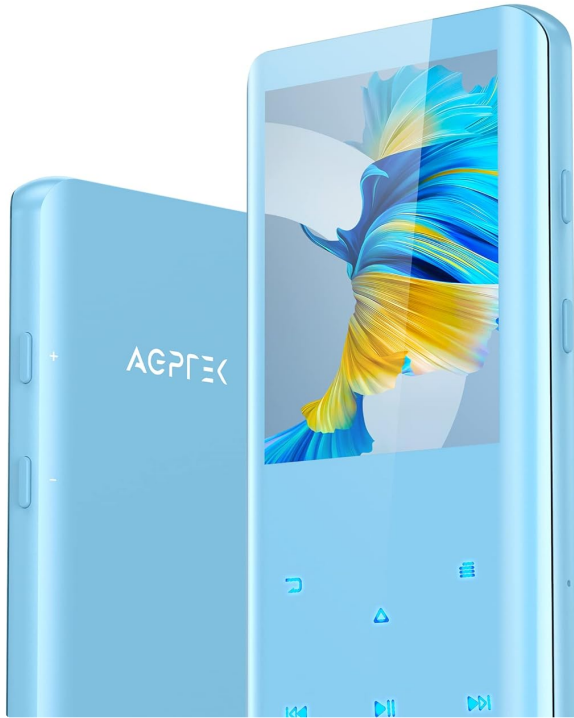
Figure 5.1: The AGPTEK A19 MP3 Player demonstrating its Bluetooth 5.2 connectivity with both a Bluetooth speaker and wireless earbuds.