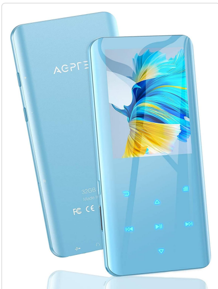
Figure 2.1: Front and back view of the AGPTEK A19 MP3 Player. The device is blue with a 2.4-inch screen and touch-sensitive controls.