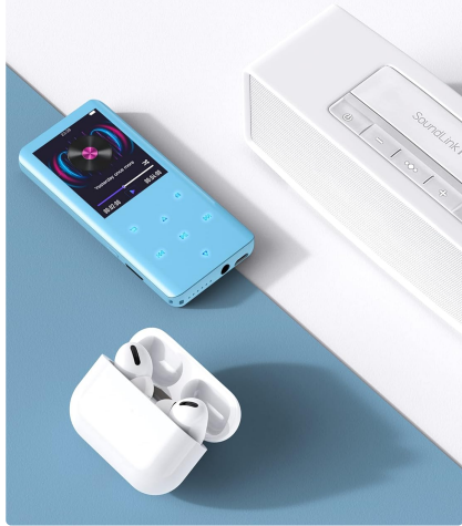
Figure 2.2: Close-up of the AGPTEK A19 MP3 Player highlighting its 3D curved surface design, which provides a smooth and comfortable grip.