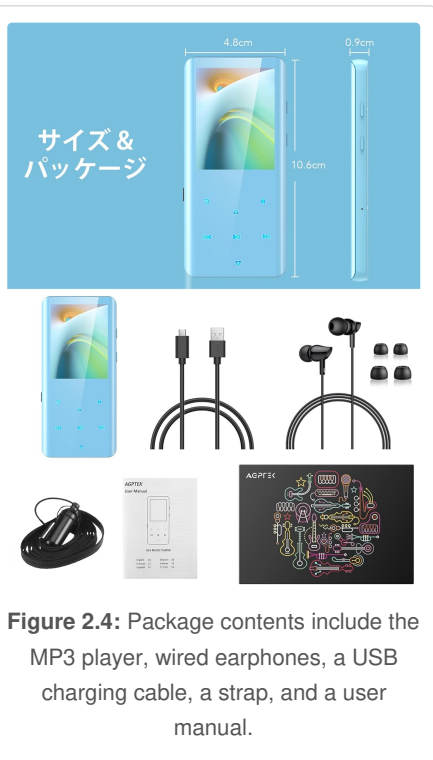
Figure 2.4: Package contents include the MP3 player, wired earphones, a USB charging cable, a strap, and a user manual.