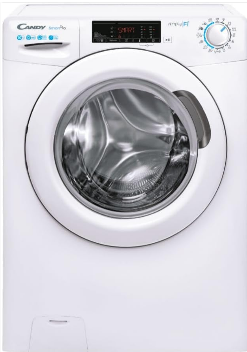
Figure 1.1: Front view of the Candy CO12105TE/1-S washing machine, showing the control panel, detergent drawer, and large porthole.