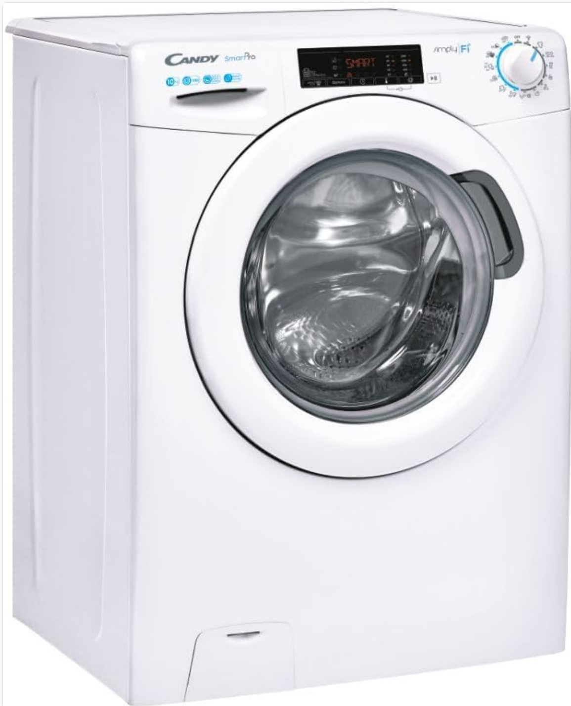
Figure 4.1: The control panel features a program selector dial, a 5D digital display, and various function buttons.