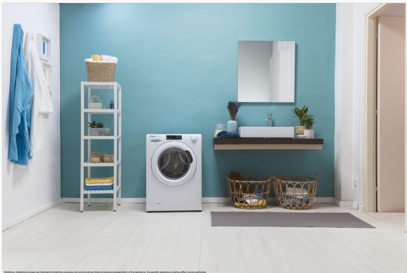
Figure 3.1: Example of the washing machine installed in a laundry area, demonstrating proper spacing.