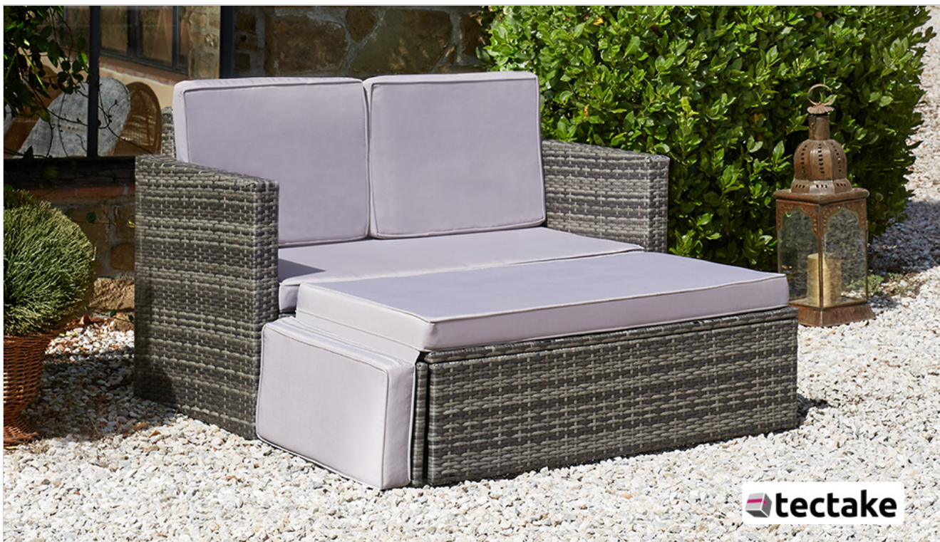
Image: The tectake Wicker Lounge 2-seater sofa and stool set positioned on a patio overlooking a body of water, demonstrating its aesthetic appeal in an outdoor environment.