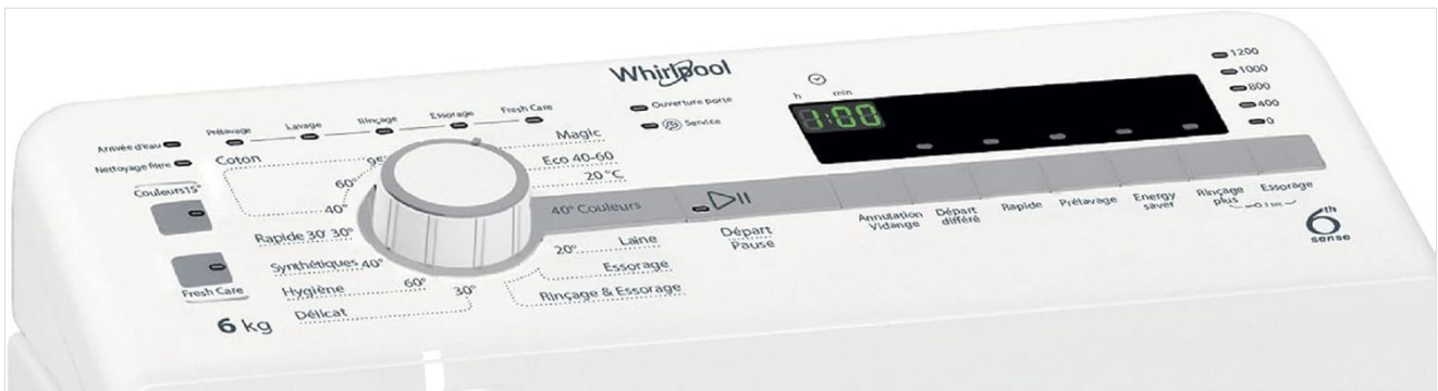
Image: Top view of the washing machine with the lid closed, indicating its top-load design.