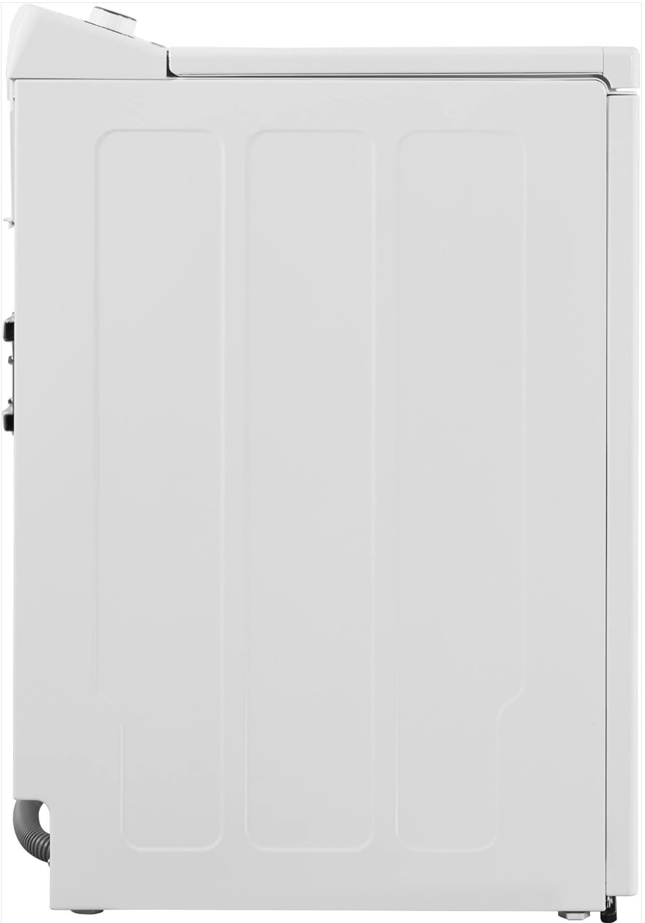
Image: Side view of the washing machine, illustrating its compact design and the location of the adjustable feet.