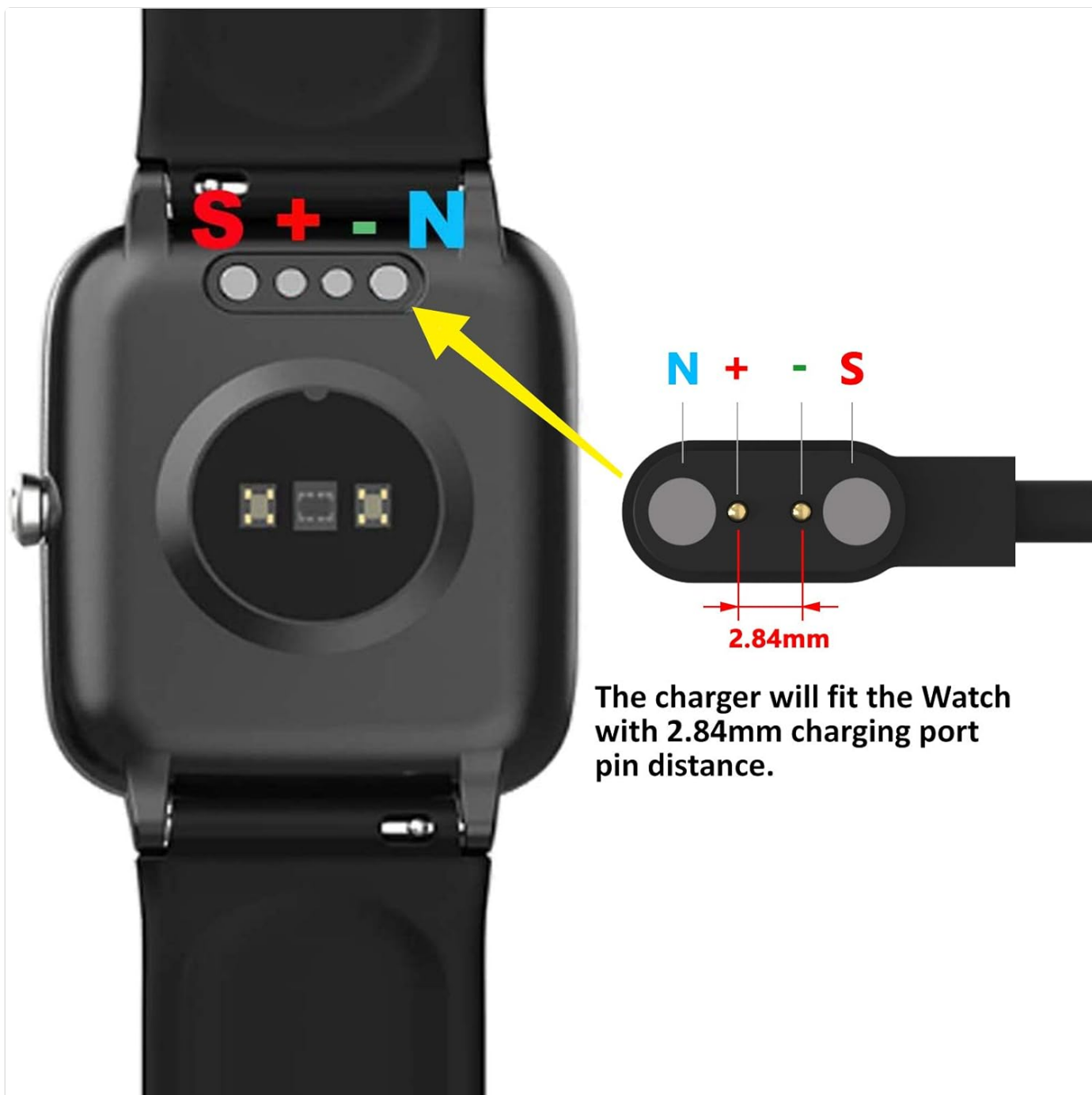
Figure 4: Measuring Charging Pin Distance

This image demonstrates how to measure the 2.84mm pin distance on the back of a smartwatch, which is critical for ensuring charger compatibility.