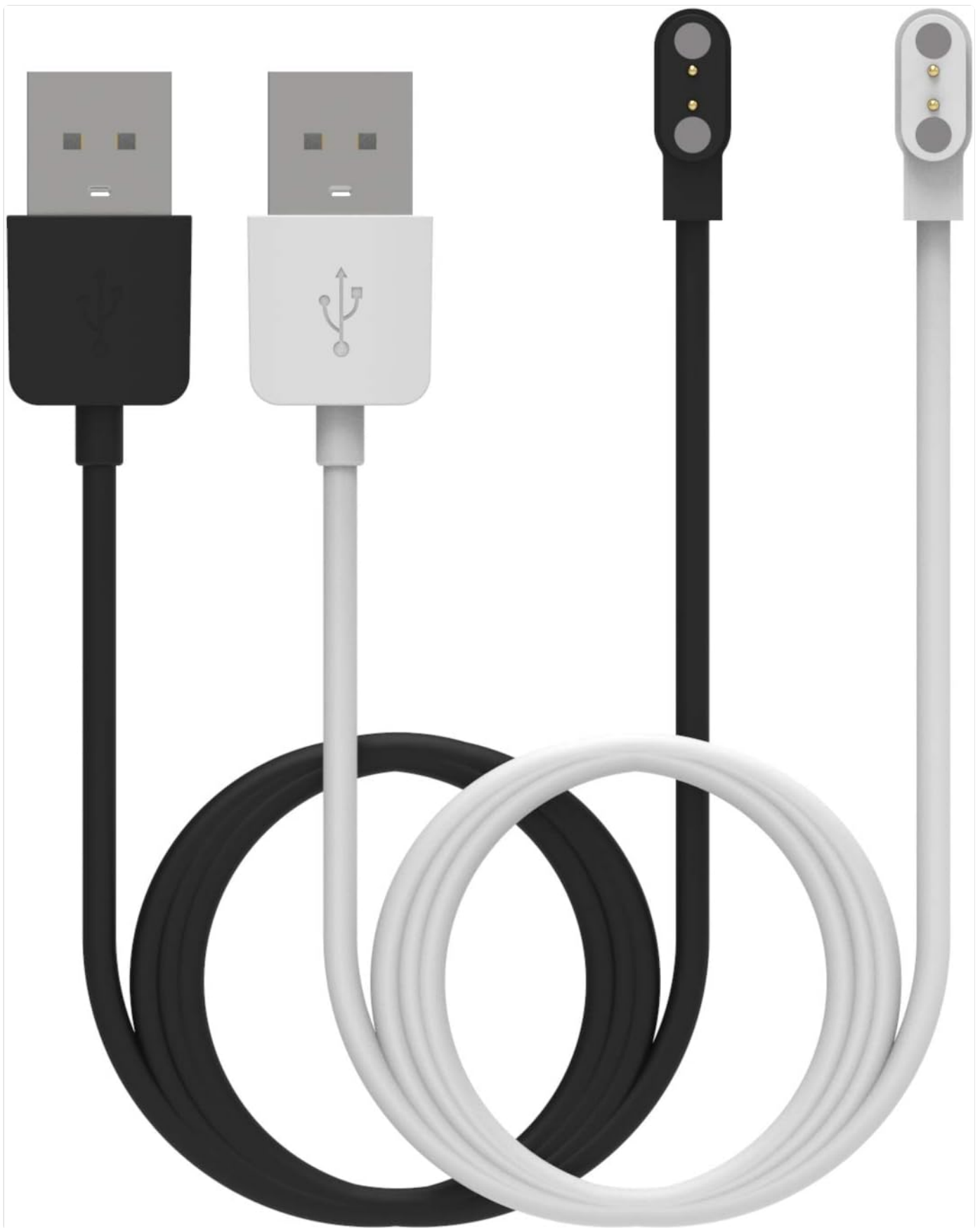
Figure 1: E ECSEM Magnetic USB Charging Cables (Black and White)

This image displays both the black and white versions of the E ECSEM magnetic USB charging cables, highlighting their design and USB connectors.