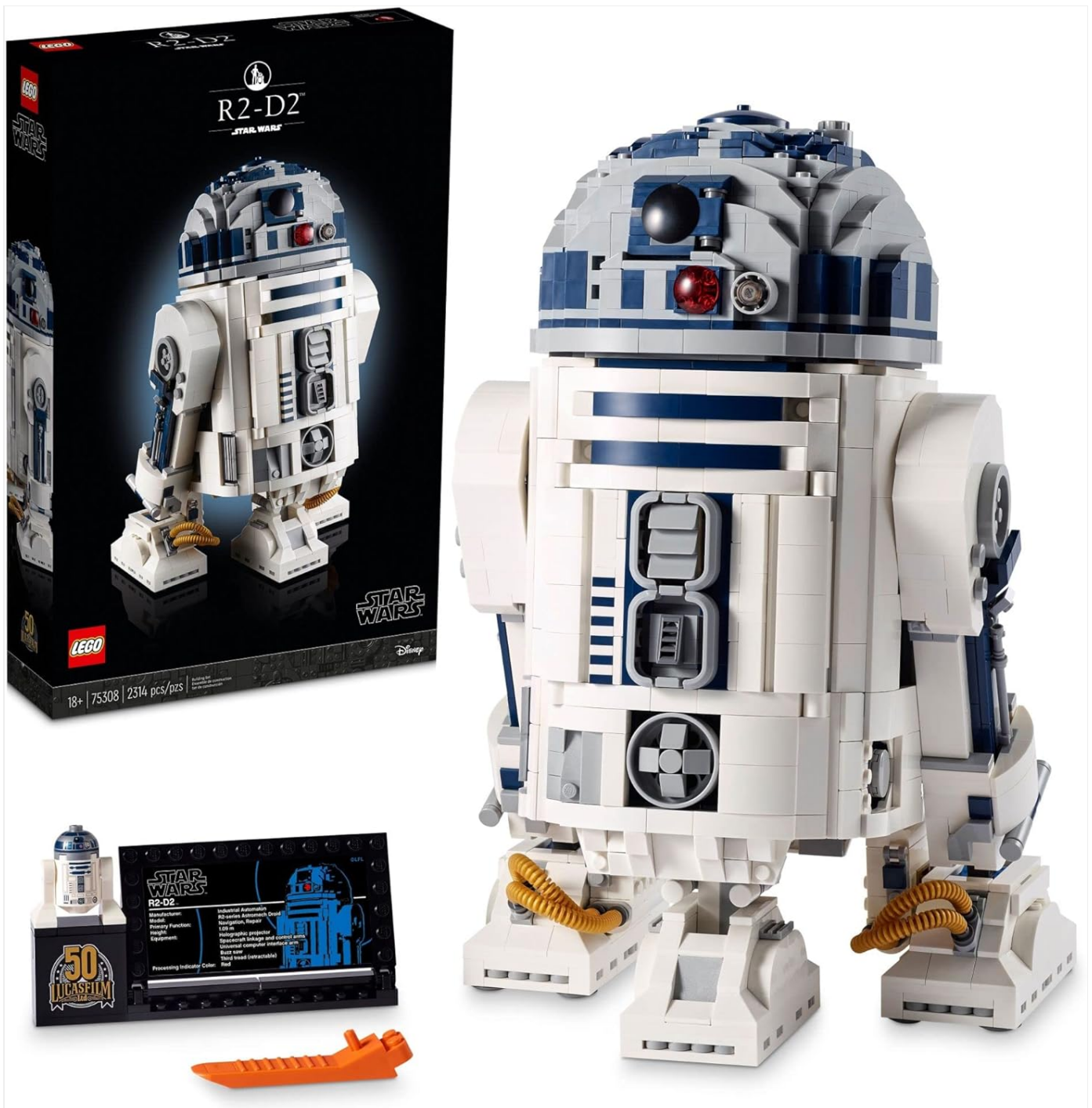
Image: The complete LEGO Star Wars R2-D2 model, its display plaque, and the product packaging.