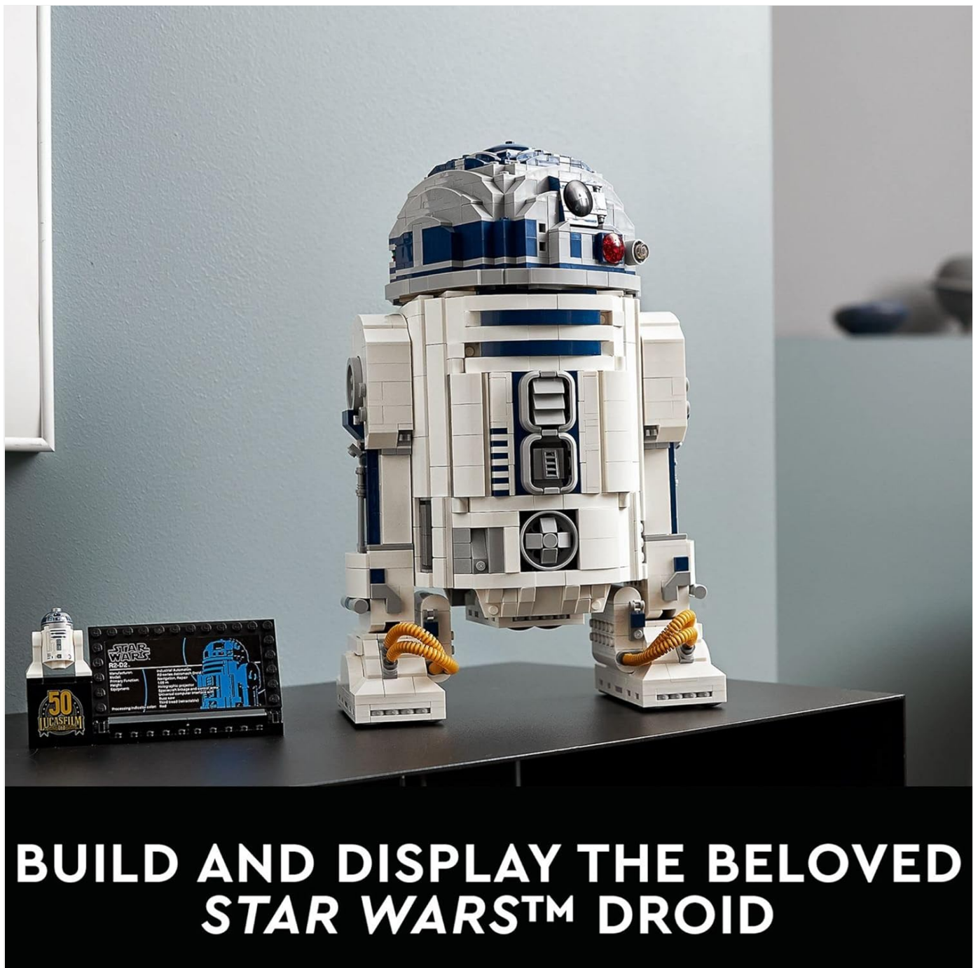
Image: The fully assembled R2-D2 model displayed with its information plaque.