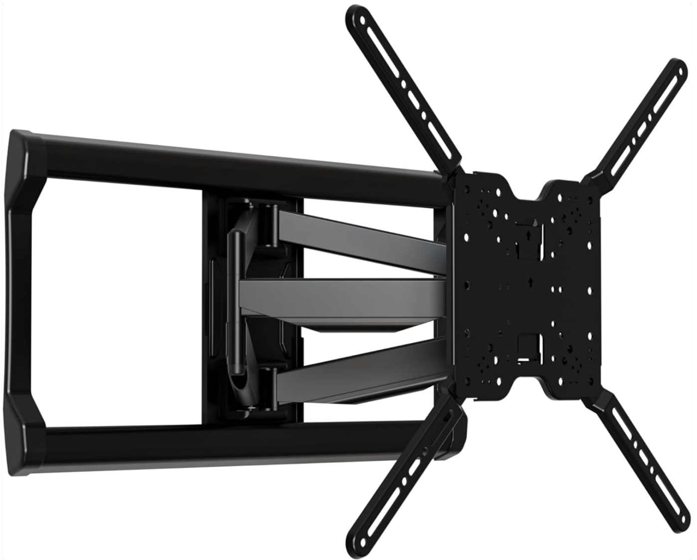
Front view of the SANUS Full Motion TV Wall Mount, showcasing its articulating arm design.