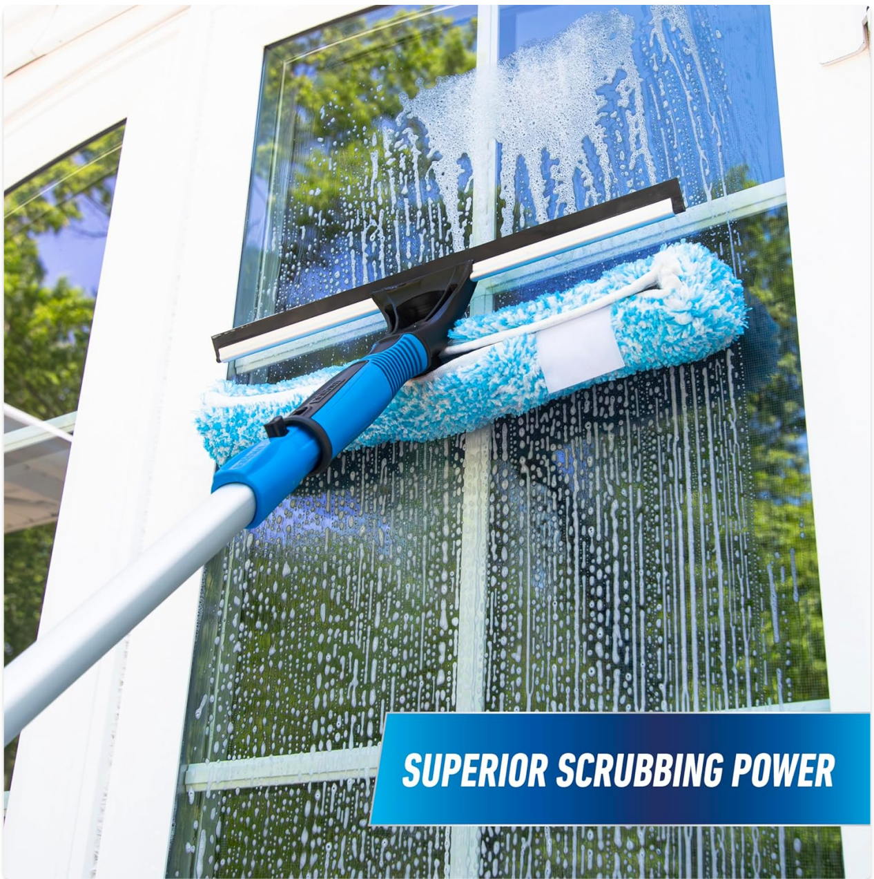
Figure 5: Superior scrubbing power with the microfiber sleeve.