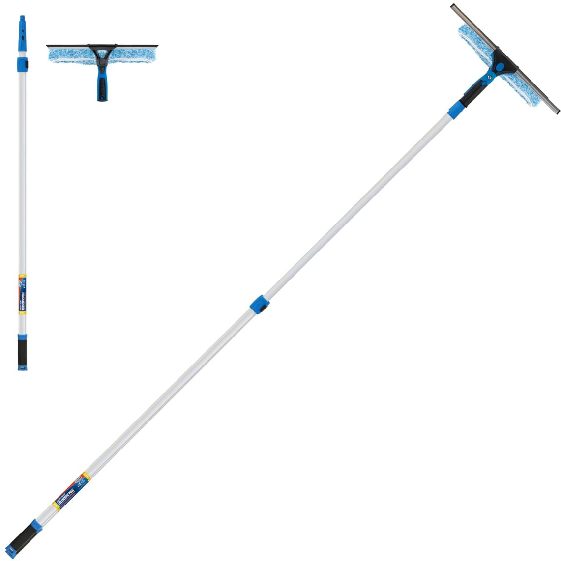
Figure 1: Unger Professional 2-in-1 Squeegee & Scrubber with 8-foot pole.