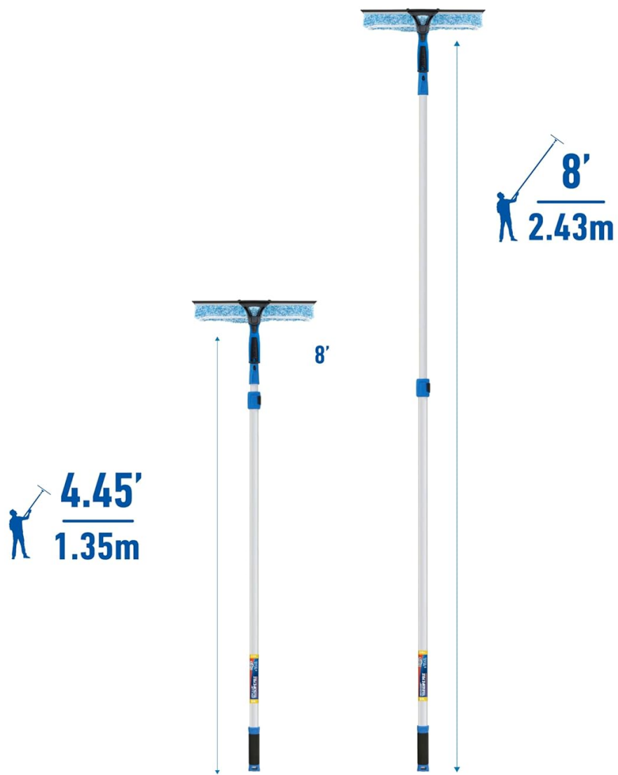
Figure 8: Pole length comparison for extended reach.