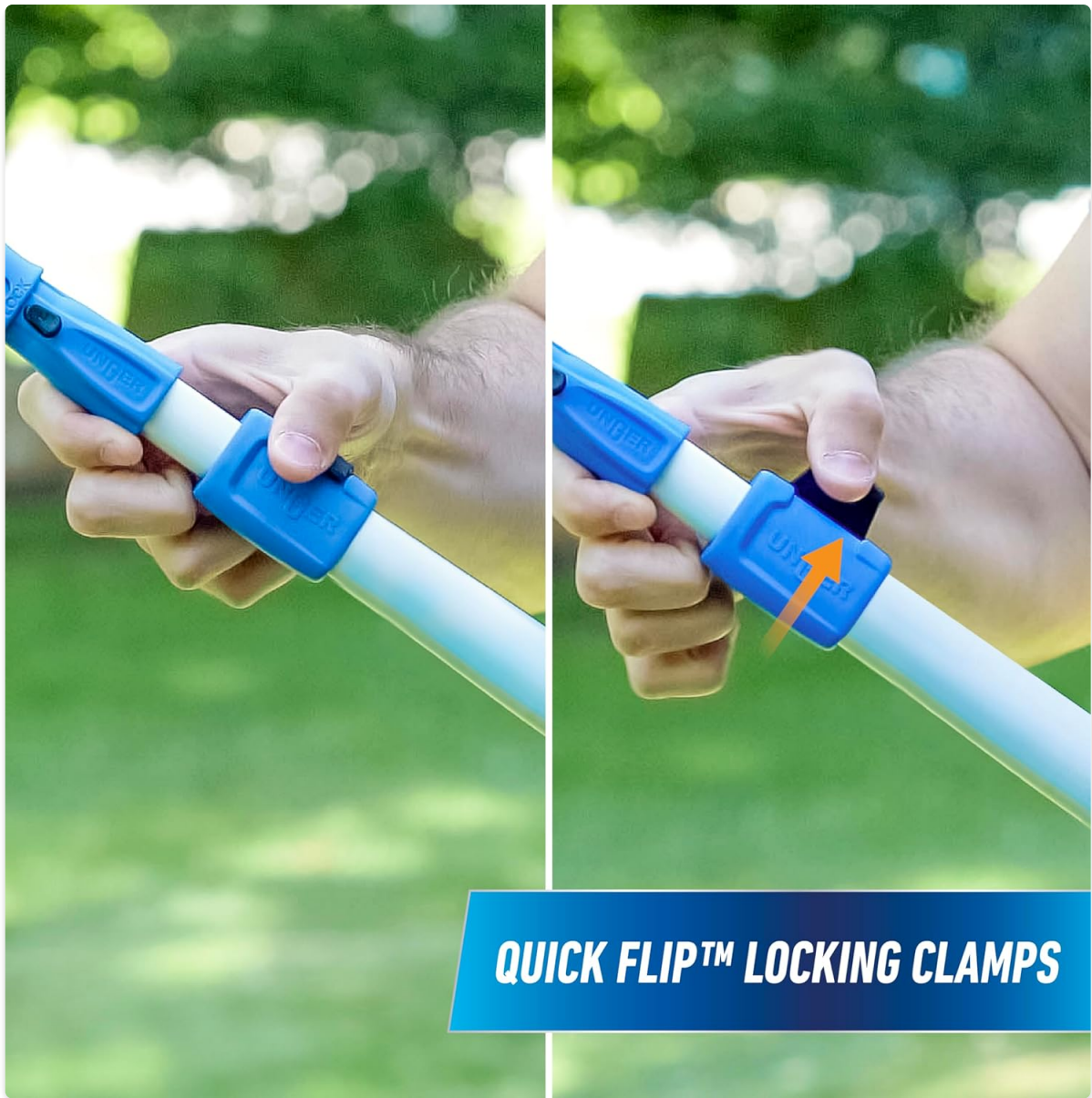
Figure 3: Quick Flip™ locking clamps for pole extension.