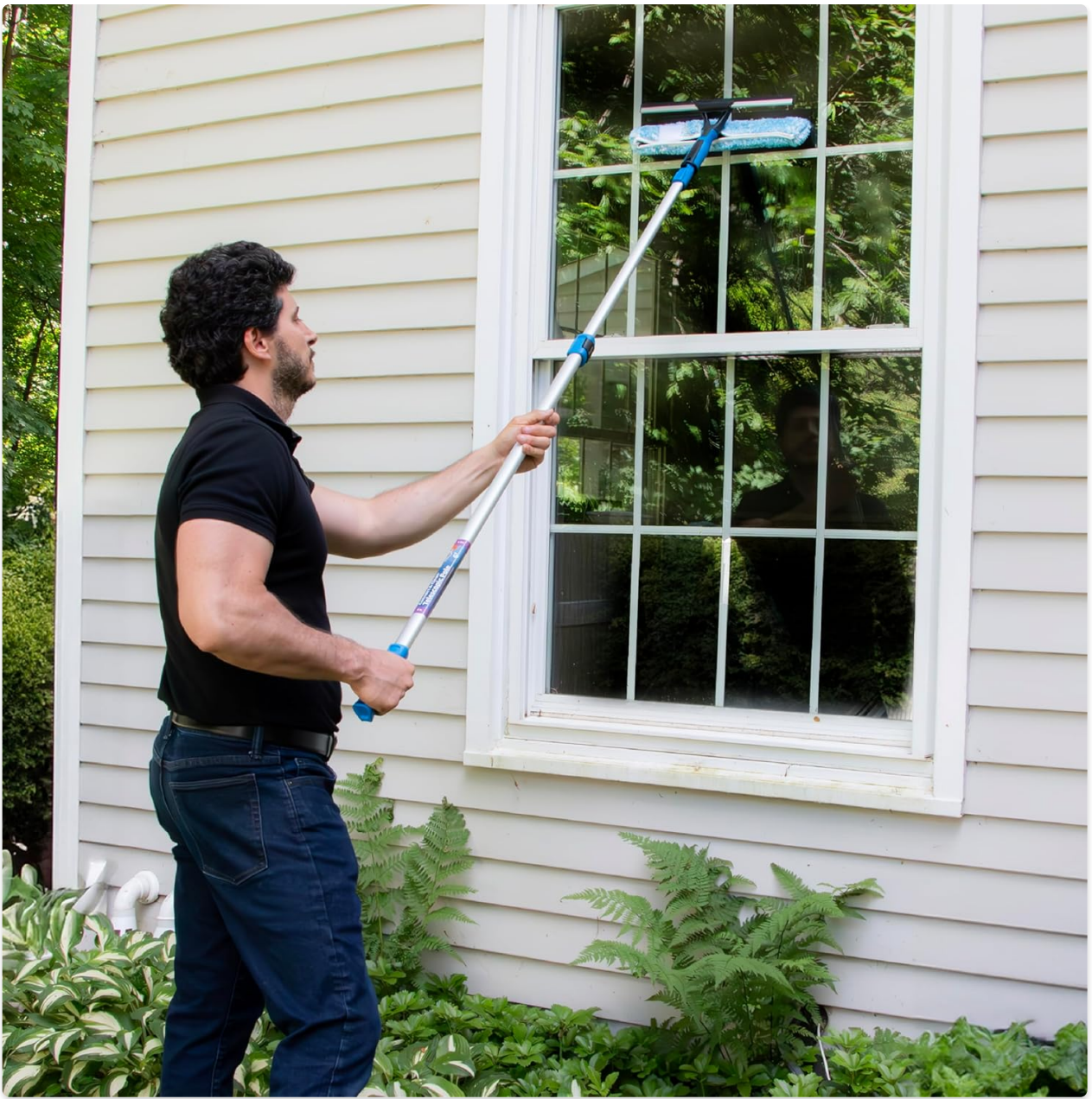
Figure 7: User cleaning a window with the extended pole.