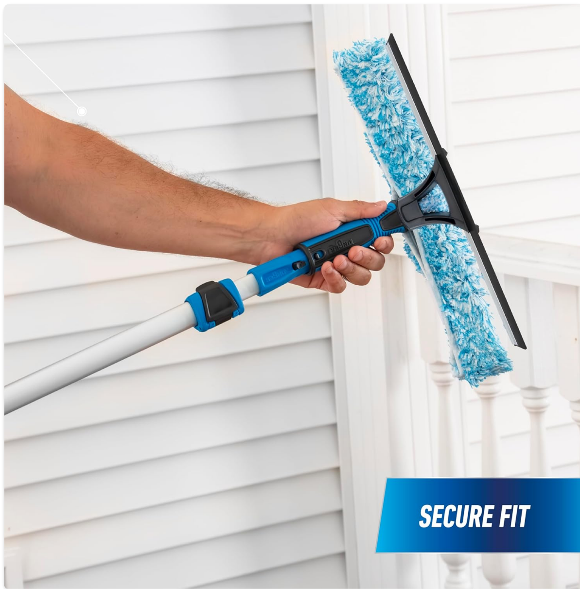
Figure 2: Securely attaching the tool head to the pole.