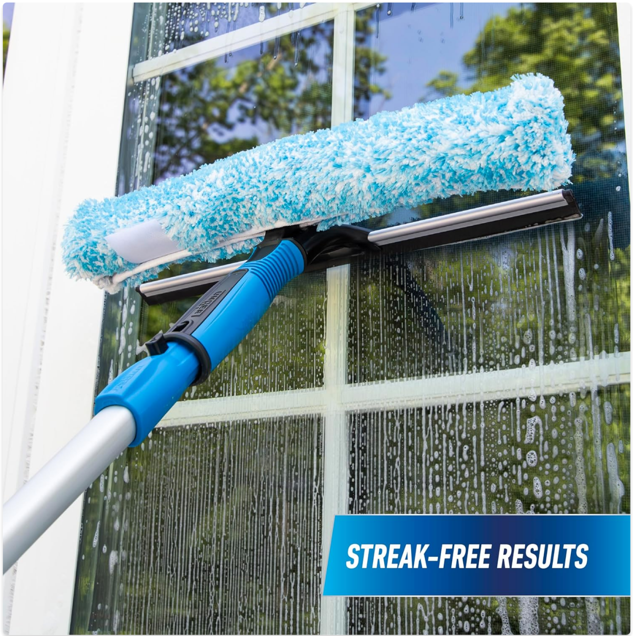
Figure 6: Achieving streak-free results with the squeegee blade.