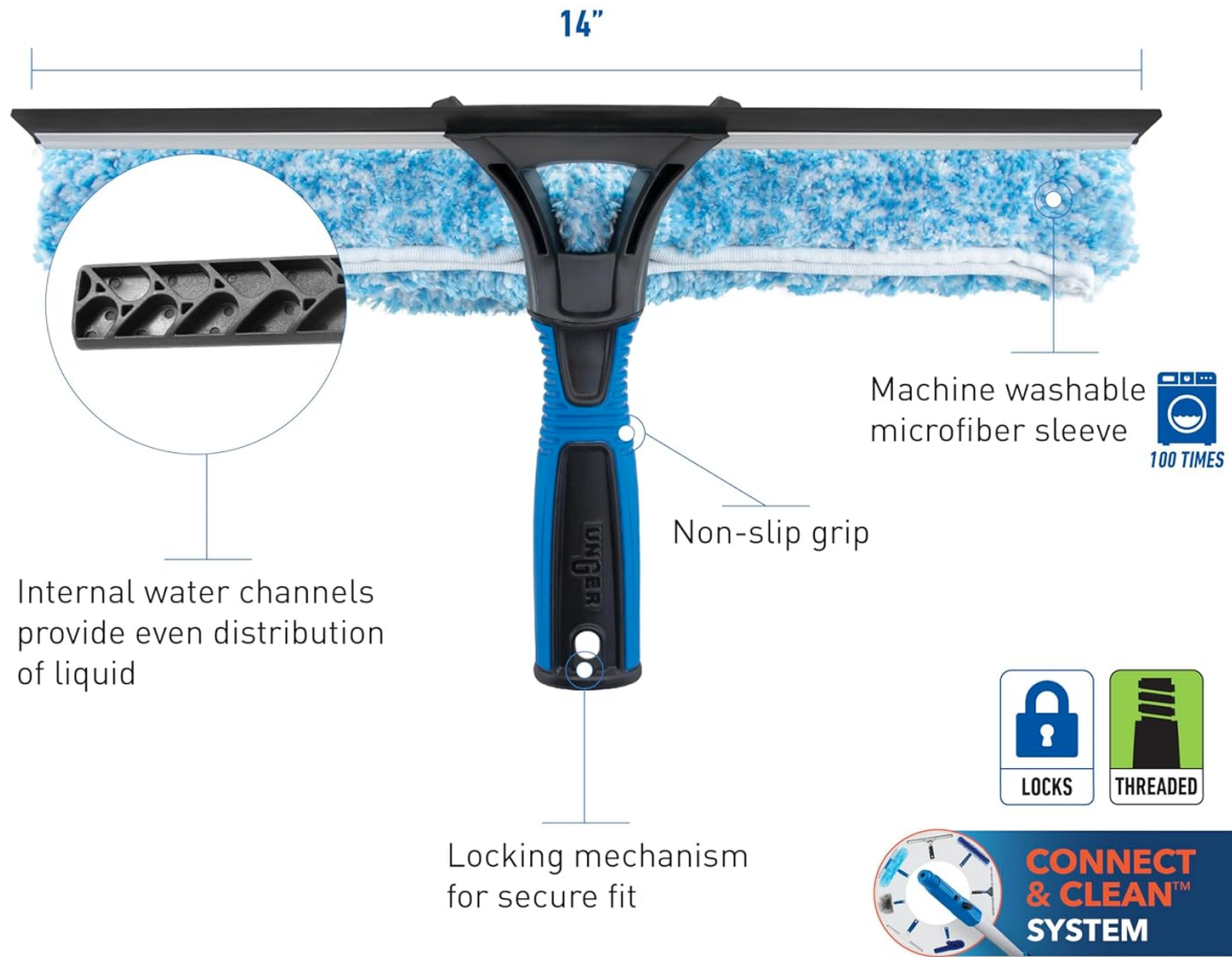
Figure 10: The 14-inch 2-in-1 Scrubber & Squeegee head with machine washable sleeve.