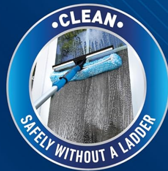
Figure 9: The versatile Connect & Clean™ System.