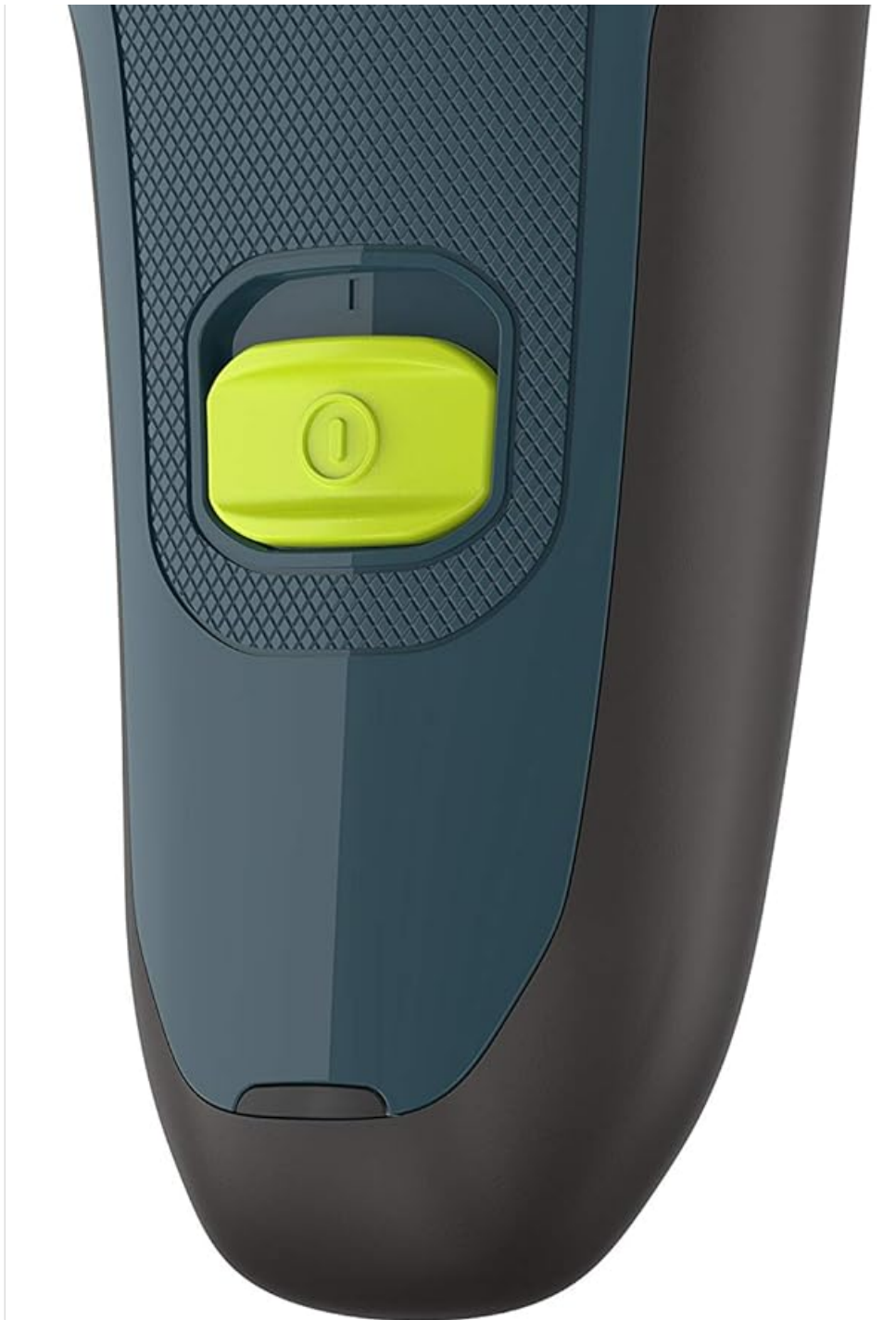
The Remington Ultrastyle Rechargeable Foil Shaver in green, showcasing its ergonomic design and foil head.