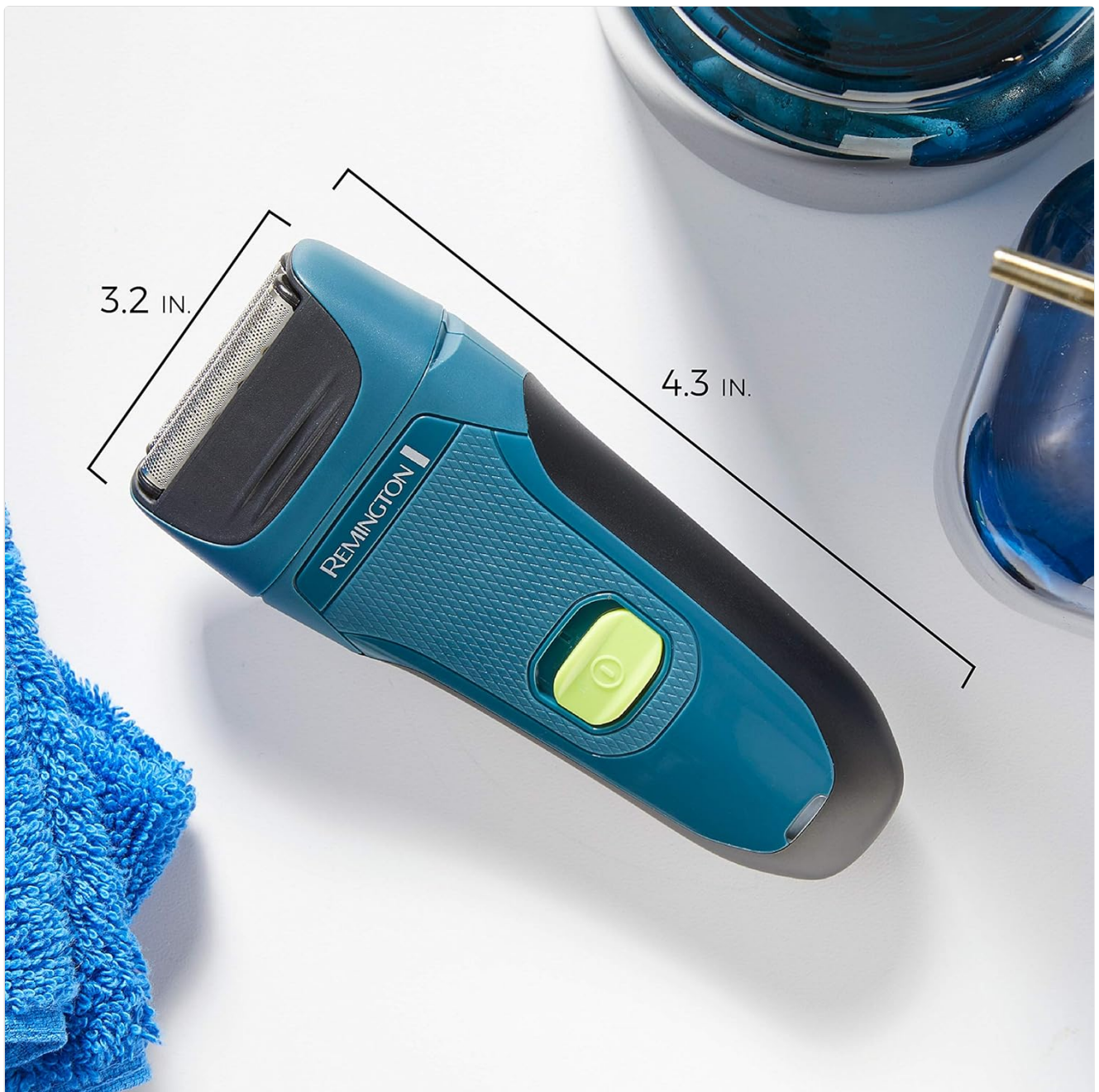
Visual representation of the shaver's dimensions.