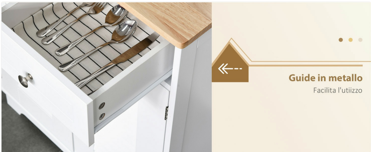
Figure 5.1: The metal drawer guides ensure smooth operation.