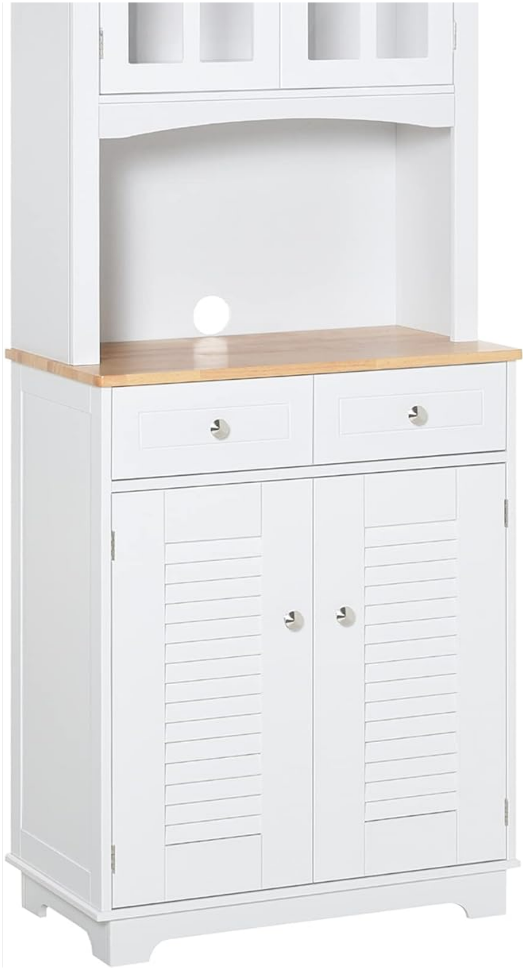
Figure 2.1: Overview of the HOMCOM Kitchen Pantry Cabinet.