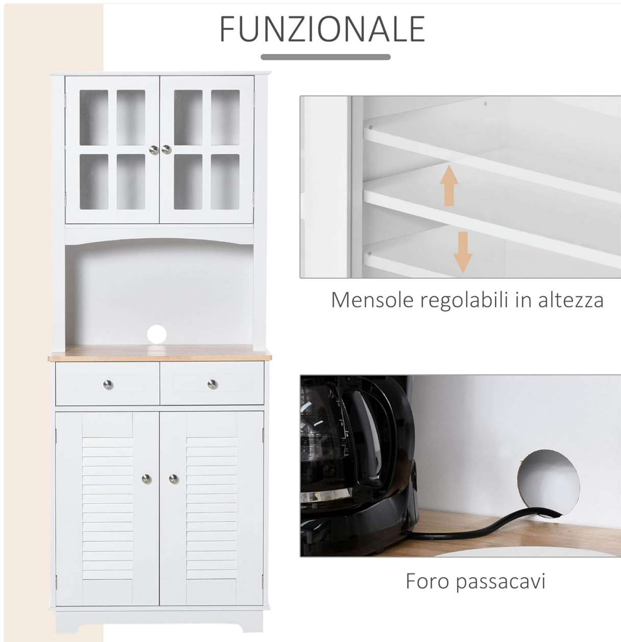
Figure 2.3: Close-up of adjustable shelves in the upper cabinet and the cable management hole on the countertop.