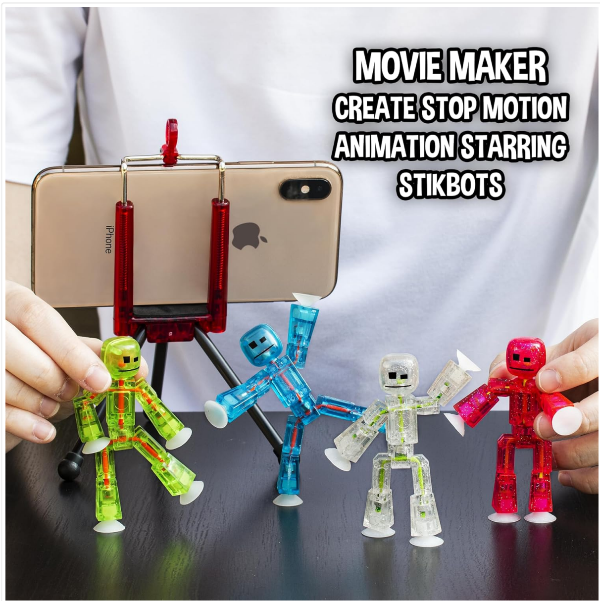
Image: Using the Stikbot Studio 2.0 app to capture stop motion frames.