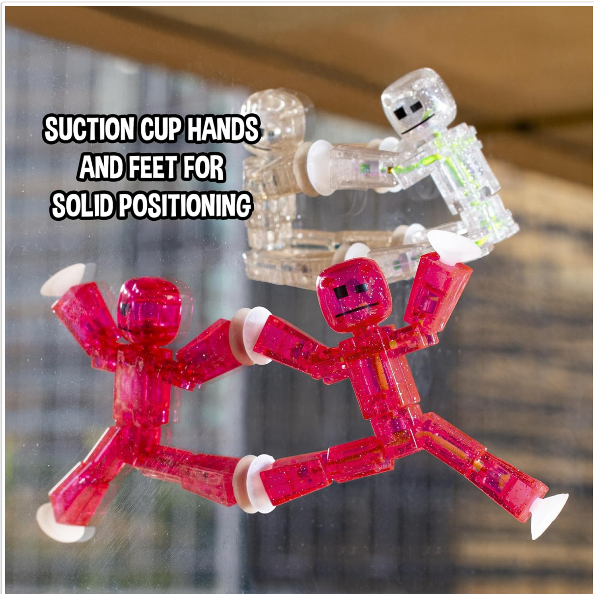
Image: Stikbots utilizing suction cups for stable positioning.