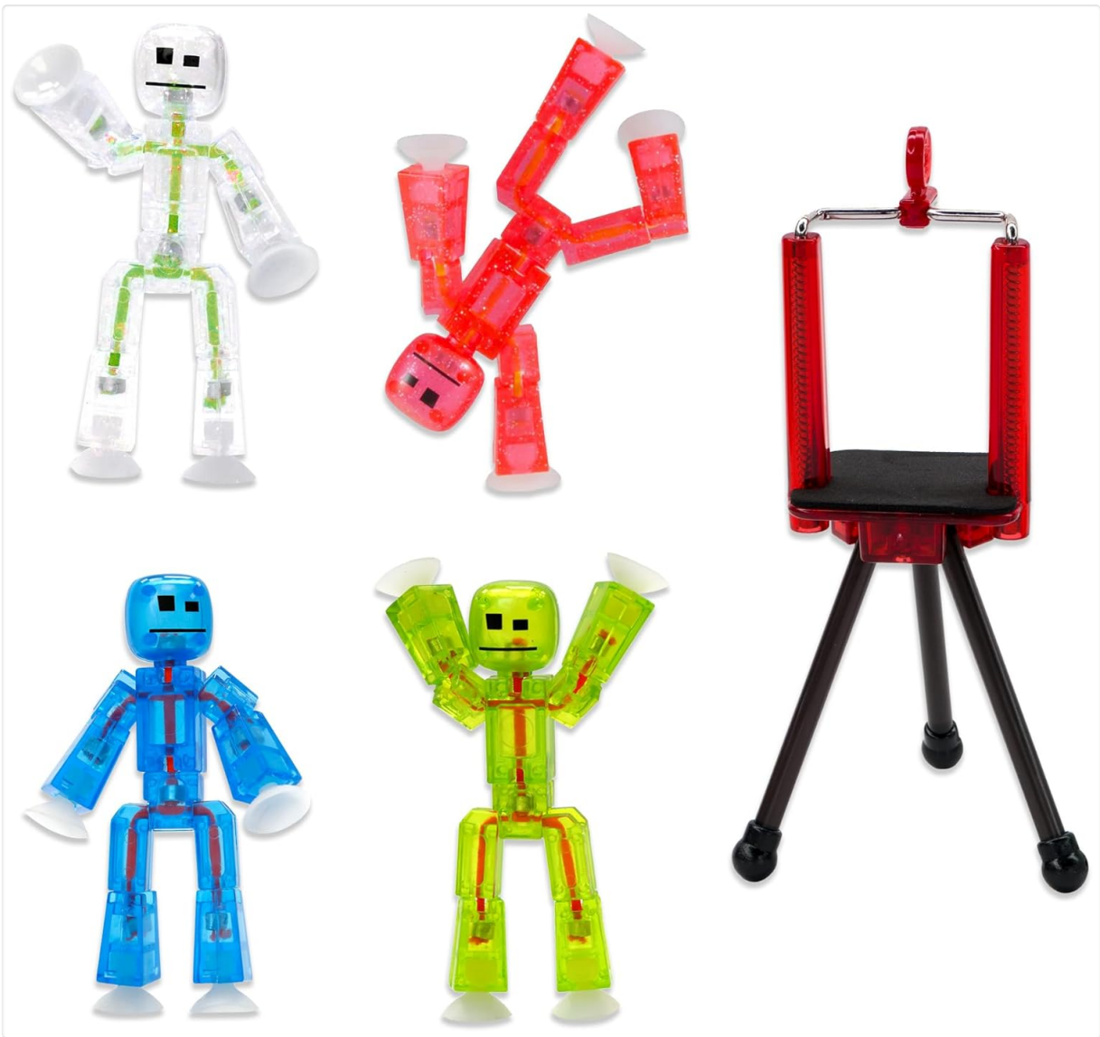
Image: Contents of the Zing Stikbots SB100-FF kit, including Stikbot figures and tripod.