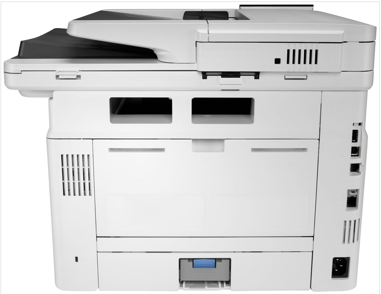
Image 3.1: Rear view of the printer, highlighting the Ethernet and USB ports for connectivity.