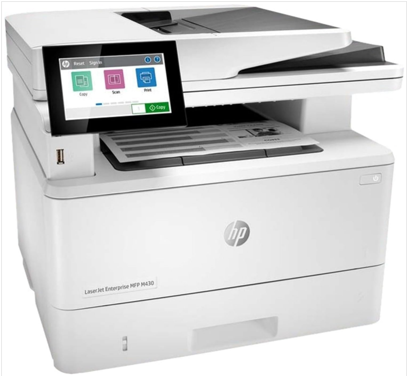
Image 4.1: Angled view of the printer, showing paper loaded in the main input tray and the touch control panel.