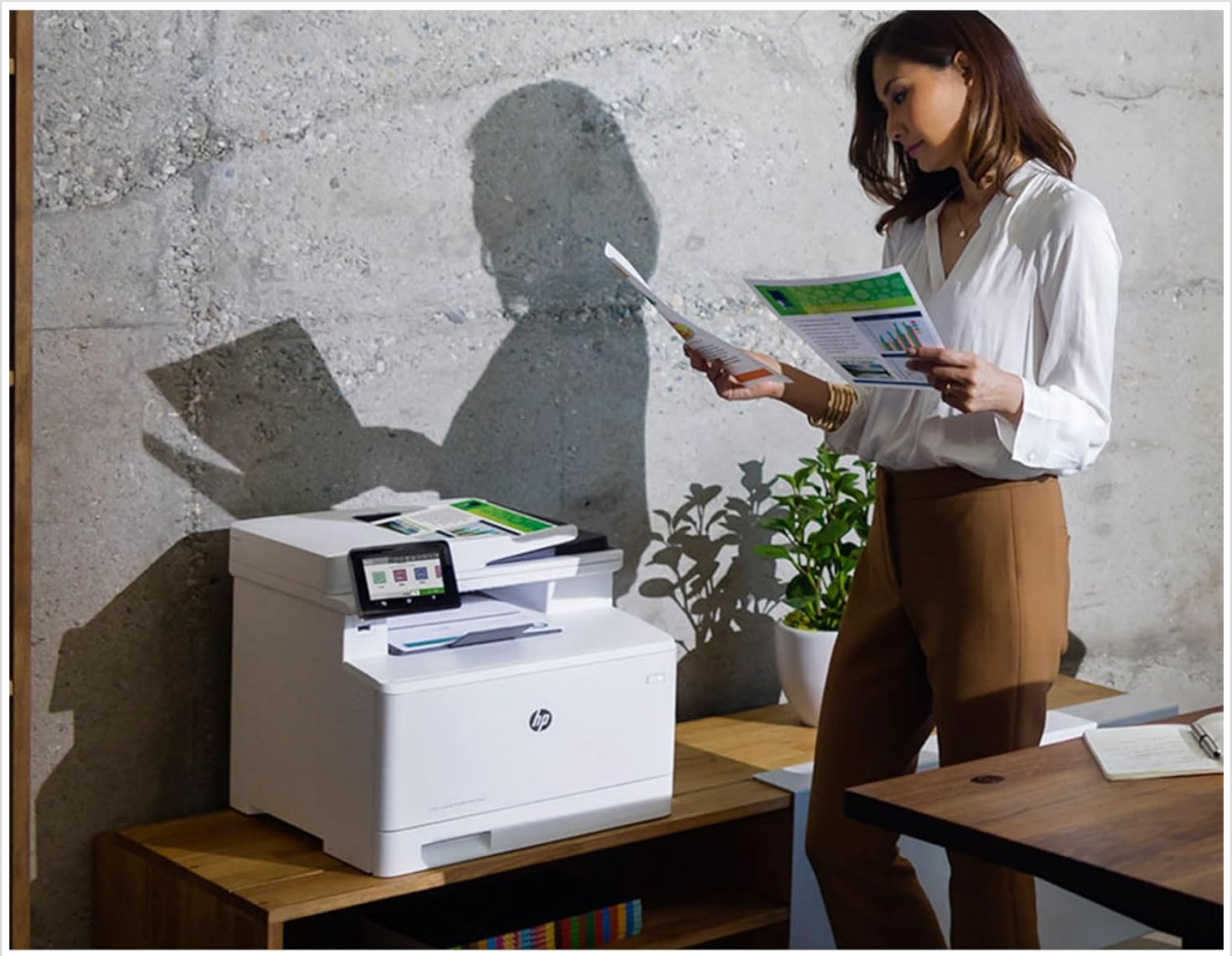
Image 2.2: The HP LaserJet Enterprise MFP M430f printer positioned on a desk in an office environment.