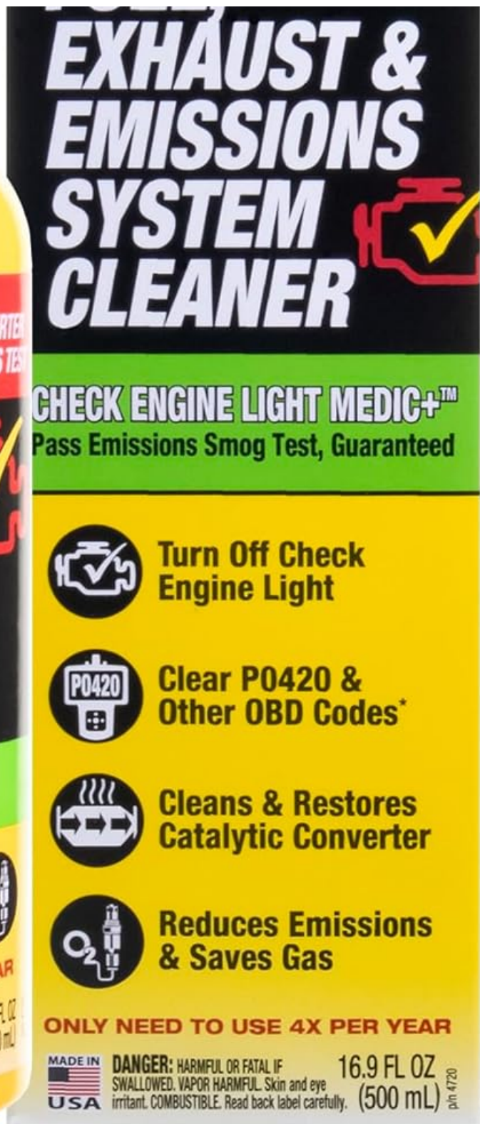
Image: Rislone 4720 Cat Complete Fuel, Exhaust and Emissions System Cleaner bottle.