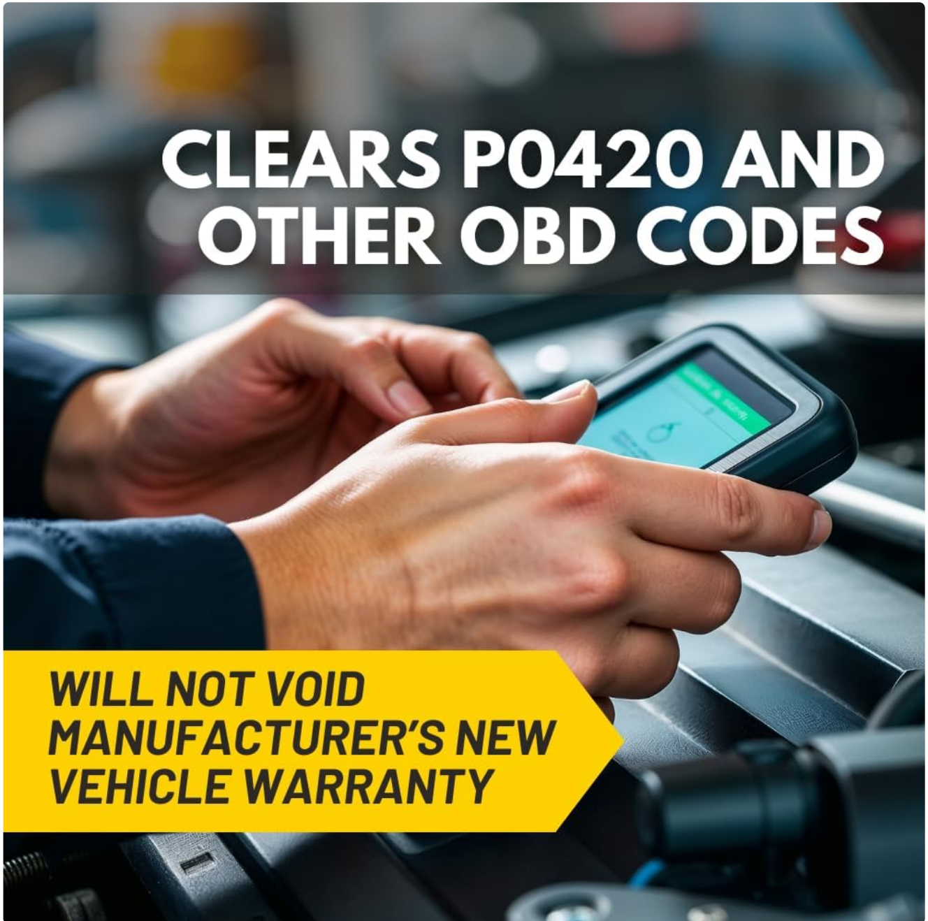
Image: A mechanic using an OBD-II scanner, illustrating the product's ability to clear diagnostic trouble codes like P0420.

If your Check Engine Light is on, especially with codes like P0420, P0421, P0430, or P0431, it often indicates an issue with the catalytic converter or oxygen sensors. Rislone 4720 helps clear these codes by cleaning the affected components, potentially turning off the CEL.