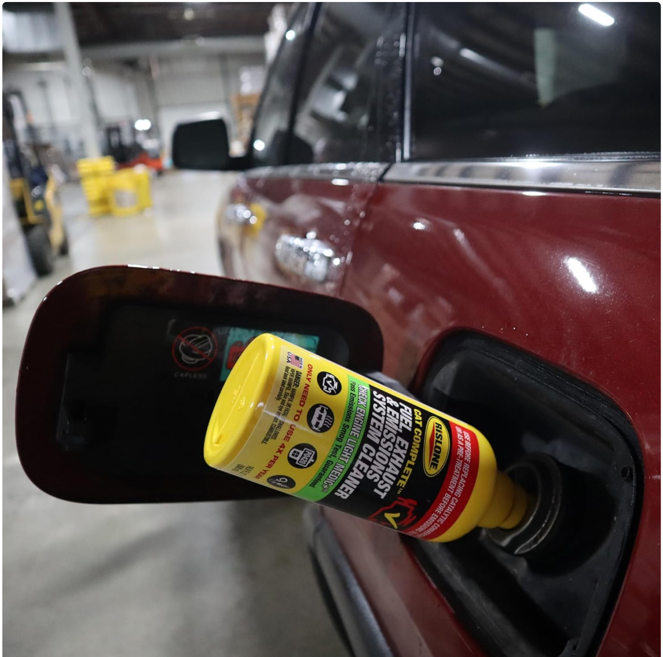
Image: A person pouring Rislone 4720 into a vehicle's fuel tank, demonstrating the application process.

For best results, add the product to a half-full tank of gasoline. For trucks, add to a quarter-full tank.