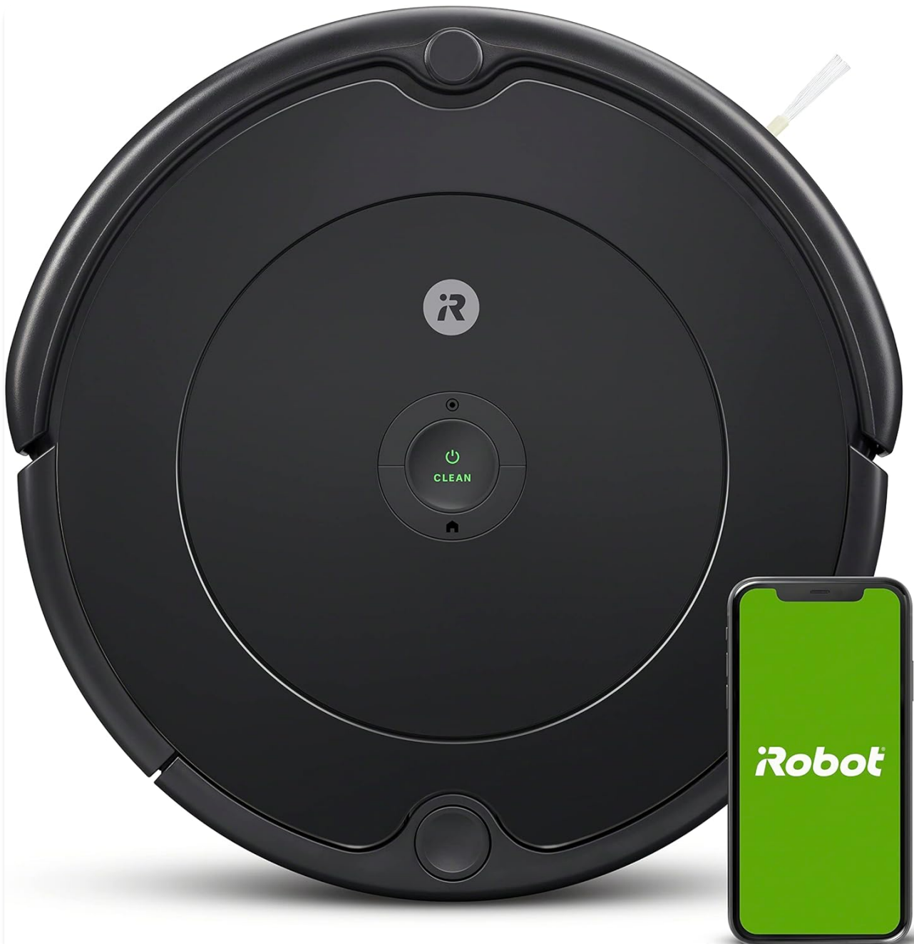
Image: The iRobot Roomba 694 Robot Vacuum, a circular charcoal grey device, is shown next to a smartphone displaying the iRobot Home App logo. This illustrates the vacuum's smart connectivity features.