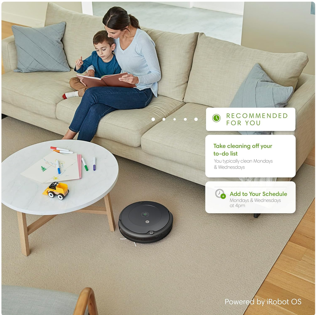
Image: The Roomba 694 is shown cleaning under a coffee table, demonstrating its ability to navigate under and around furniture for thorough cleaning.