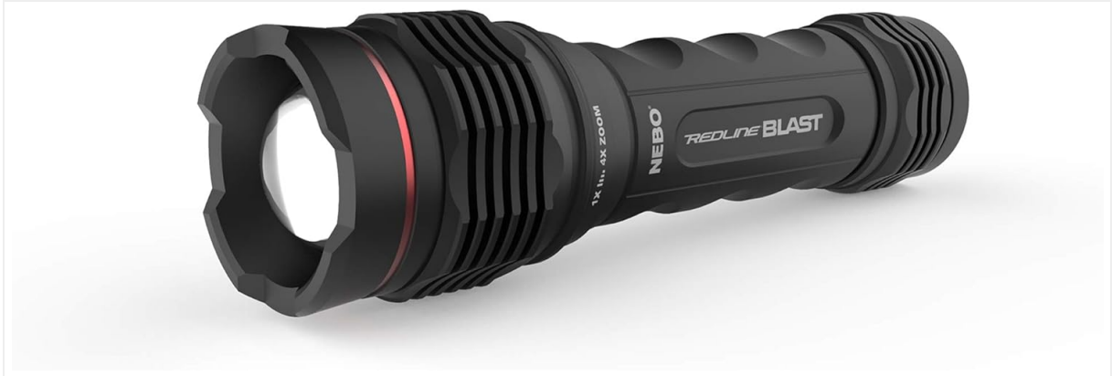
Image: The NEBO REDLINE Blast Flashlight demonstrating its waterproof capability.