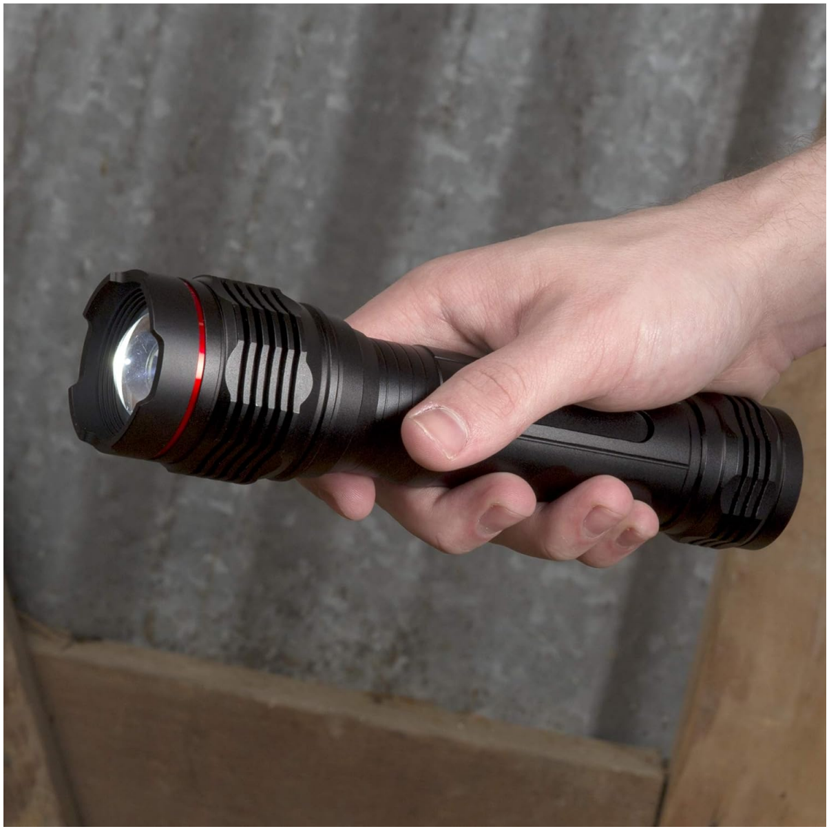
Image: A hand holding the NEBO REDLINE Blast Flashlight, illustrating the adjustable zoom mechanism.