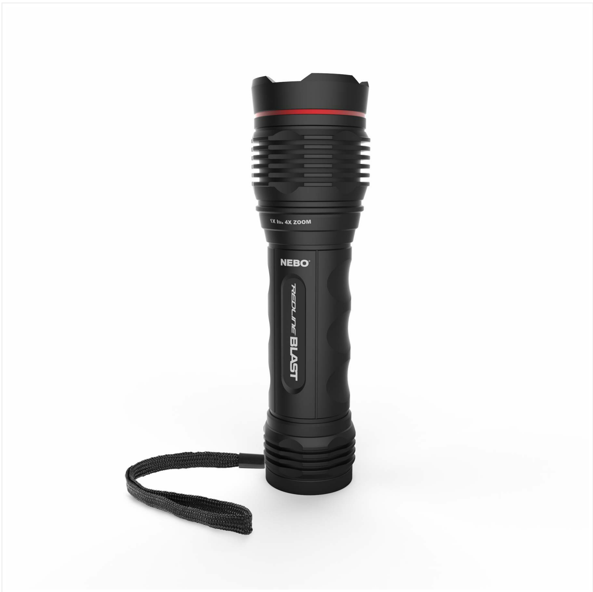
Image: NEBO REDLINE Blast Flashlight, showcasing its design.

The NEBO REDLINE Blast is a high-intensity LED flashlight designed for durability and performance. It features 1400 lumens of light output, a 4x adjustable zoom, and multiple light modes, all housed in a waterproof and impact-resistant aircraft-grade aluminum body.