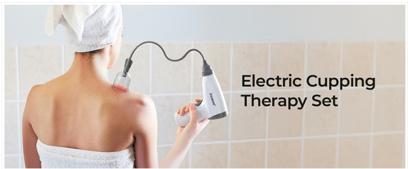
Image: Visual guide for setting up the electric cupping device, including attaching the extension tube and cups.