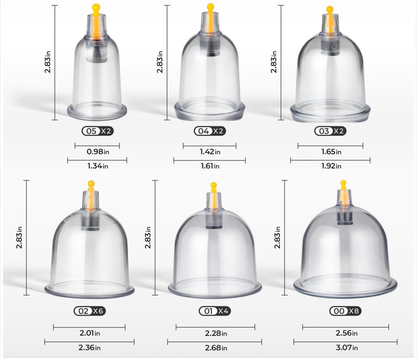
Image: Various sizes of the 24 vacuum suction cups included in the set, with their respective dimensions.