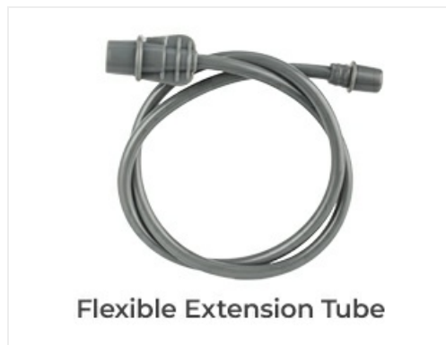
Image: The flexible extension tube for reaching difficult areas.