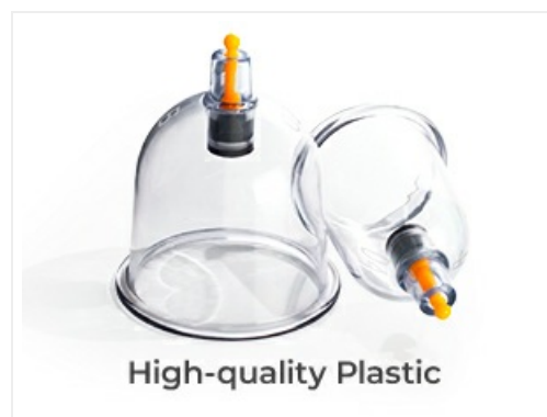
Image: Close-up of the durable, high-quality plastic cupping cups.