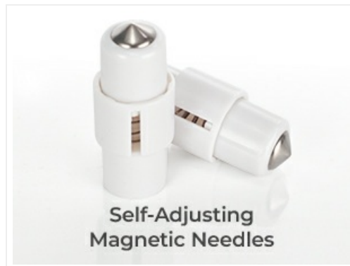
Image: The self-adjusting magnetic needles for enhanced therapy.