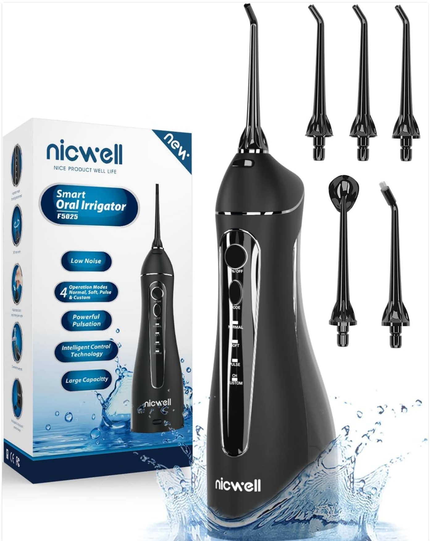
Figure 1: Nicwell Water Dental Flosser and included accessories.