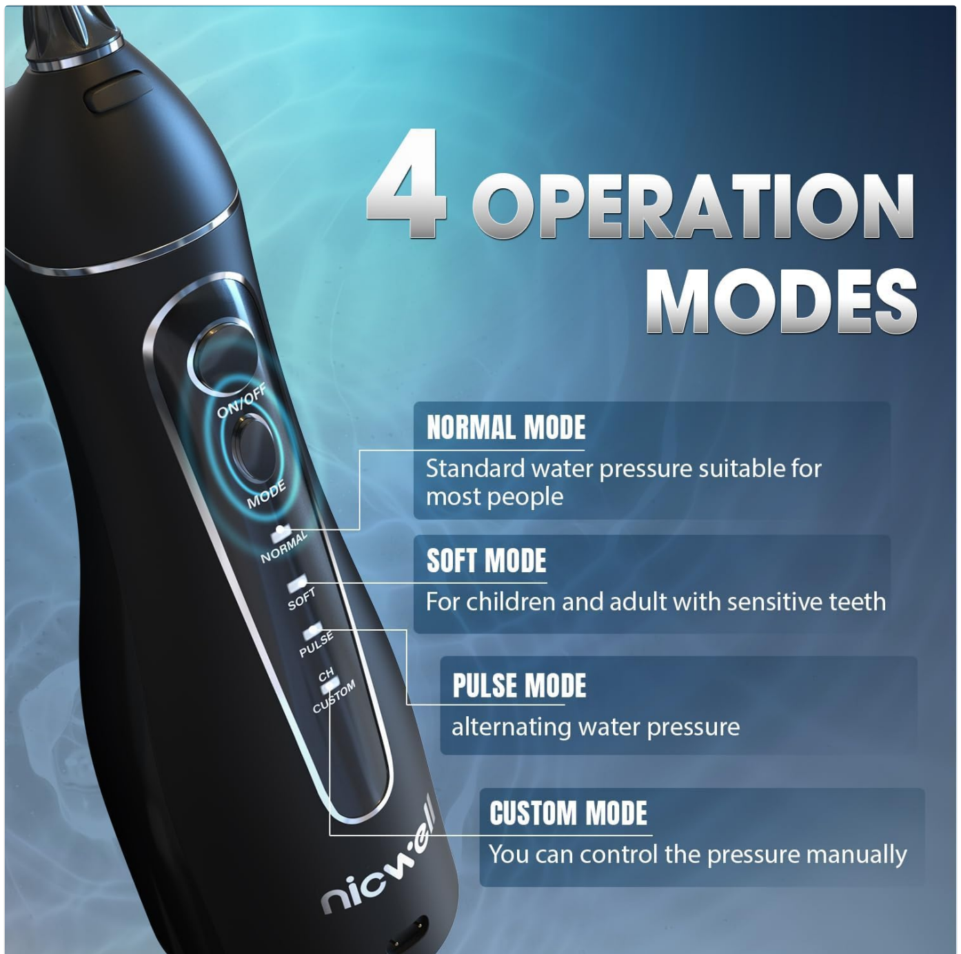
Figure 6: Control panel with mode selection options.