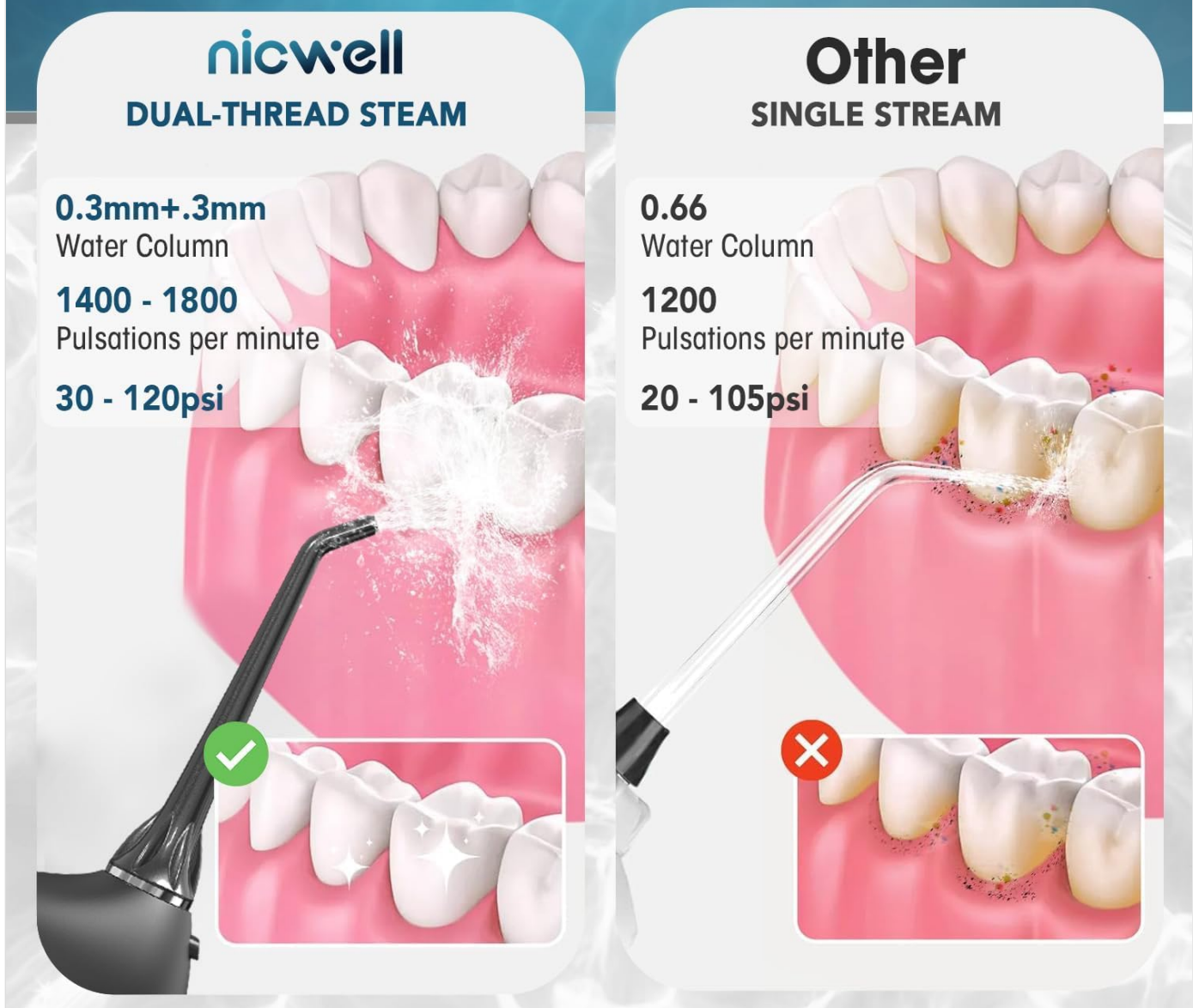
Figure 2: Illustration of the dual-thread water pulse technology for enhanced cleaning.