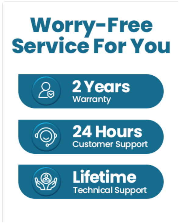
Figure 8: Nicwell's commitment to customer service and support.