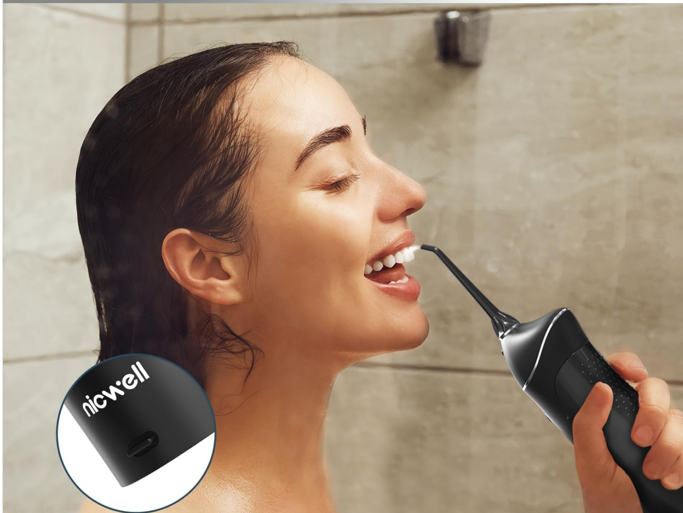
Figure 3: Charging options and battery life indication.

suitable for use in wet environments without the risk of damage