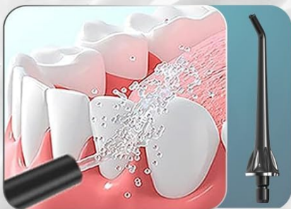
3 CLASSIC NOZZLES Daily Cleaning