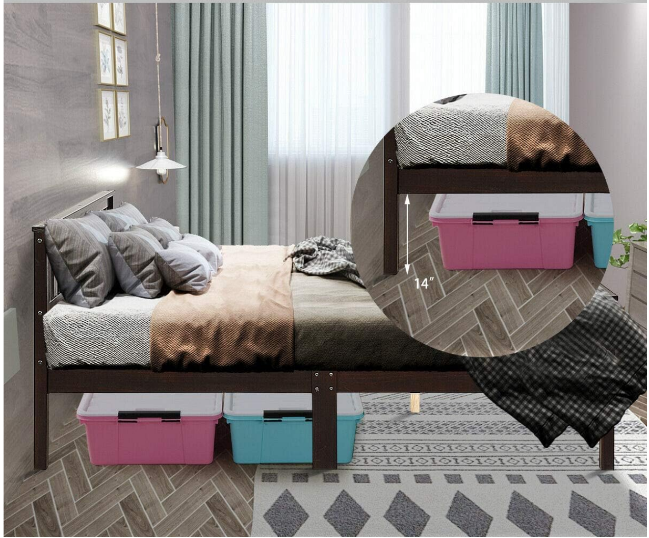
Figure 5.1: Illustration of the large under-bed storage space, demonstrating how the 14-inch clearance can be used for organizing items.