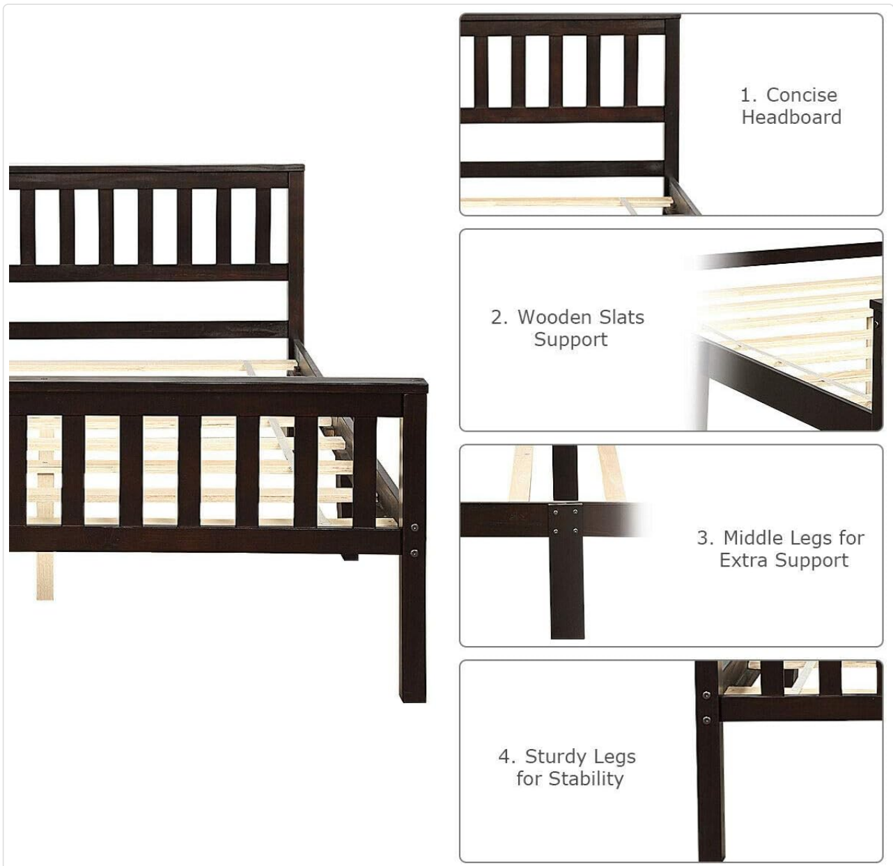
Figure 3.1: Component breakdown of the DORTALA Wood Bed Frame, illustrating the concise headboard, wooden slat support system, middle legs for extra support, and sturdy legs for overall stability.