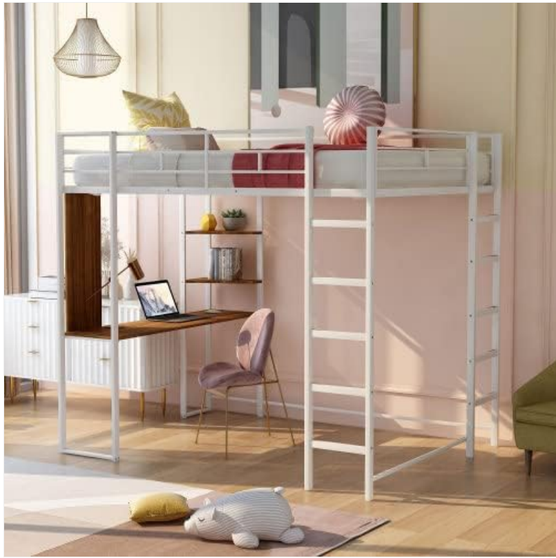
Image: Front view of the Bellemave Full Size Metal Loft Bed, showcasing the white metal frame, integrated wooden desk, and triangular shelves. The bed is set up in a room with a laptop on the desk and decorative items on the shelves.