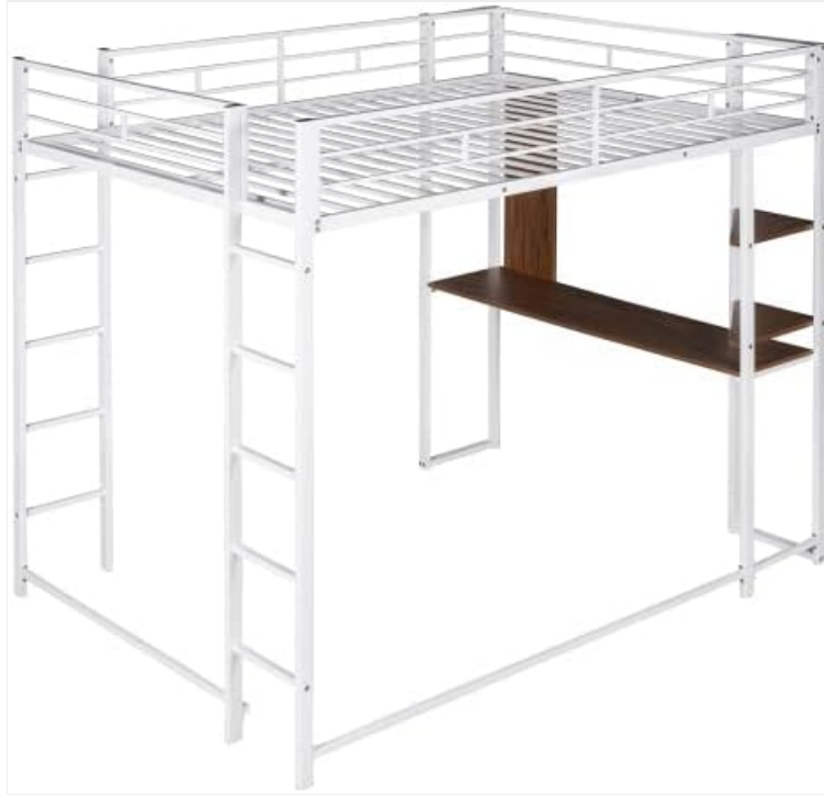
Image: Side perspective of the loft bed, providing a clear view of the ladder and the functional desk and shelving unit beneath the bed frame.