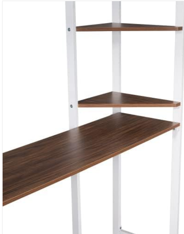
Image: Detailed view of the wooden desk surface and the two triangular shelves, highlighting their design and potential for organization and display.