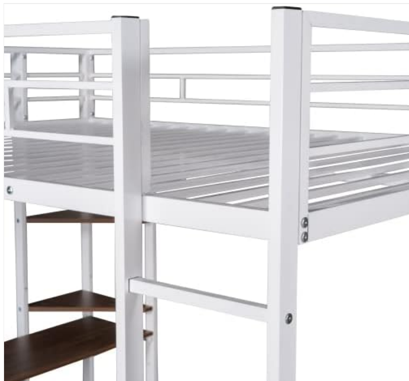
Image: Close-up detail of the metal frame construction, showing the secure connections and the attachment point for the ladder, emphasizing the bed's sturdy design.