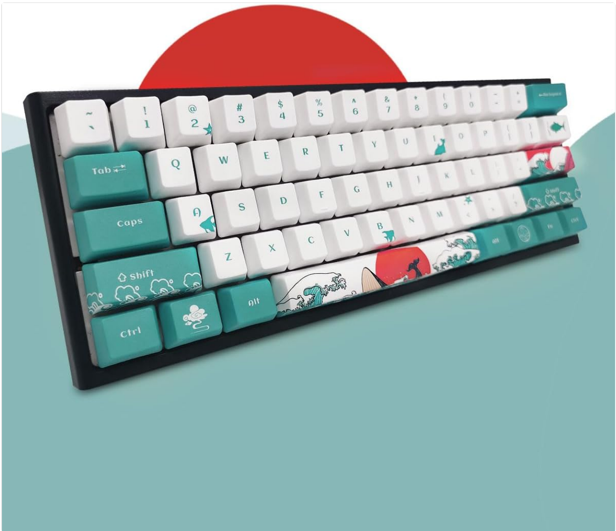
Image 2.2: Side view of the keycaps, demonstrating the OEM profile for ergonomic typing.