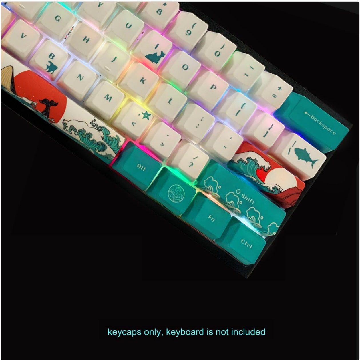
Image 6.1: Keycaps installed on a keyboard with backlighting, demonstrating the shine-through effect of the legends.