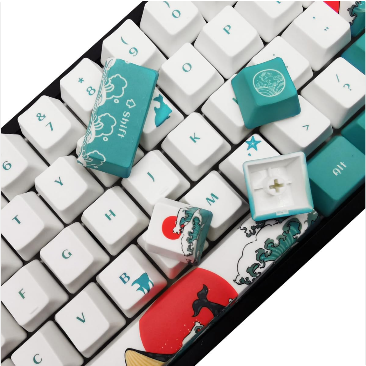
Image 5.1: A close-up view of the keycap's underside, showing the cross-shaped mount for MX-style switches.