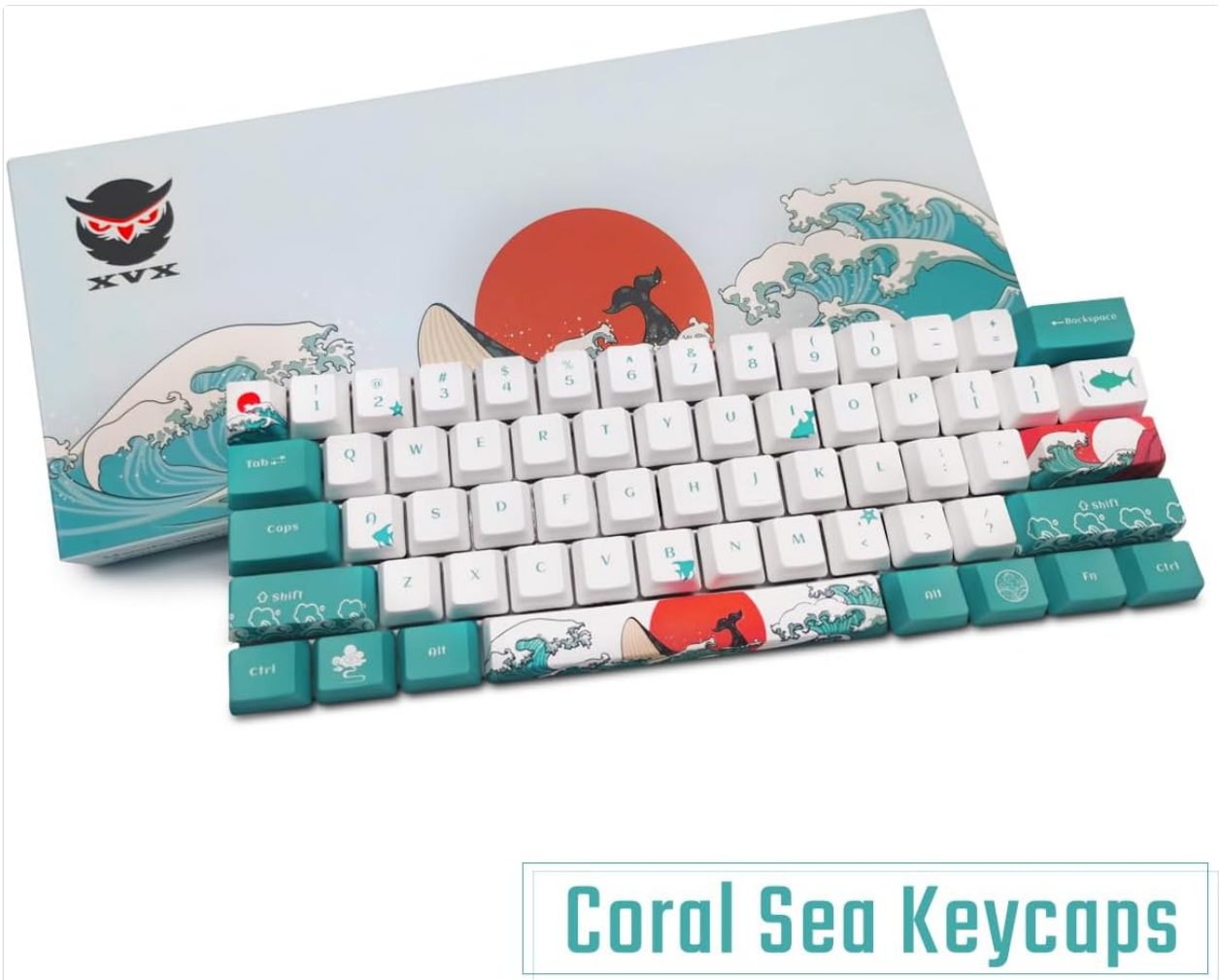
Image 4.1: The complete keycap set as packaged, including the keycap puller.