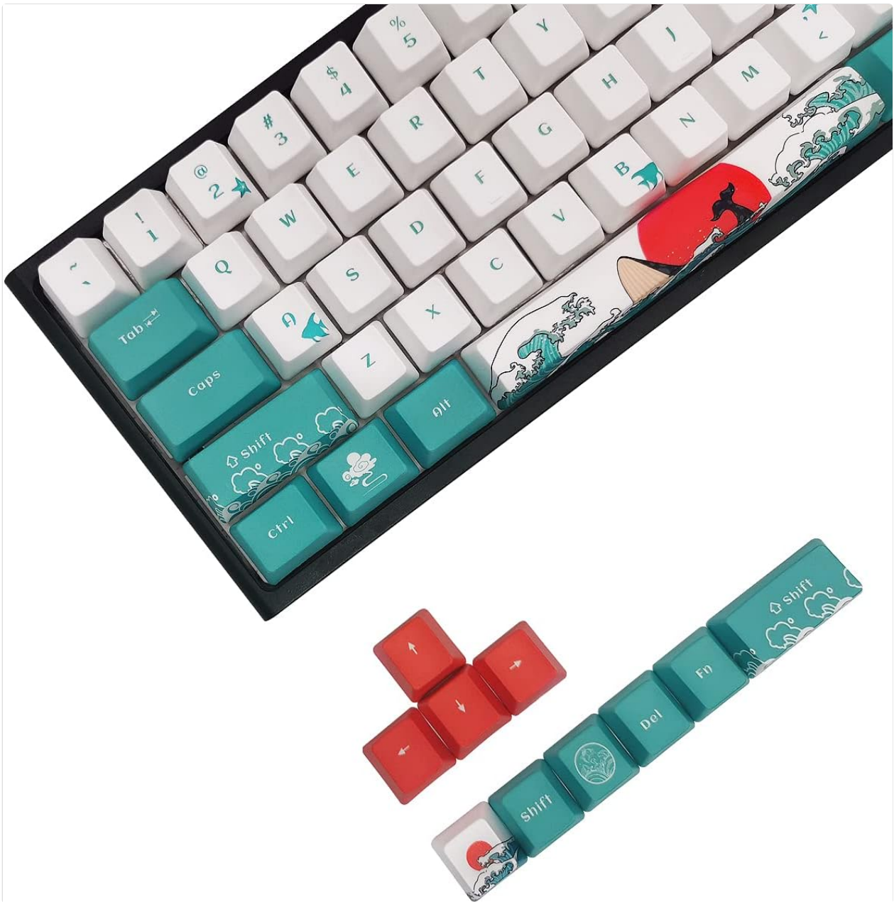
Image 2.1: Overview of the SDYZ 71-keycap set installed on a mechanical keyboard, alongside additional keycaps.