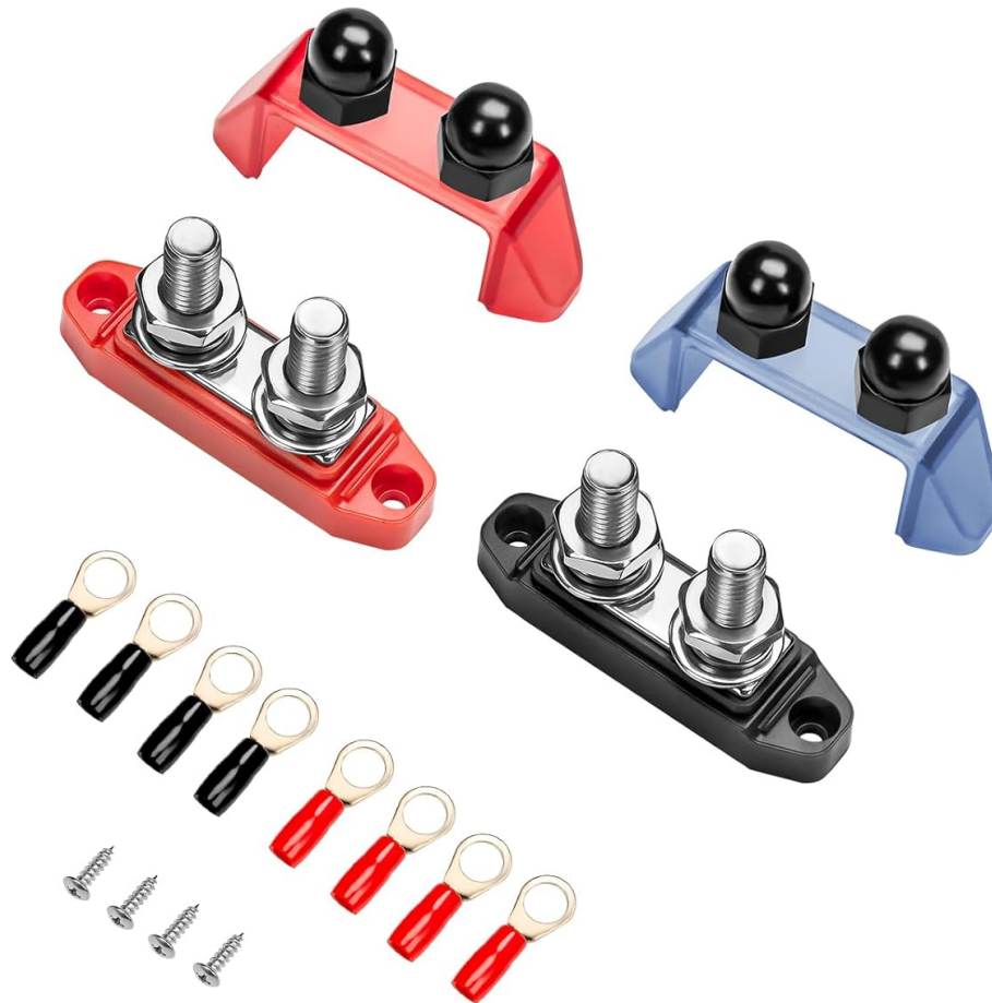
Image: Contents of the Recoil S2P-38 package, including two busbars (red and black), ring terminals, and mounting screws.