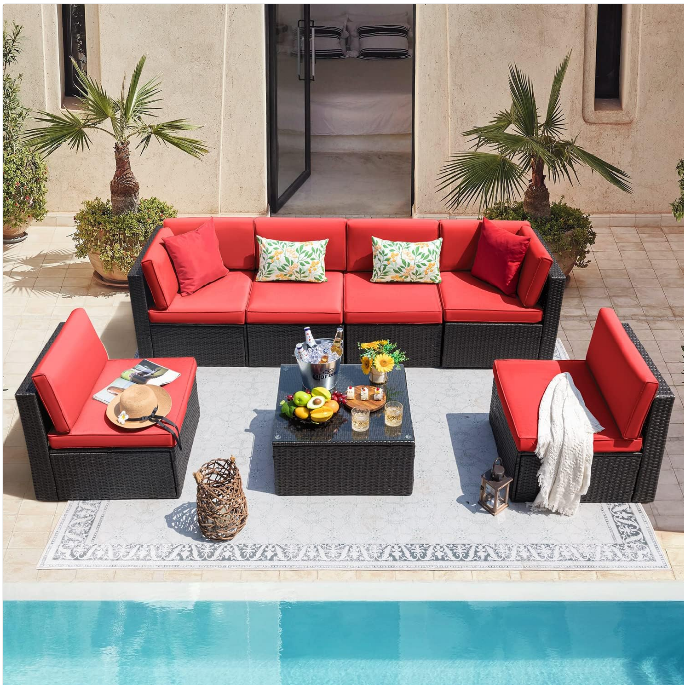
Image: The sectional sofa set configured in an L-shape, demonstrating its versatility in an outdoor patio setting with a swimming pool in the foreground.