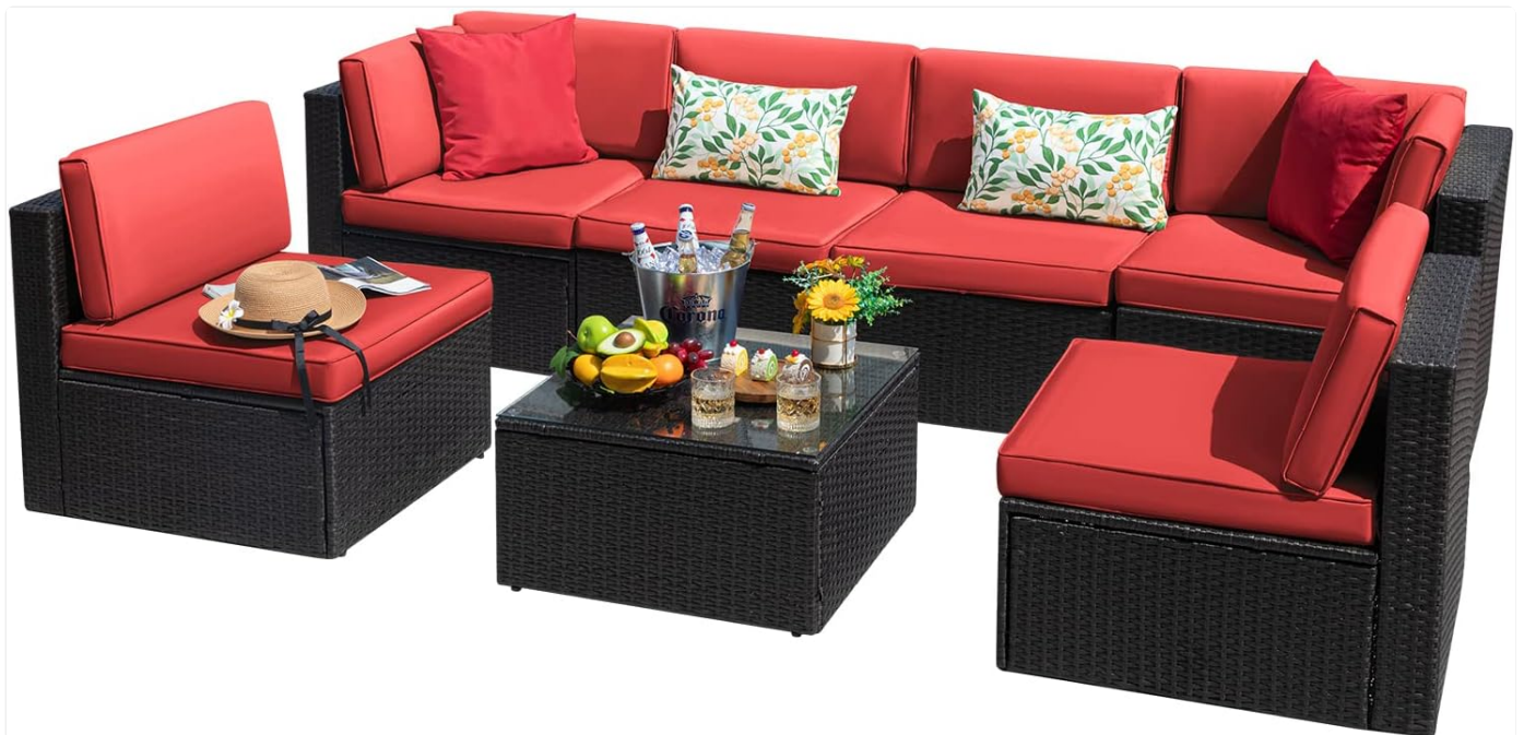
Image: The complete Devoko 7-piece outdoor sectional sofa set, featuring black wicker frames, vibrant red cushions, and a central glass-top coffee table. The set includes various seating modules for flexible arrangement.

This manual provides detailed instructions for the assembly, operation, maintenance, and troubleshooting of your Devoko 7 Pieces Outdoor Sectional Sofa Patio Furniture Set. Please read this manual thoroughly before assembly and use to ensure proper function and longevity of your product. Keep this manual for future reference.