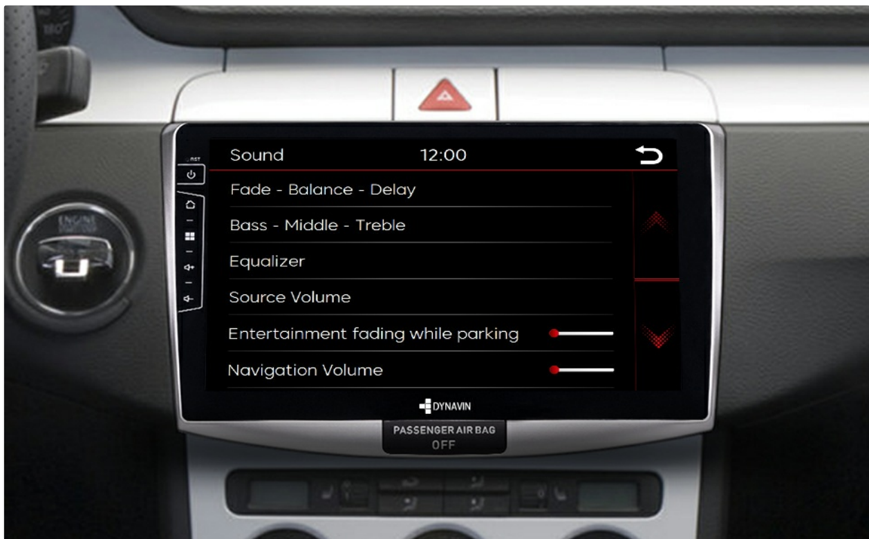
Image: Illustrates the sound capabilities of the DYNAVIN D8-B6S Flex, highlighting the 100W x 4 Class-D High Power Amplifier and 15 years of research in car audio design for optimal sound without replacing original speakers.