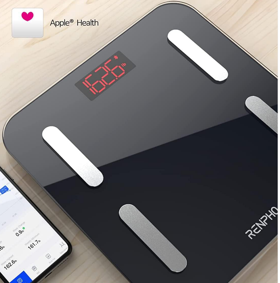
Image: Screenshot showing the Renpho Health app's compatibility with various third-party fitness applications.