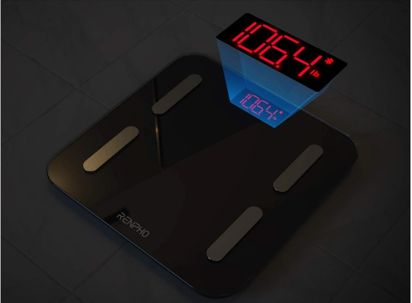
Image: Close-up of the RENPHO scale's clear LED display showing a weight reading.

The bright and clear LED display can read the results effortlessly at any time and anywhere