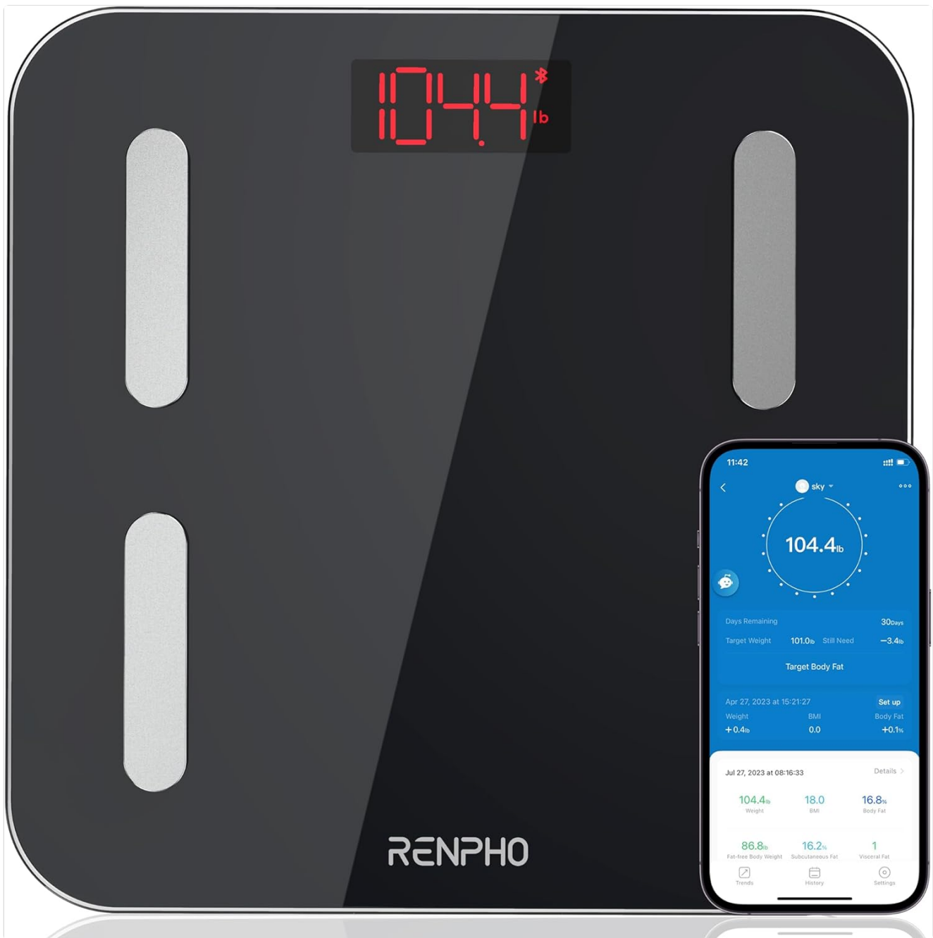
Image: RENPHO Digital Bluetooth Body Fat Scale displaying weight, with a smartphone showing the connected app interface.