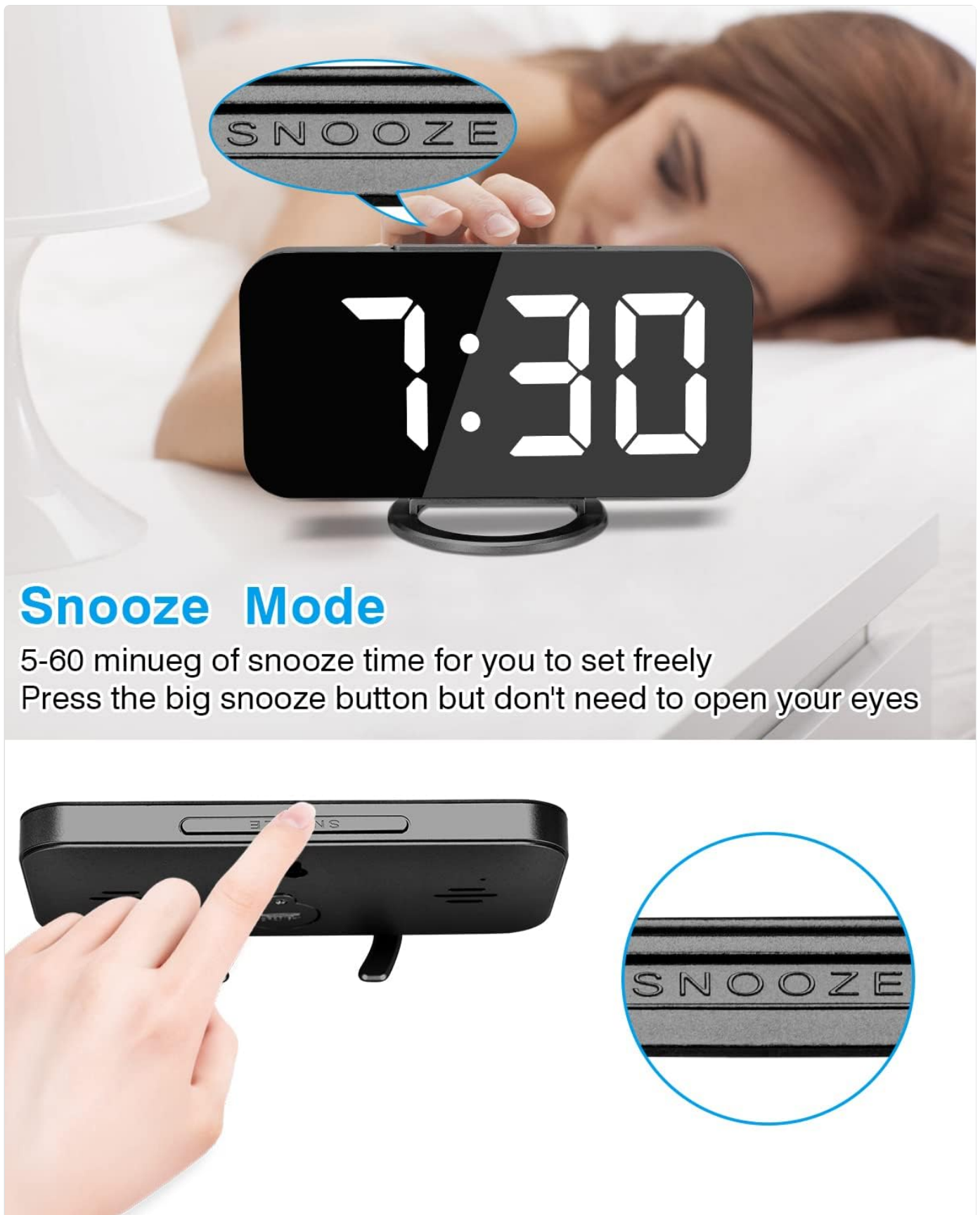
Figure 5: Using the Snooze function.