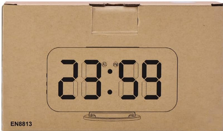
1 X Packing box