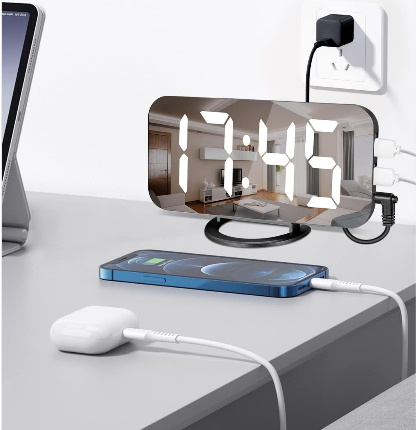
Figure 7: Dual USB Charging Ports in use.