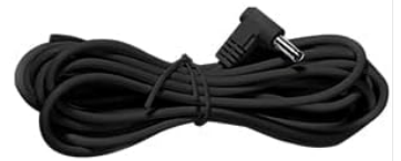
1 X USB Power Cable