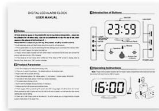
1 X User Manual