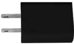
1 X Power Adapter