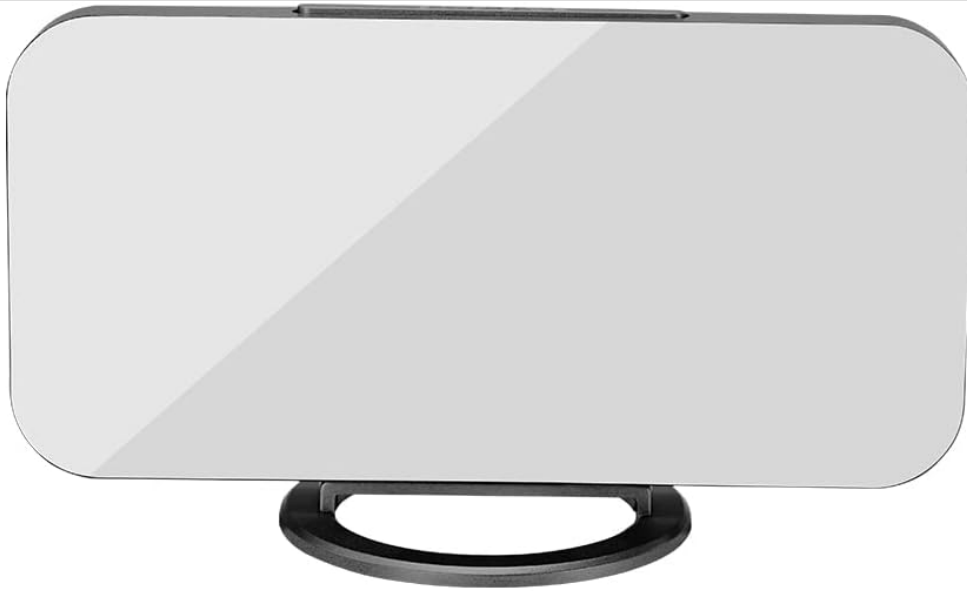
1 X Digital Alarm Clock