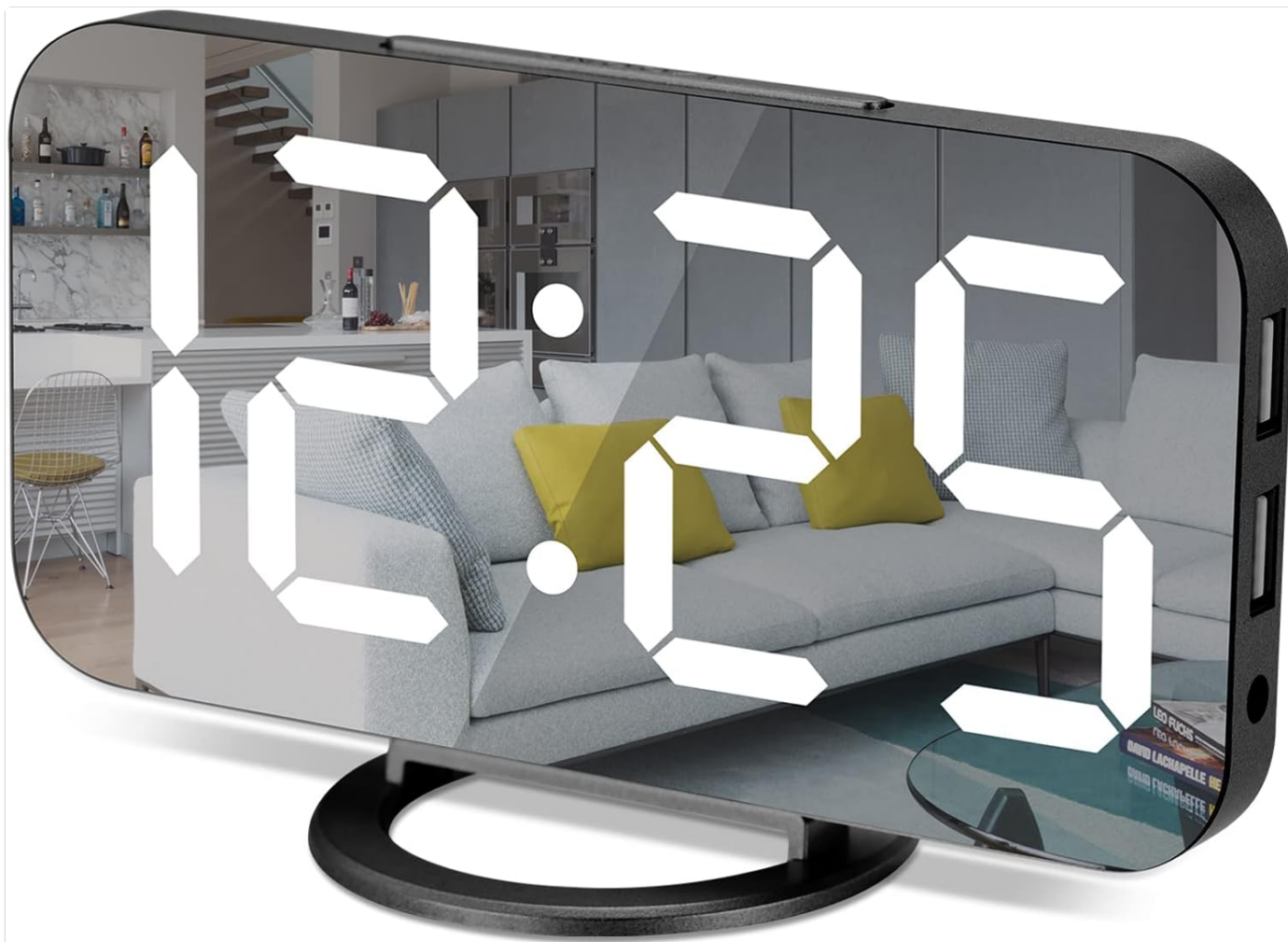
Figure 3: Front view of the Digital Alarm Clock.