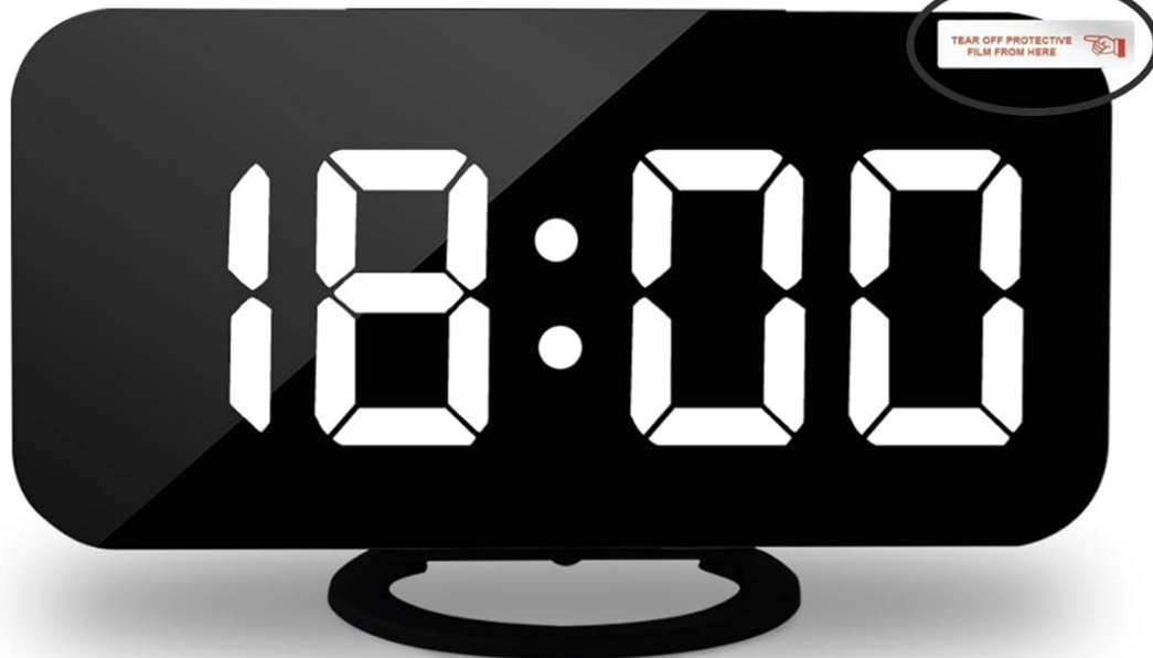
Figure 1: Removing the protective film from the display. This step is crucial for clear visibility.