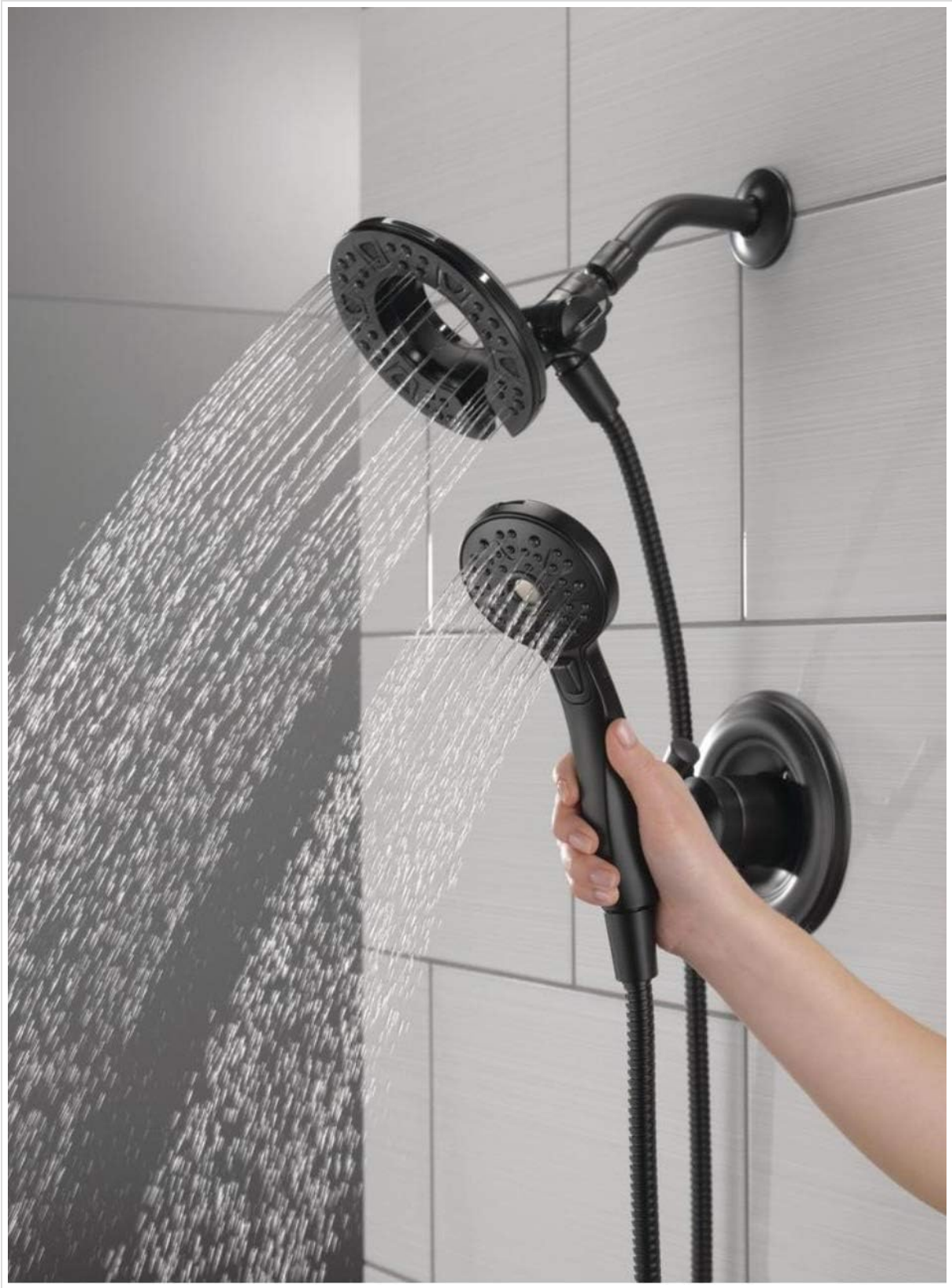
This image displays the DELTA In2ition 2-in-1 shower faucet installed in a modern bathroom. Water is actively flowing from both the fixed overhead shower head and the handheld unit, demonstrating its dual functionality. The faucet features a sleek matte black finish, complementing the white tiled shower wall.