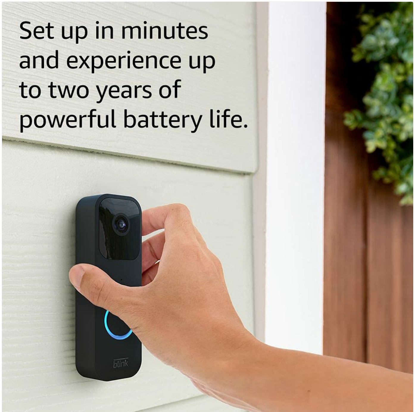
Image 2.2: The Blink Video Doorbell with text highlighting its two-year battery life, indicating long-lasting performance.