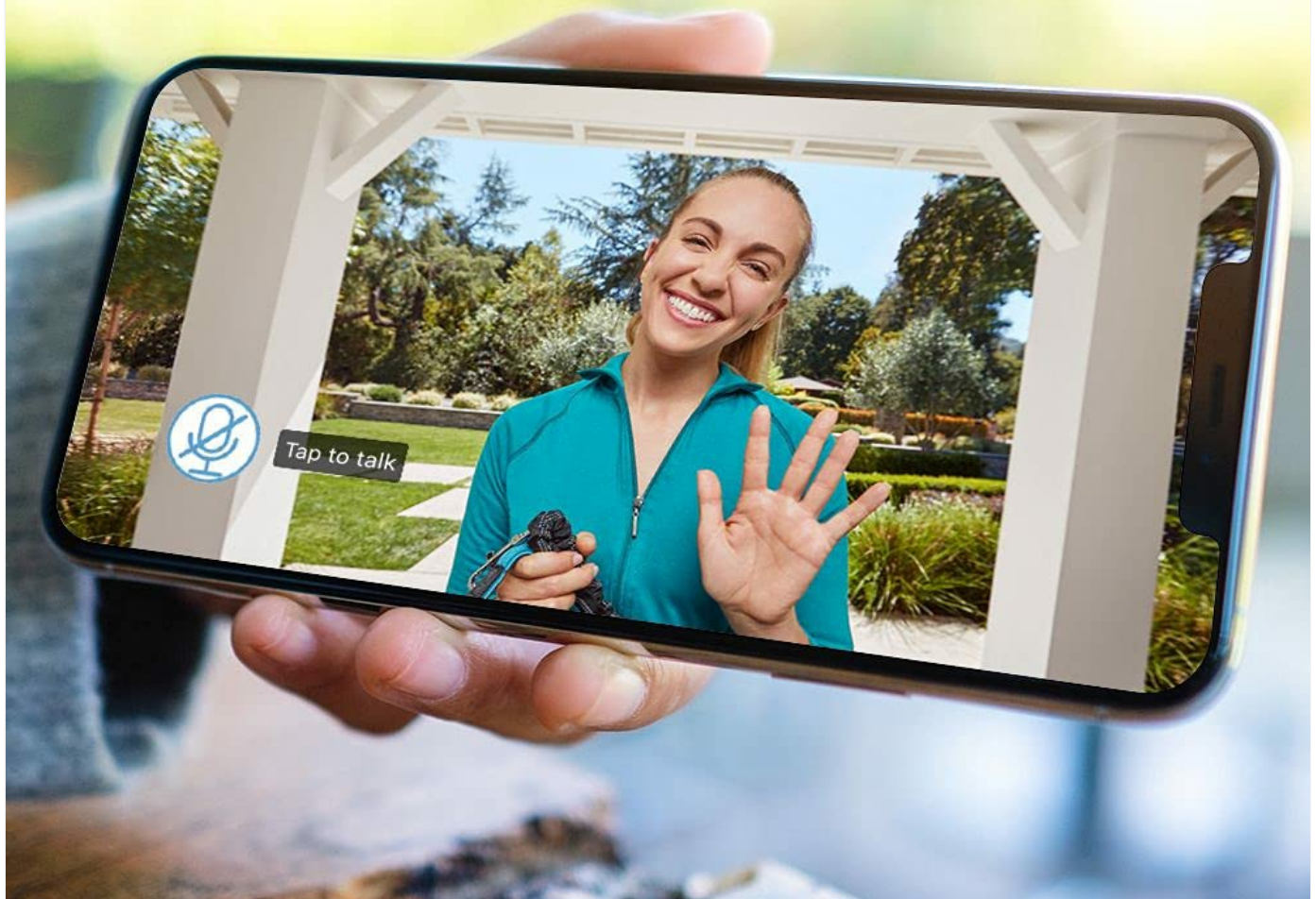
Image 3.1: A smartphone displaying the Blink app interface, showing a live video feed and a 'Tap to talk' button for two-way audio communication.

Answer your door no matter where you are from the Blink app.