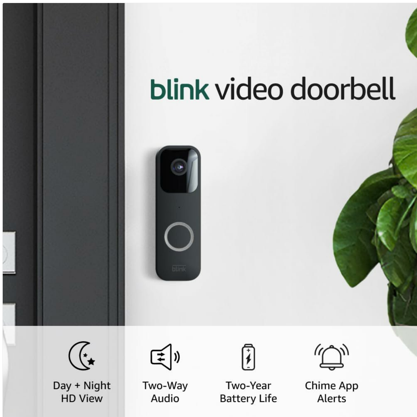
Image 1.1: The Blink Video Doorbell and Sync Module 2, showcasing the sleek design of the doorbell and the compact Sync Module.