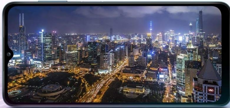
Figure 3.3: Overview of the Galaxy A12's Octa-core processor, 4GB RAM, and 64GB ROM.