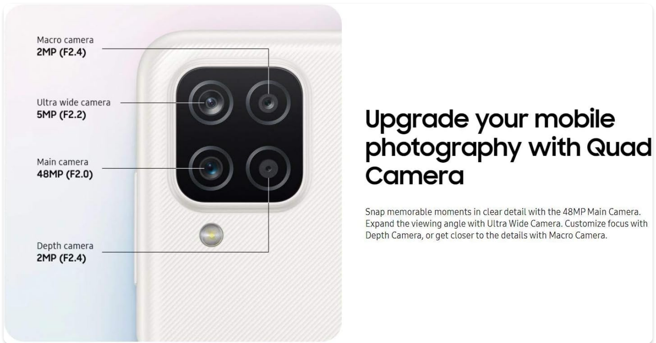
Figure 4.1: Detailed view of the Samsung Galaxy A12's Quad Camera system, highlighting each lens type.