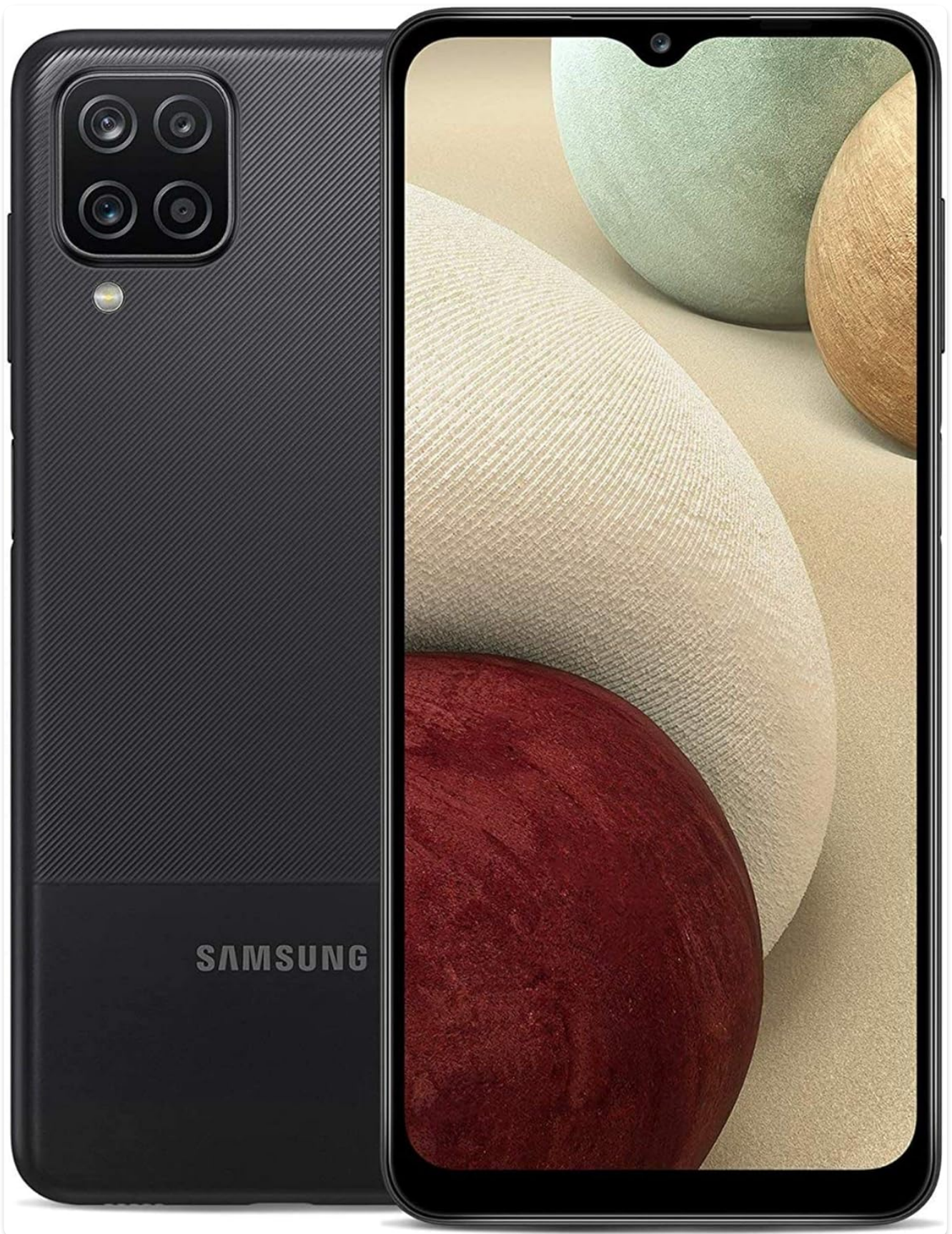
Figure 1.1: Front and back view of the Samsung Galaxy A12, showcasing its sleek design and quad-camera setup.