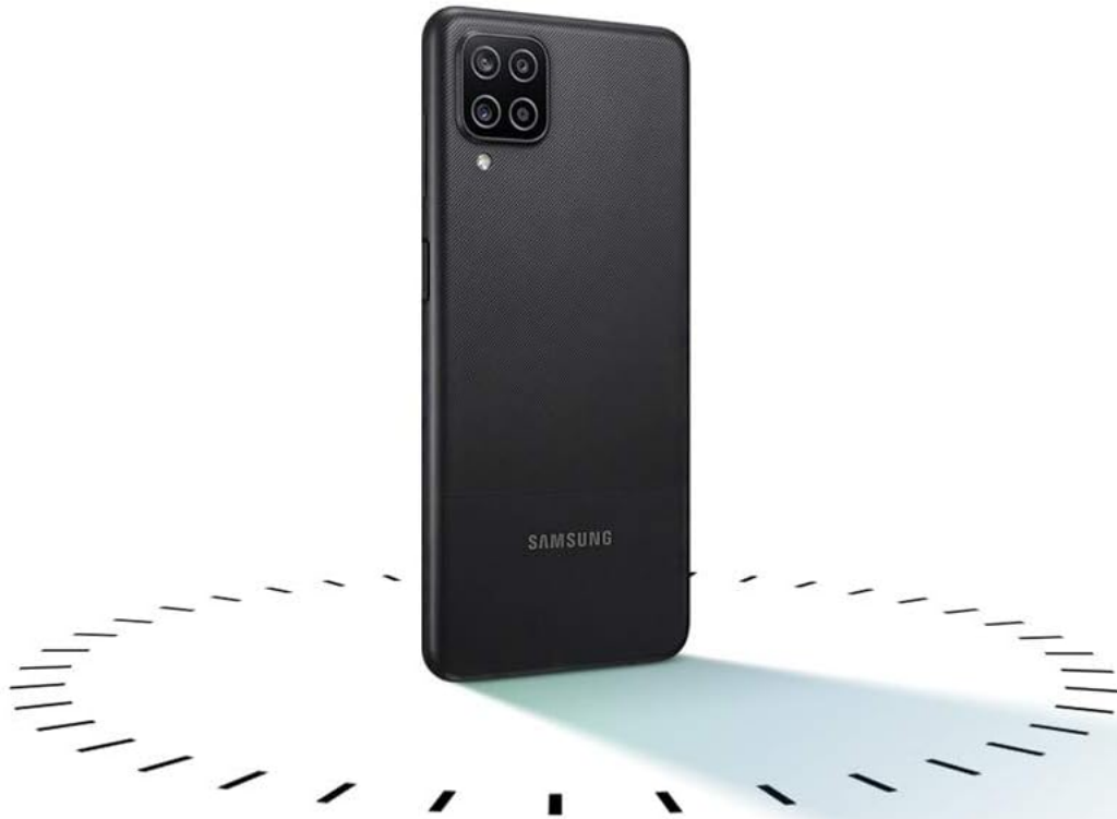
Figure 3.2: The Samsung Galaxy A12 with its 5000mAh battery and 15W fast charging capability.